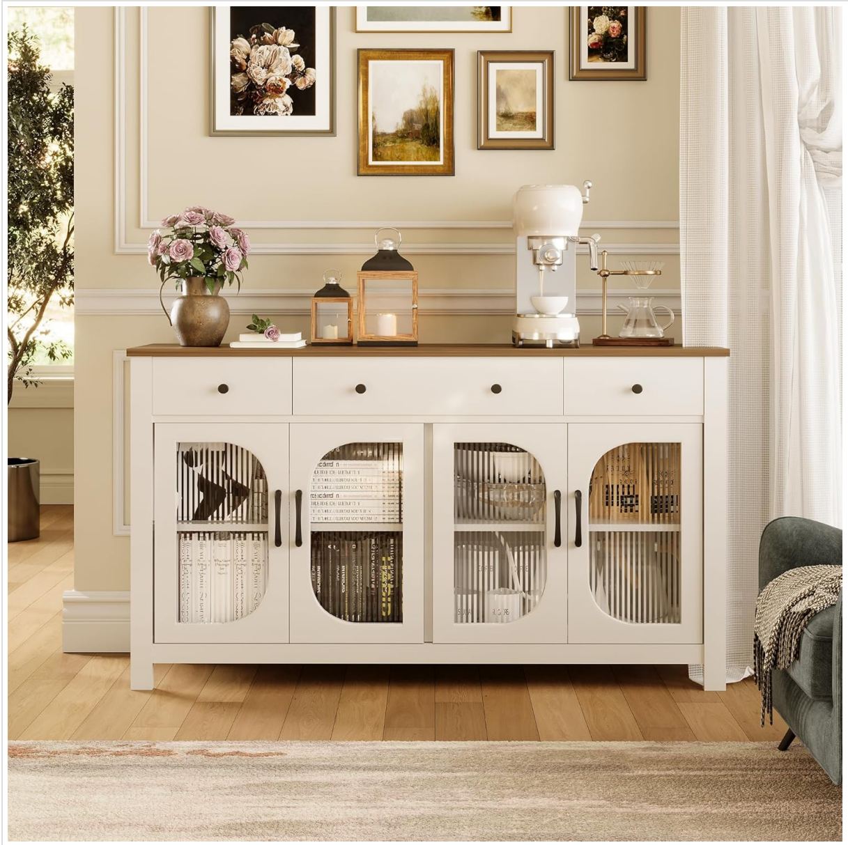
Image 1.1: The spanspace 55" White Sideboard Buffet Cabinet, showcasing its design and storage capabilities in a home environment.