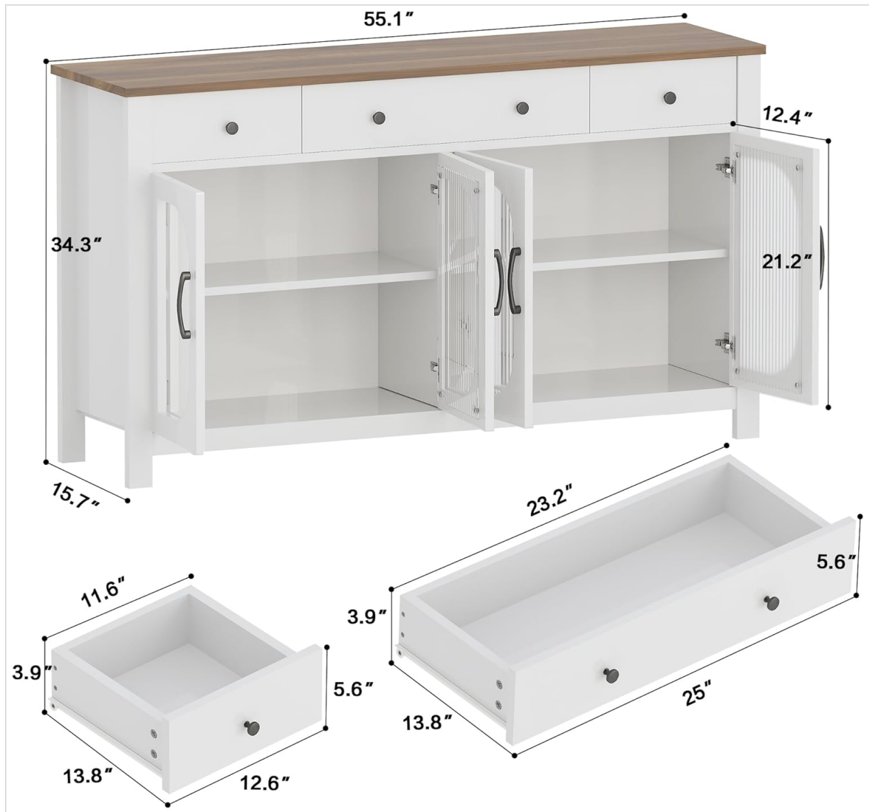
Image 3.1: Detailed dimensions of the cabinet, including overall size and individual drawer measurements.