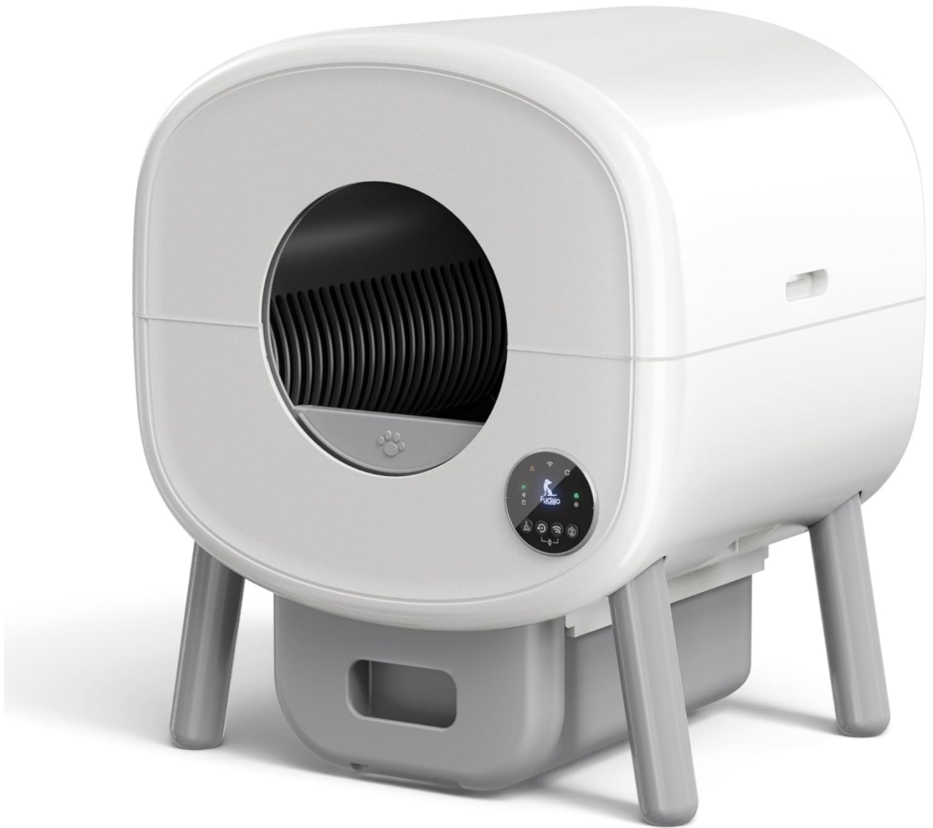
Image: The Fudajo Self-Cleaning Cat Litter Box, showcasing its sleek design and front entrance.