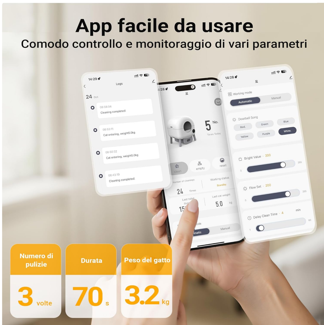
Image: The user-friendly mobile application interface, showing various control and monitoring options for the litter box.