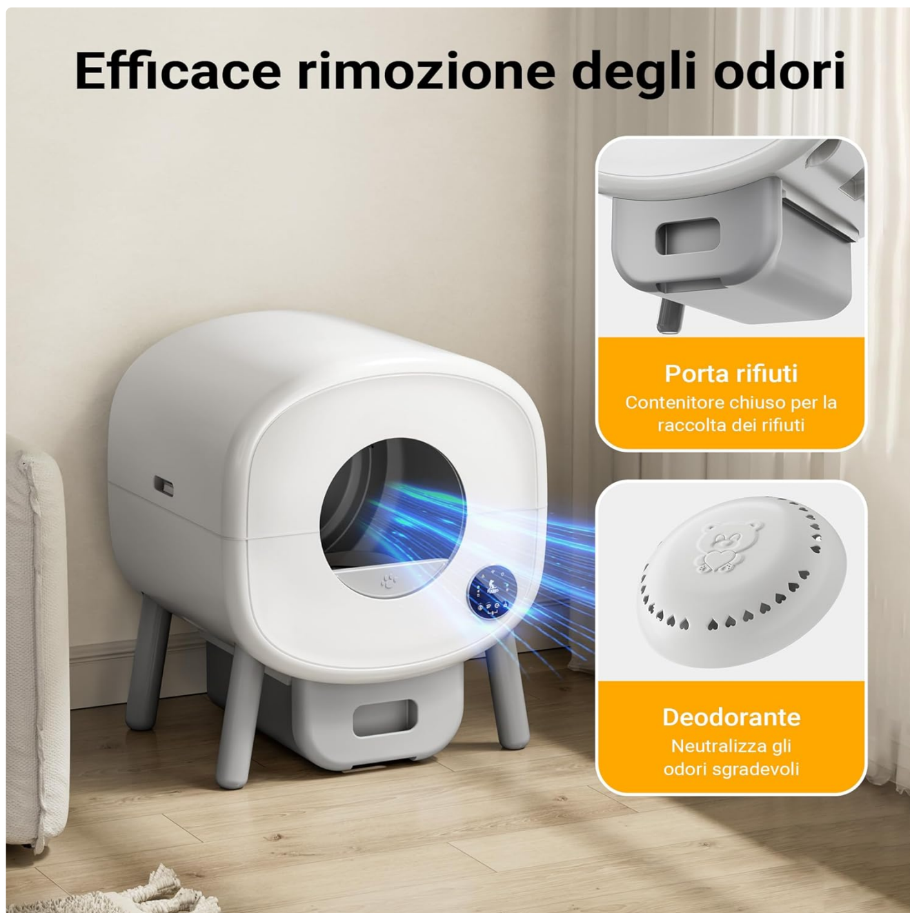
Image: Illustration of the odor removal system, highlighting the sealed waste bin and deodorizer component.

The unit is designed with a closed waste container and includes a deodorizer to effectively neutralize unpleasant odors, ensuring a fresh environment.