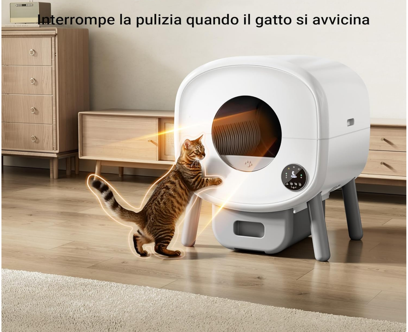
Image: The infrared sensor system, designed to detect cat presence and ensure safety during operation.

Interrompe la pulizia quando il gatto si avvicina