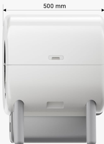
Image: Detailed product dimensions, illustrating the overall size and key measurements of the litter box.