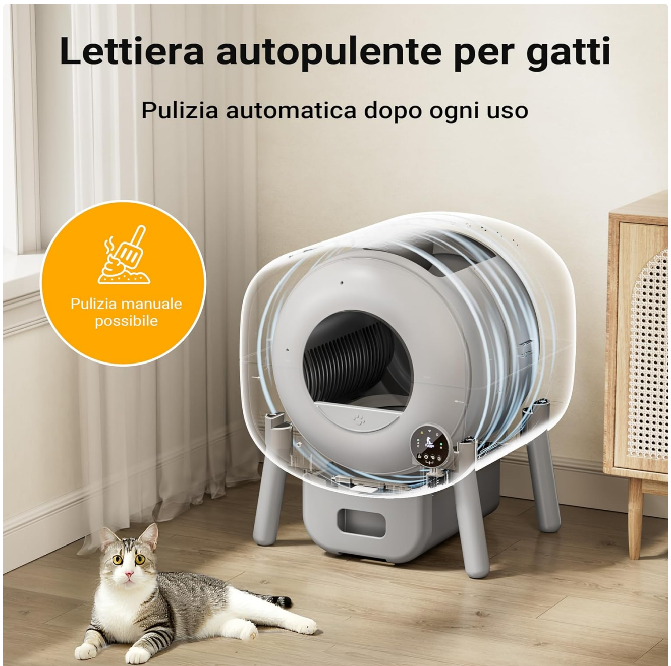
Image: The litter box showing the manual cleaning option, highlighting its versatility.