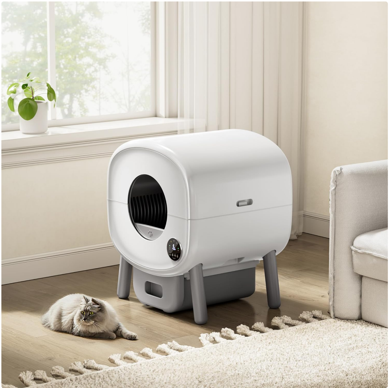
Image: The litter box integrated into a modern home environment, with a cat resting nearby.