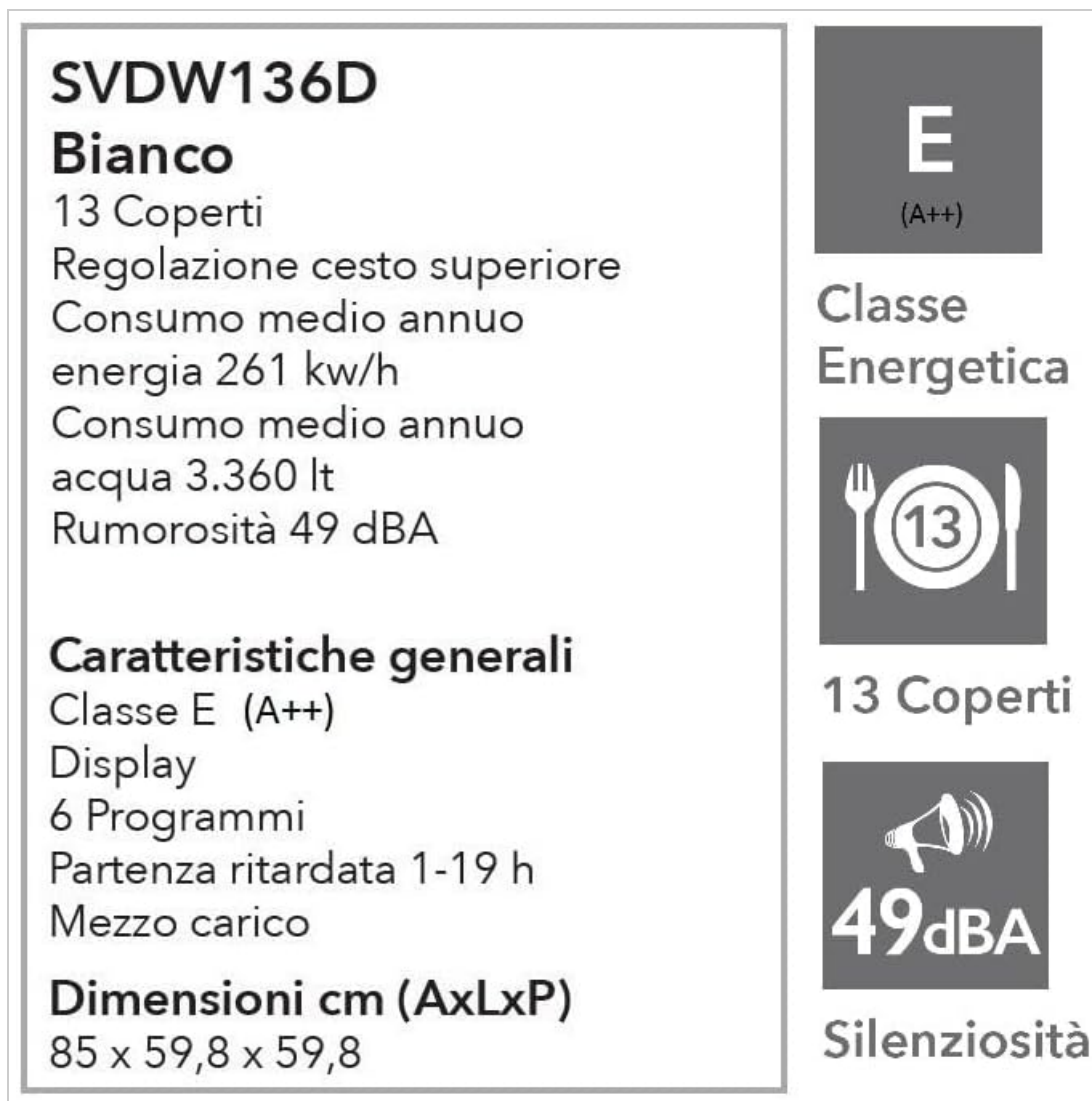
Figure 7.2: Product Specifications Summary. This image summarizes key features and specifications, including capacity, programs, and dimensions.