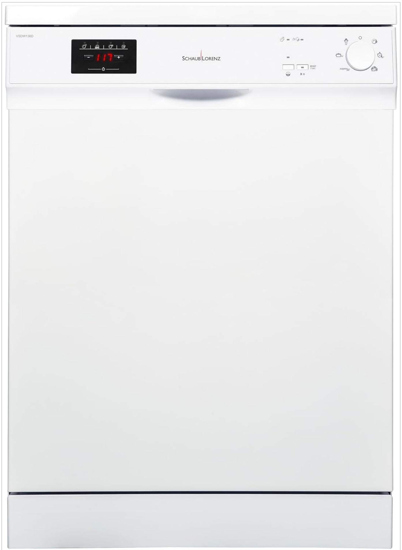
Figure 4.1: Front View of the Dishwasher. This image displays the overall appearance of the dishwasher, including its white finish and the control panel at the top.