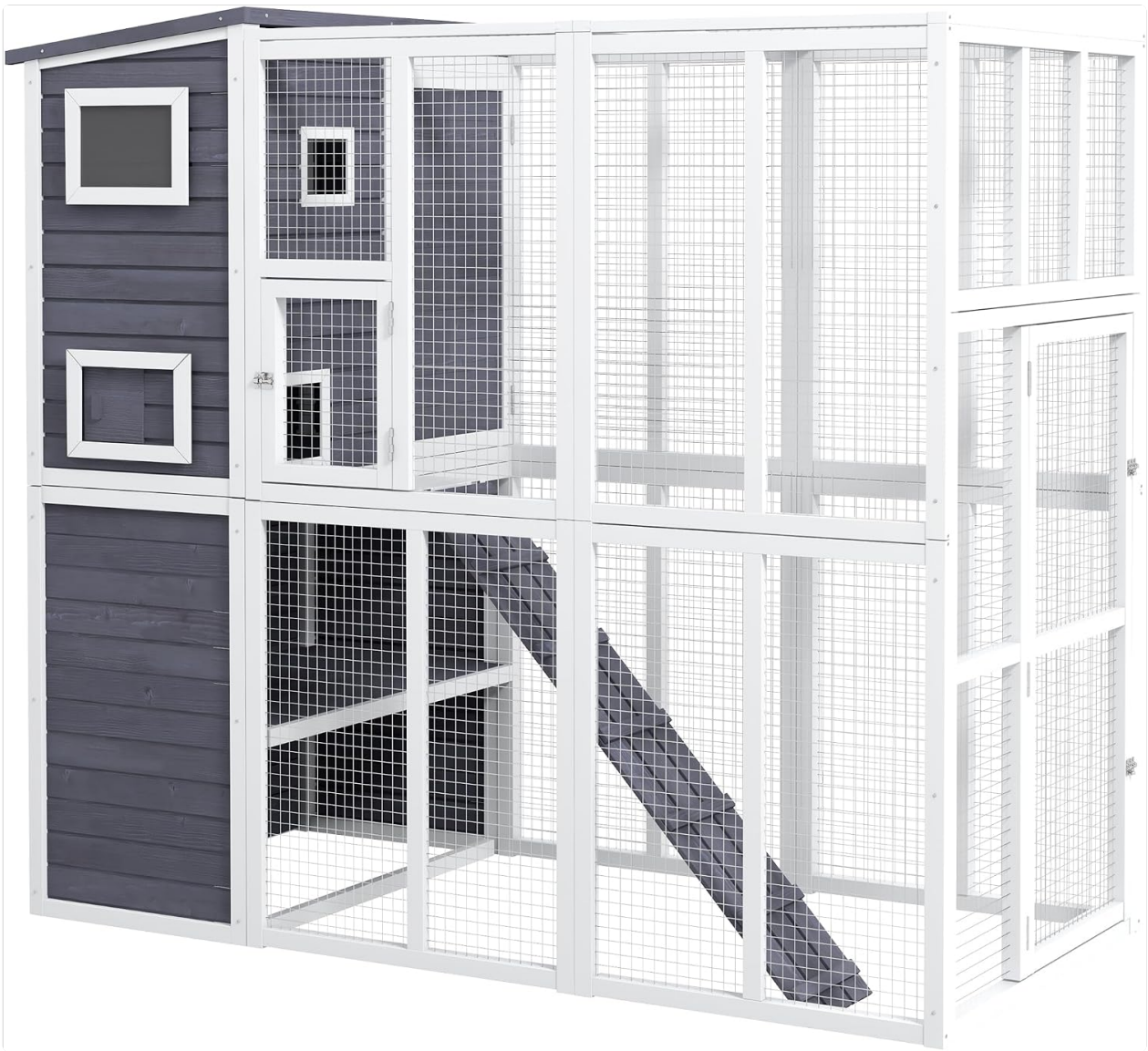
Image: A detailed front view of the catio, highlighting its two-tone design and mesh panels.