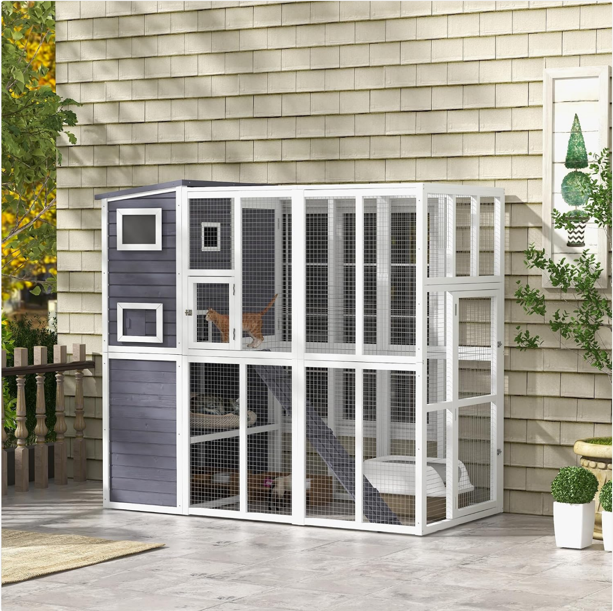
Image: The assembled PawHut Catio positioned on a paved patio, demonstrating typical outdoor placement.

Select a level, stable outdoor surface for placement. Ensure the area is clear of debris and provides adequate drainage. Positioning the catio in a shaded area can help keep your pets comfortable during warmer weather.