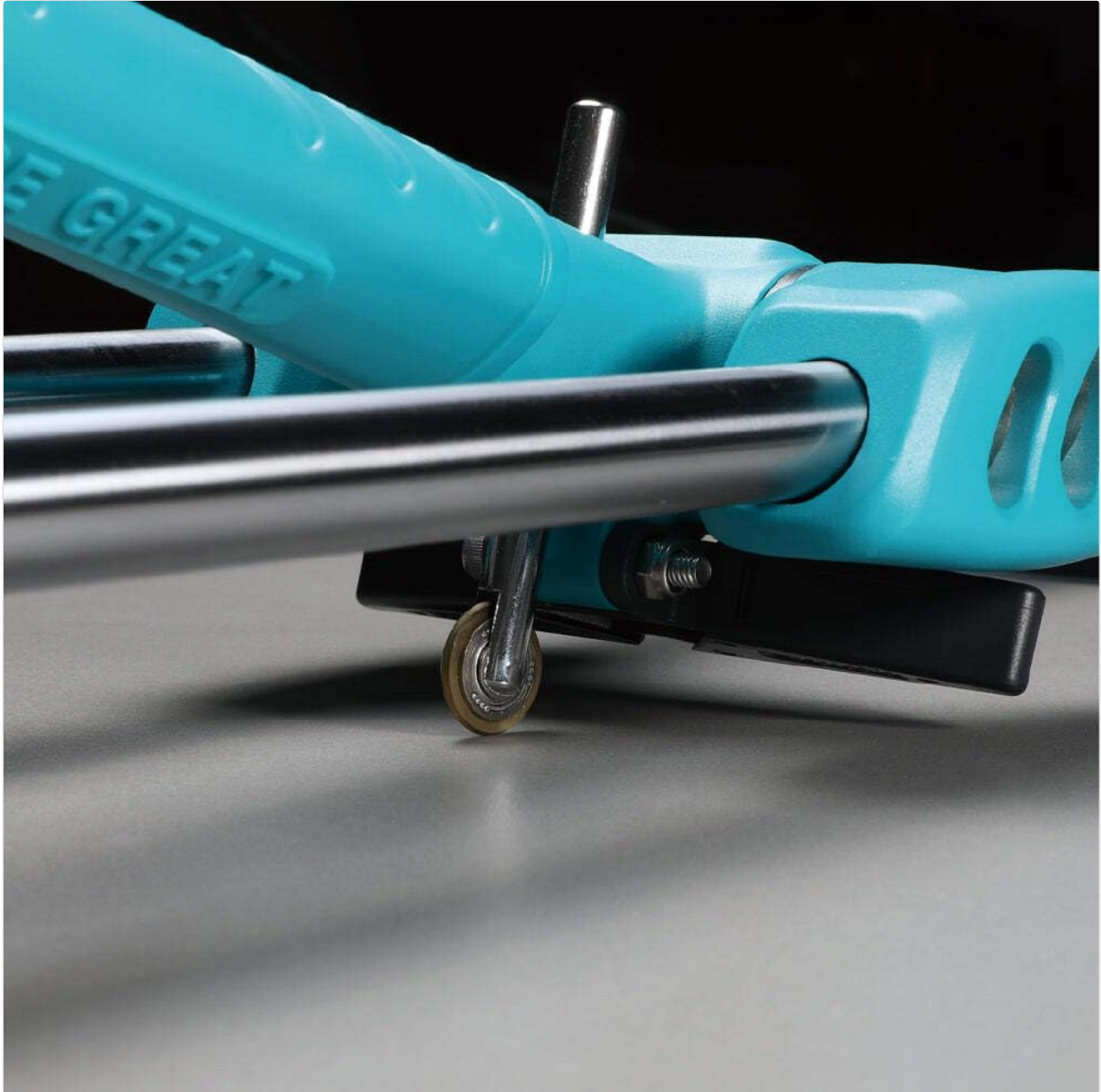
Figure 3: Detailed view of the carbide scoring wheel, which creates a precise score line on the tile surface. Ensure the wheel is clean and free of debris for optimal performance.

5. Inspect the cut: Carefully remove the cut tile pieces. Smooth any sharp edges with a rubbing stone if necessary.