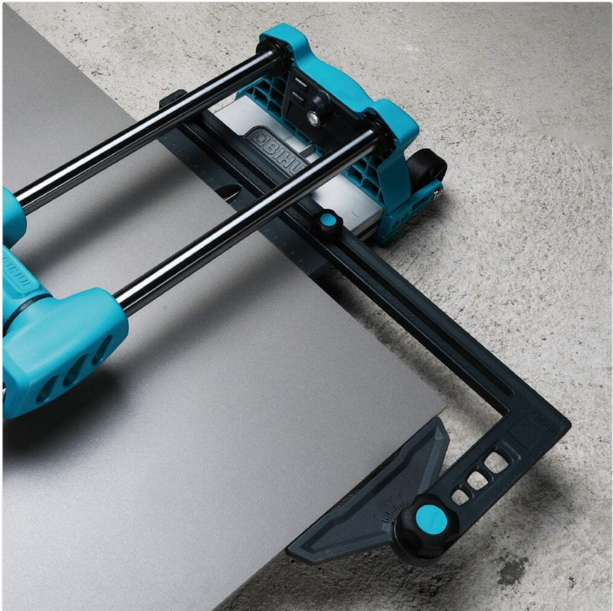
Figure 2: Close-up of the adjustable measuring guide and angle ruler, allowing for precise positioning of tiles for straight or diagonal cuts. Ensure the guide is tightened before scoring.