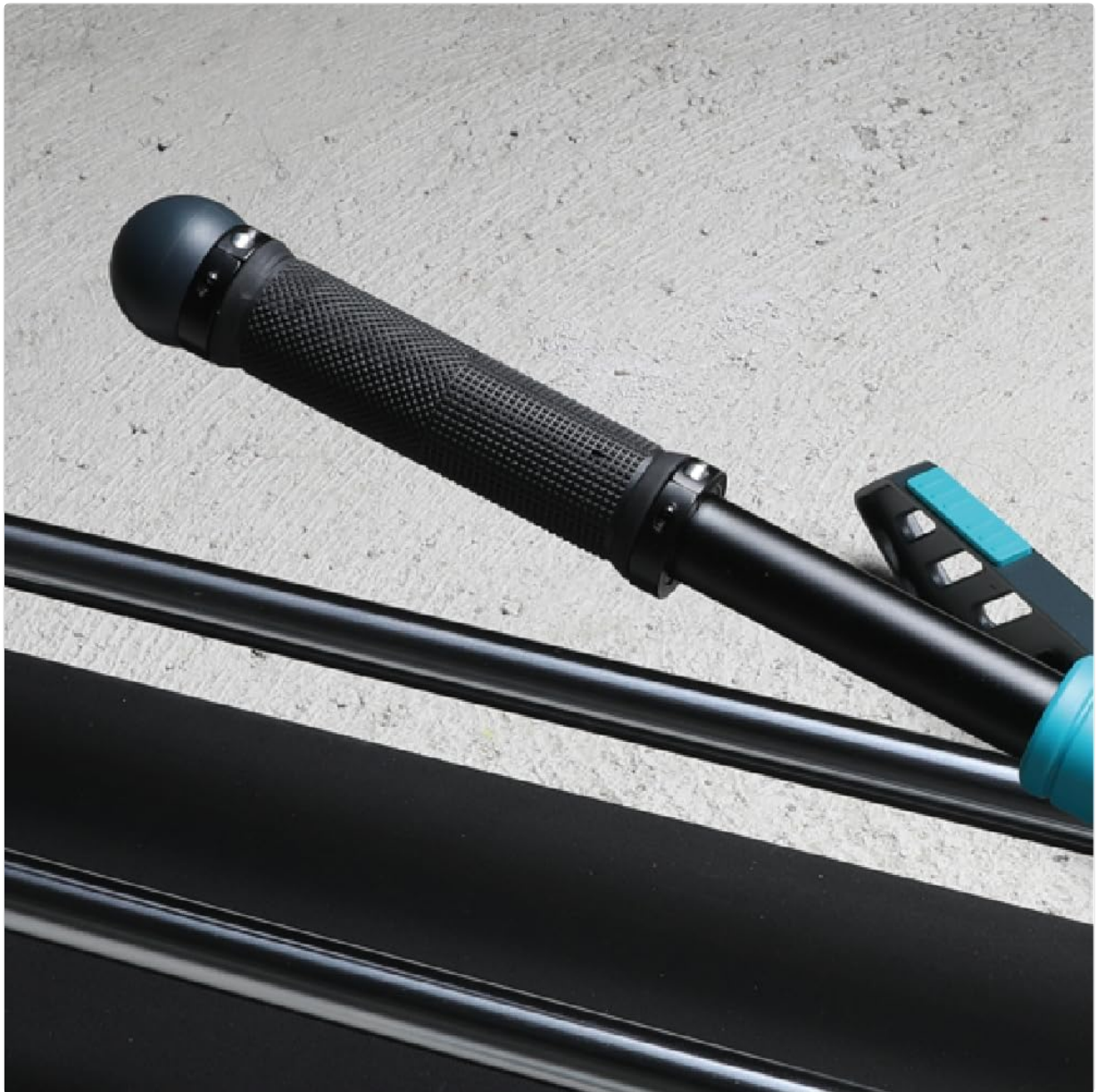
Figure 5: Close-up of the ergonomic handle grip, designed for comfortable and secure handling during the scoring and breaking process, reducing hand fatigue.