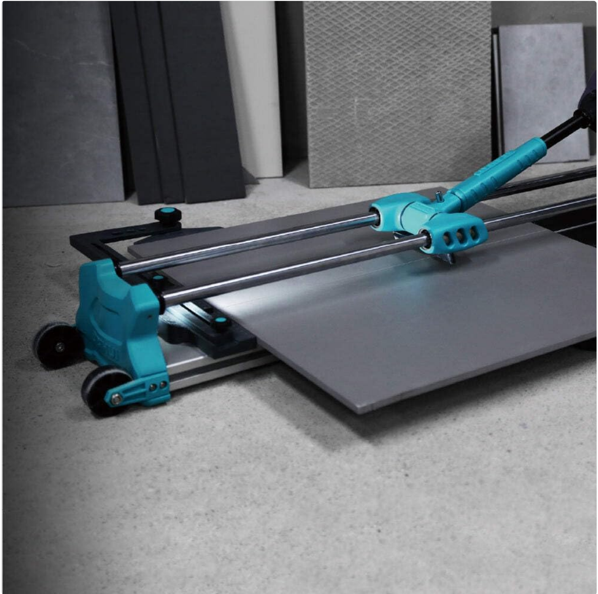
Figure 1: Overview of the BIHUI Manual Tile Cutter 800mm with a tile positioned for cutting. This image shows the main components including the base, guide rails, and scoring handle.