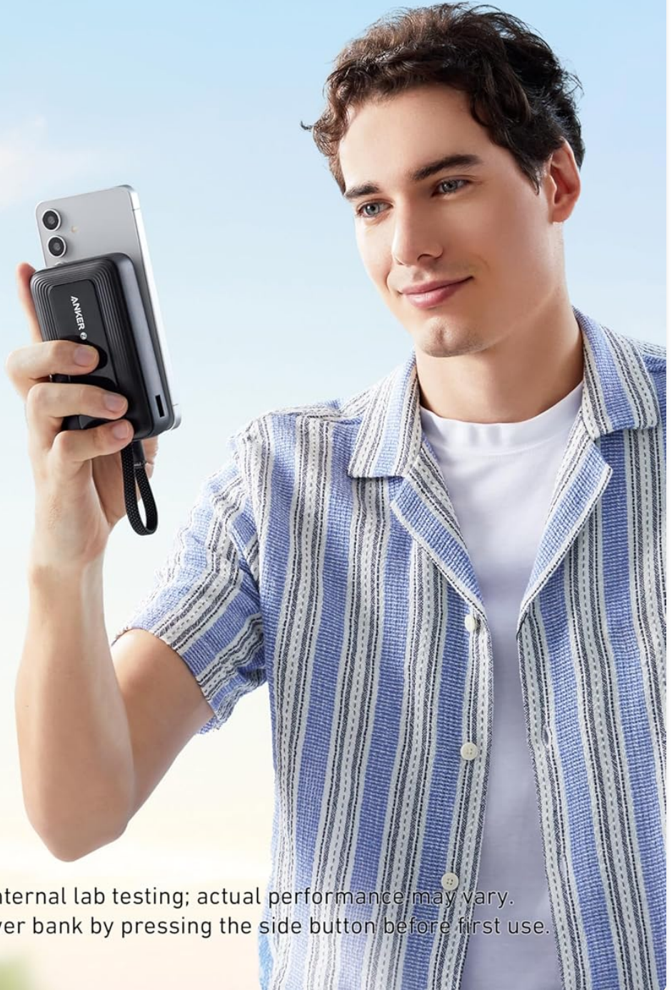
Image: A person holding the Anker Zolo Power Bank, with text indicating its 20,000mAh capacity can charge an iPhone 15 4.0 times, iPhone 15 Pro 4.0 times, and Samsung S24 3.79 times. It also notes the device is Flight Approved.