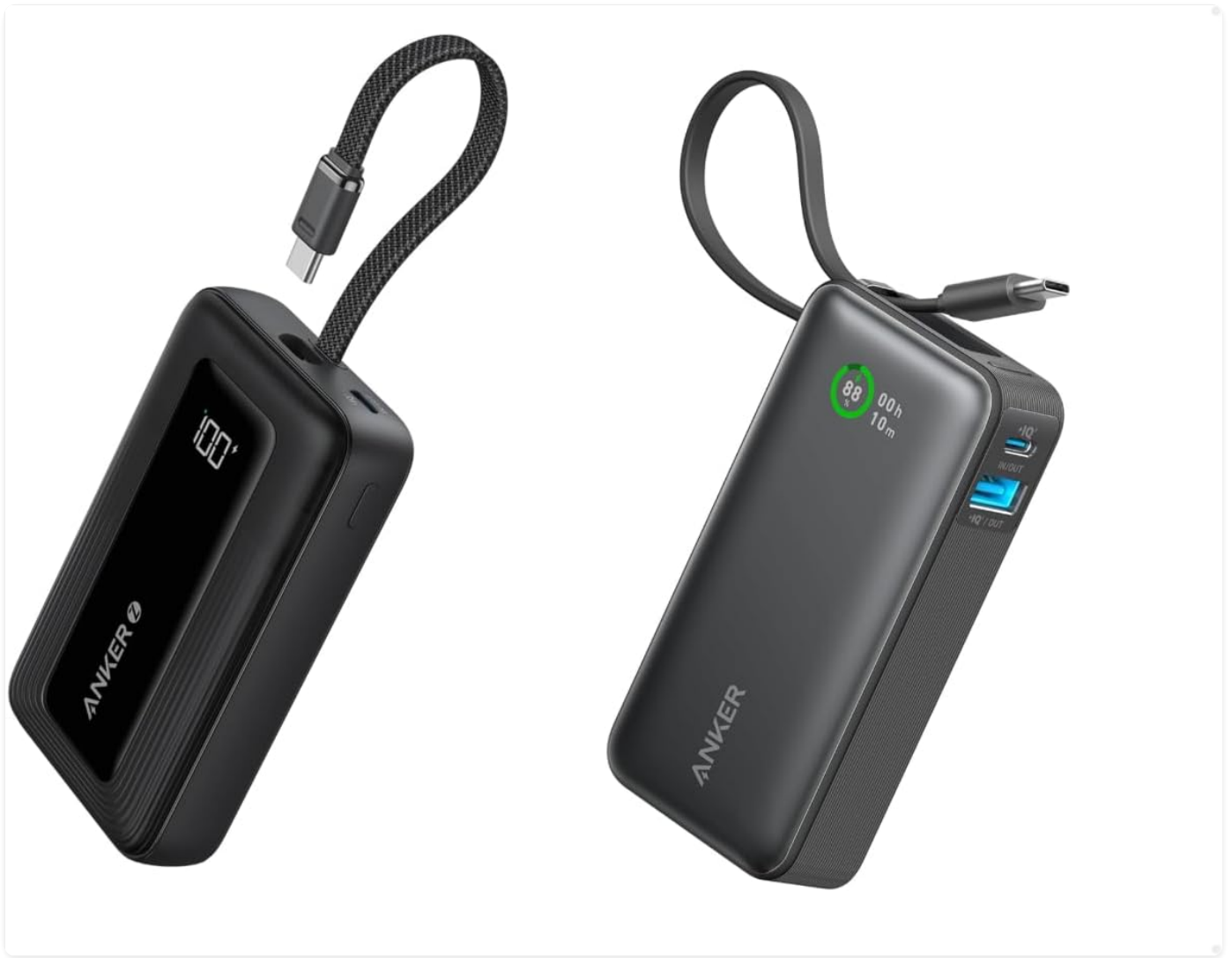
Image: Two Anker Zolo Power Banks, one black 20,000mAh model and one grey 10,000mAh model, showcasing their compact design and integrated USB-C cables. The black model shows a '100' display, while the grey model shows '88 00h 10m' on its display.