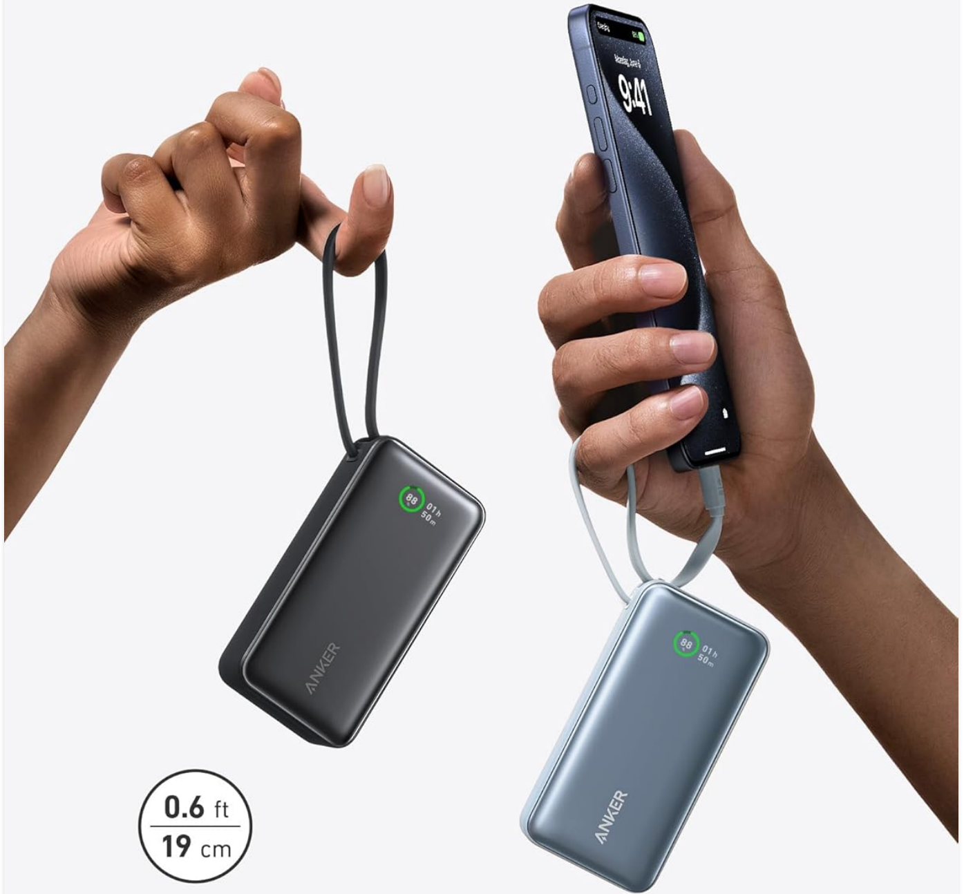
Image: Two hands holding different colored Anker Zolo Power Banks, illustrating the convenience of the built-in USB-C cable. The cable length is shown as 0.6 ft (19 cm).