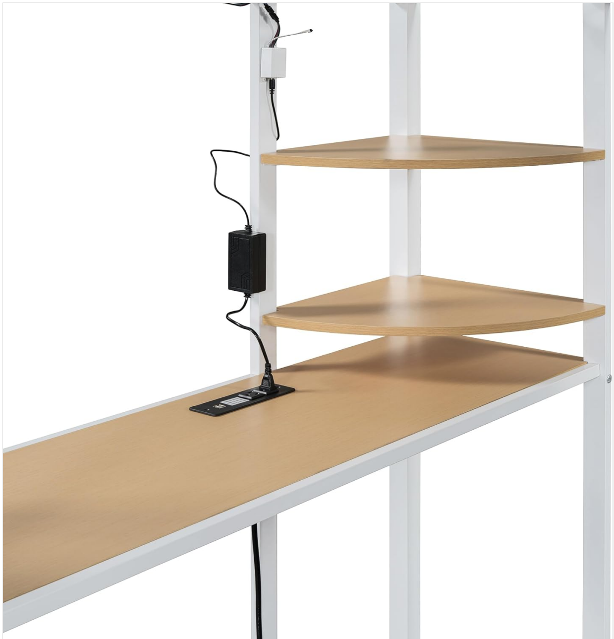
Image: Close-up view of the integrated desk area, showing the power outlet, LED light strip, and corner shelves.