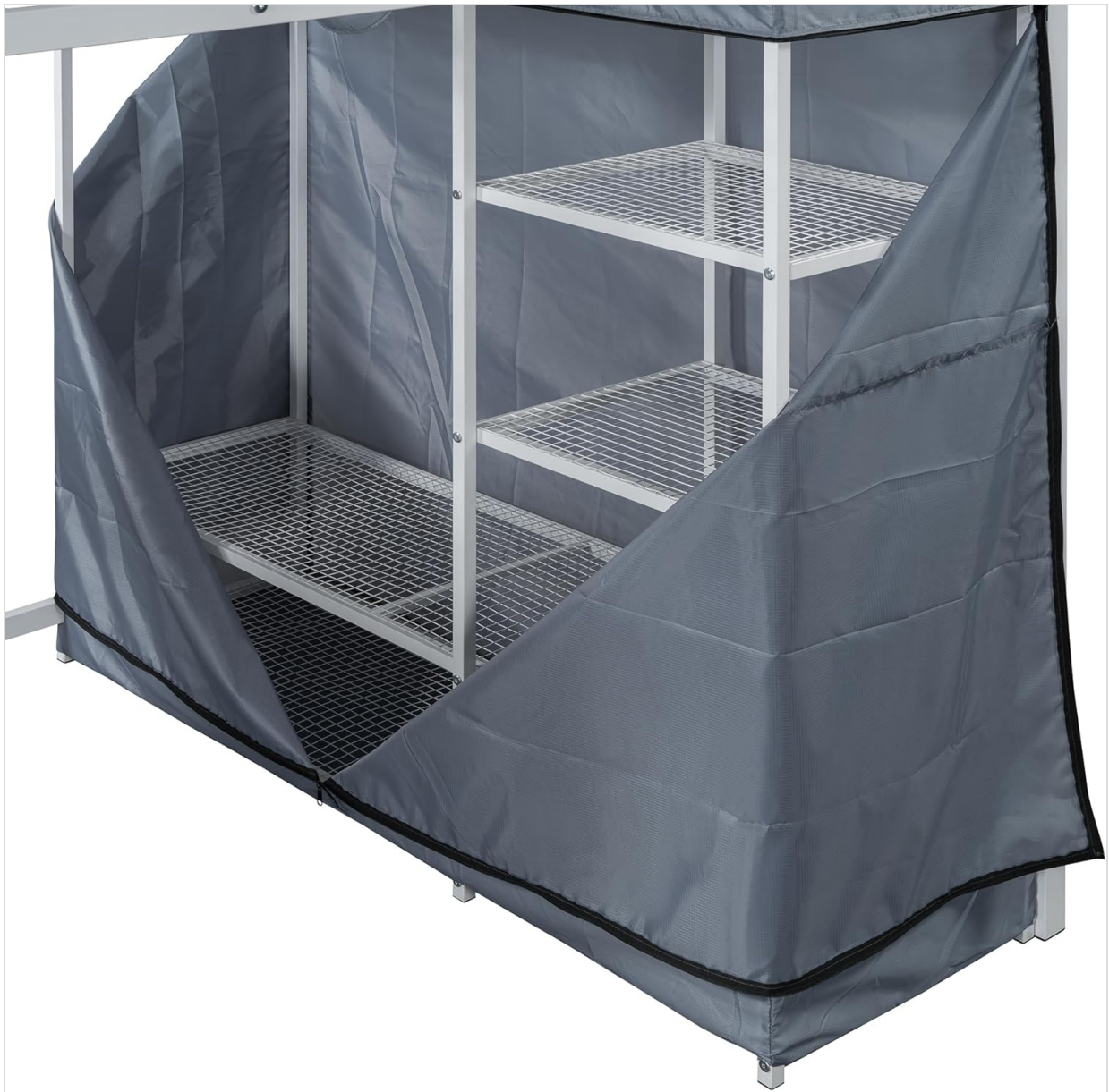
Image: Interior view of the fabric wardrobe, showing the hanging rod and multiple shelves for organized storage.