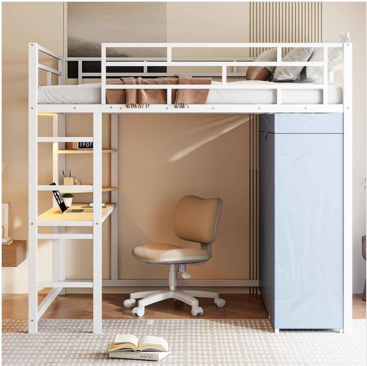
Image: Overall view of the Merax Full Size Metal Loft Bed, showcasing the elevated bed, integrated desk with shelves, and fabric wardrobe.