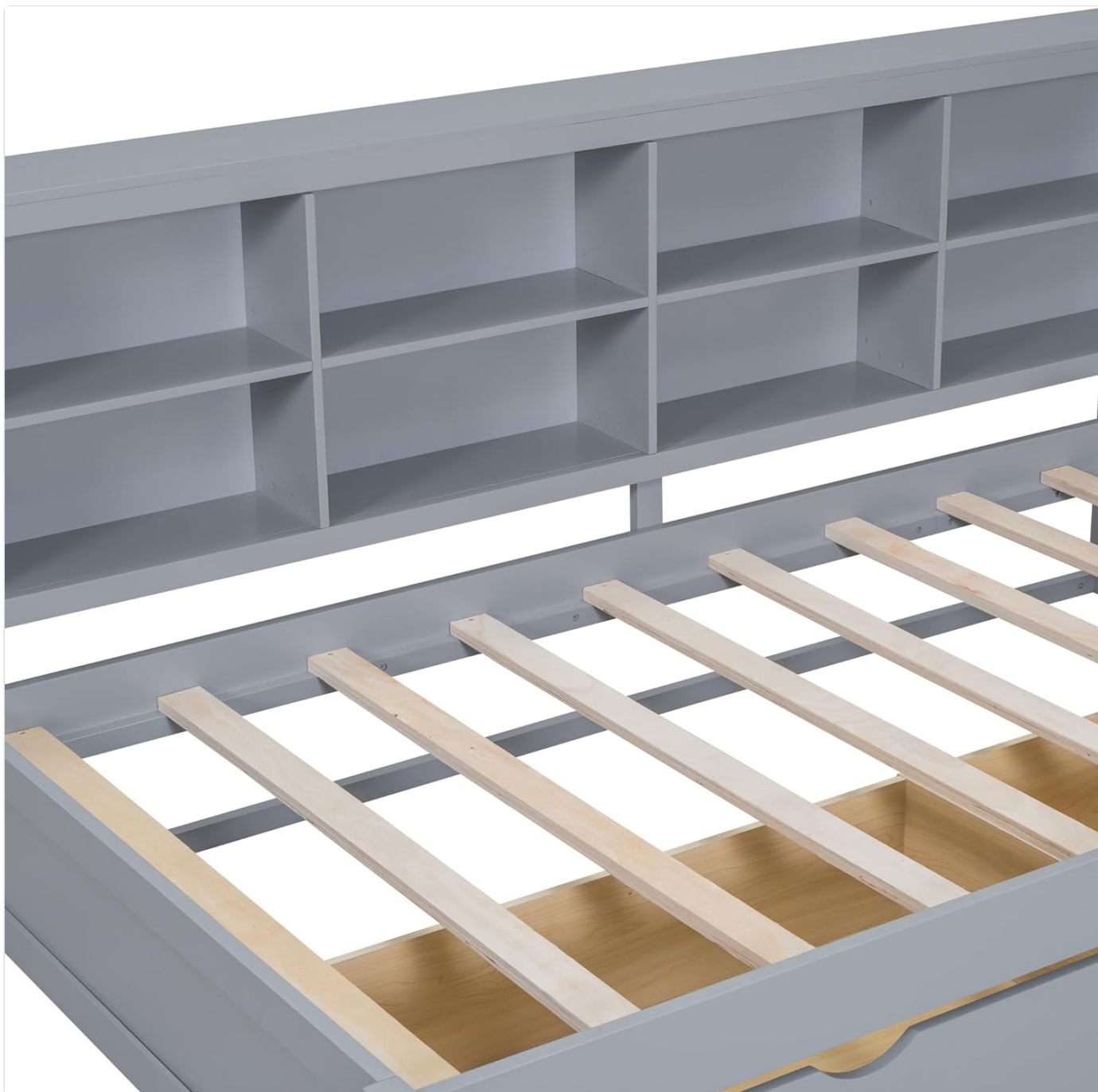
Image 4: Detailed view of the wooden slats that form the mattress support system, designed to eliminate the need for a box spring.