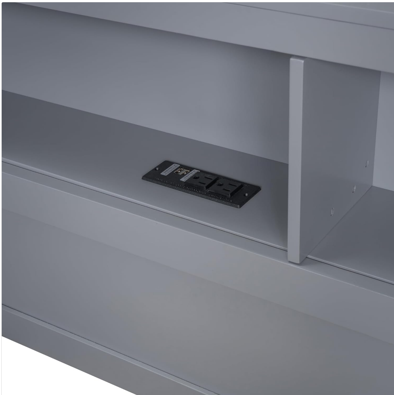
Image 5: A close-up of the USB charging station, showing two USB ports and two standard electrical outlets integrated into the shelf unit.