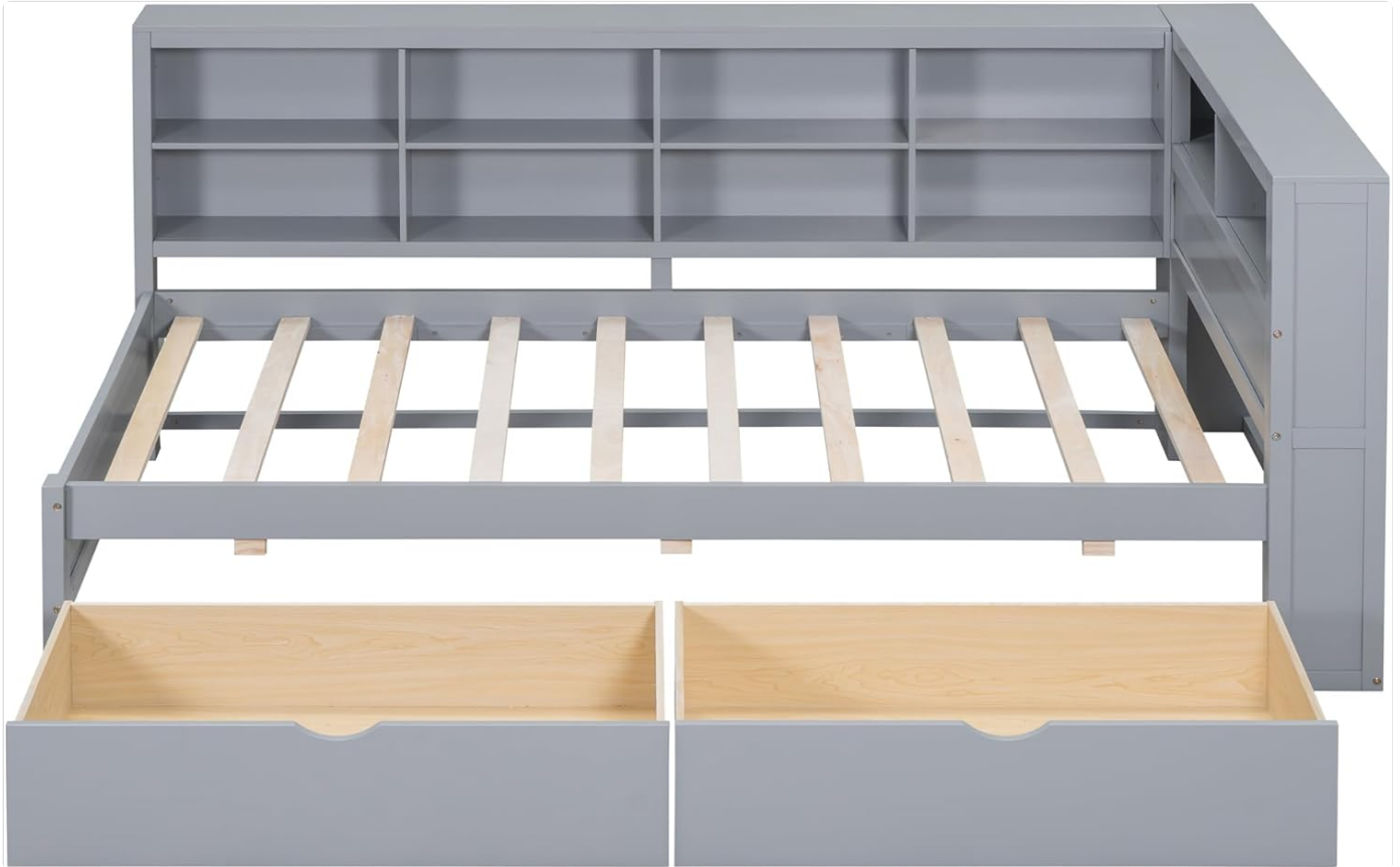
Image 3: The bed frame with its two pull-out drawers fully extended, revealing the interior storage space. The wooden mattress slats are also visible.