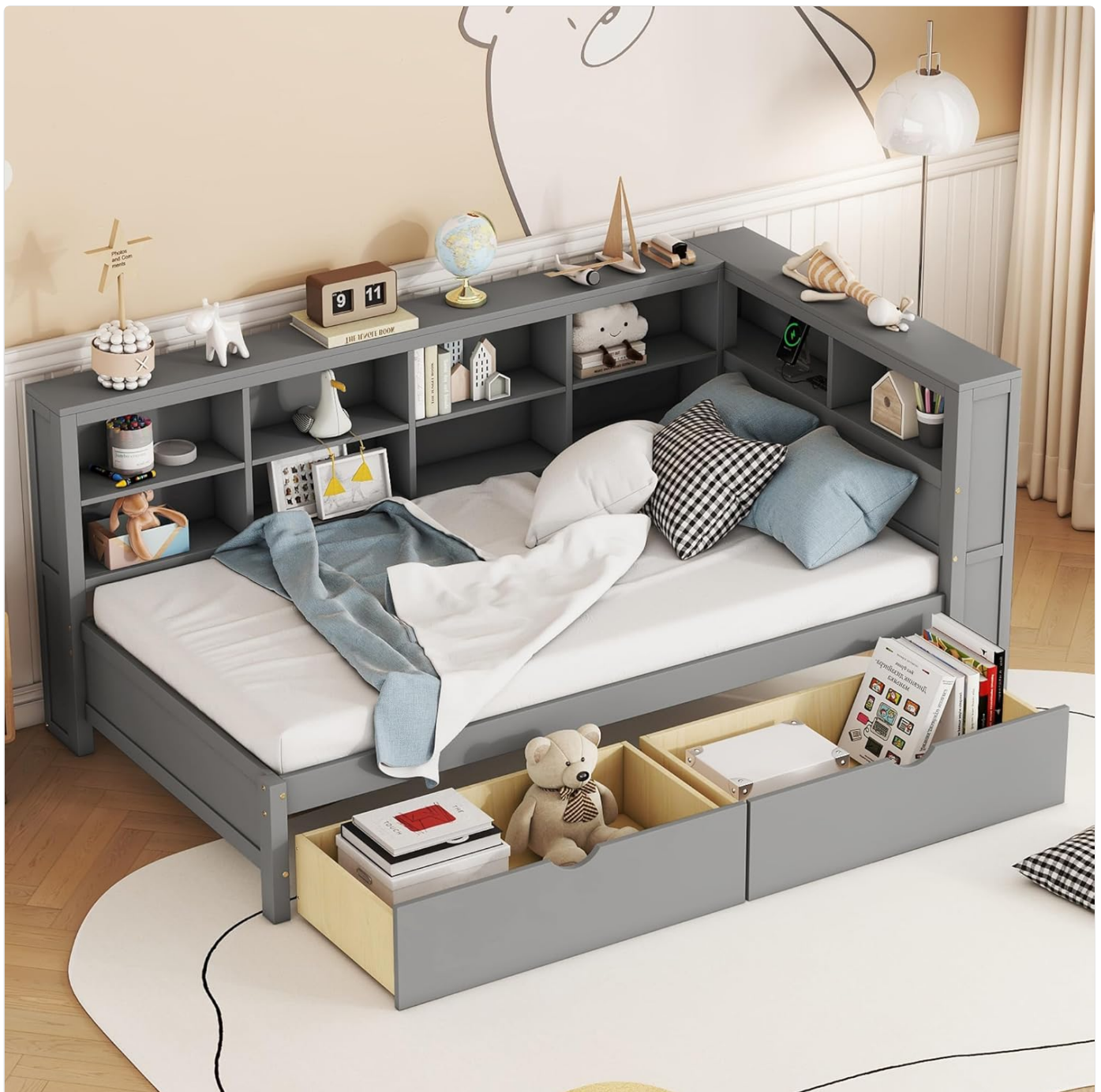
Image 1: Fully assembled Ball & Cast Twin Size Wooden Storage DayBed in grey, showcasing the L-shaped design with integrated shelves and pull-out storage drawers. A mattress is in place, adorned with pillows and a blanket.