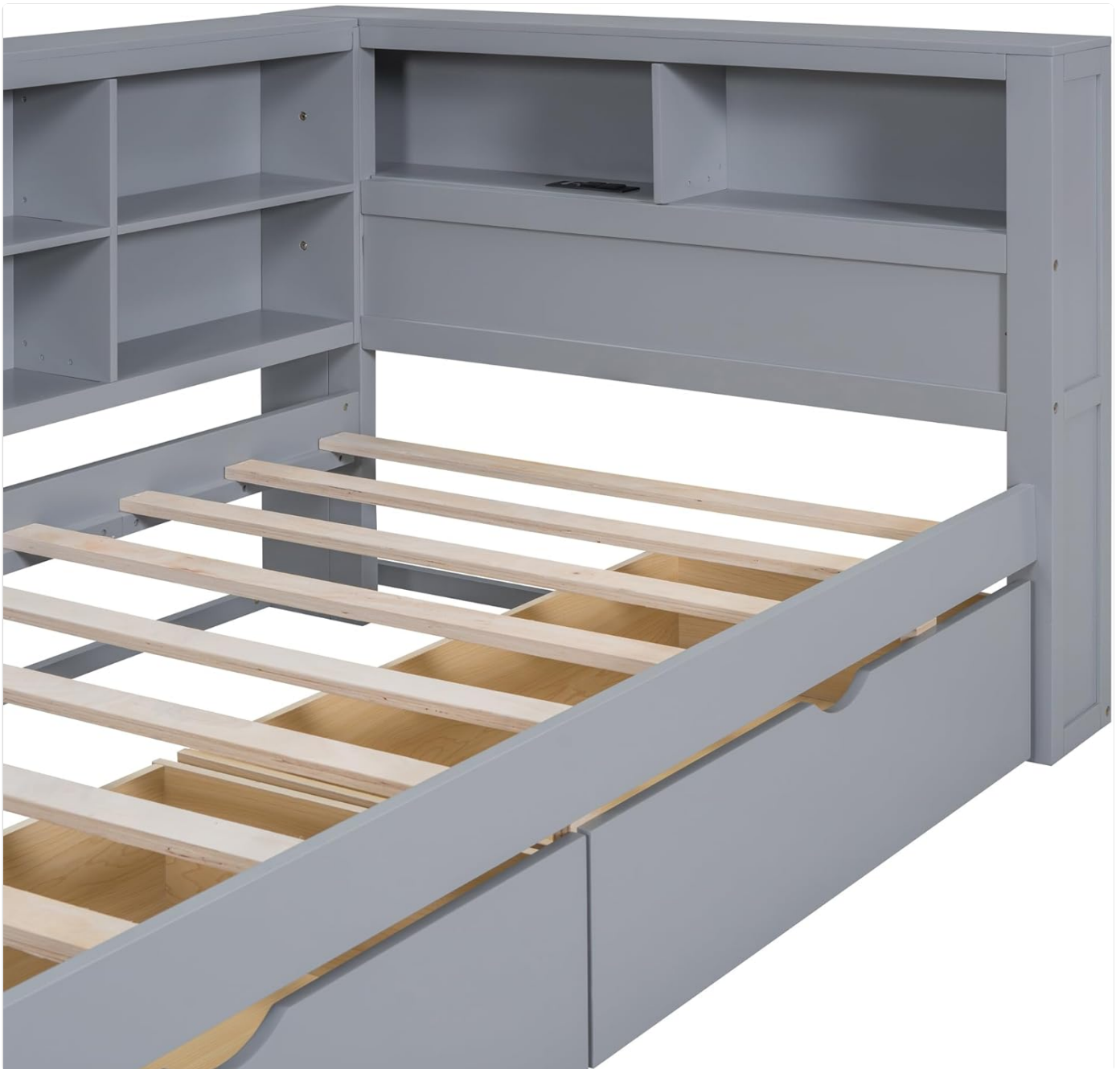
Image 2: Close-up view of the L-shaped headboard and integrated shelving units, highlighting the various compartments for storage and display.