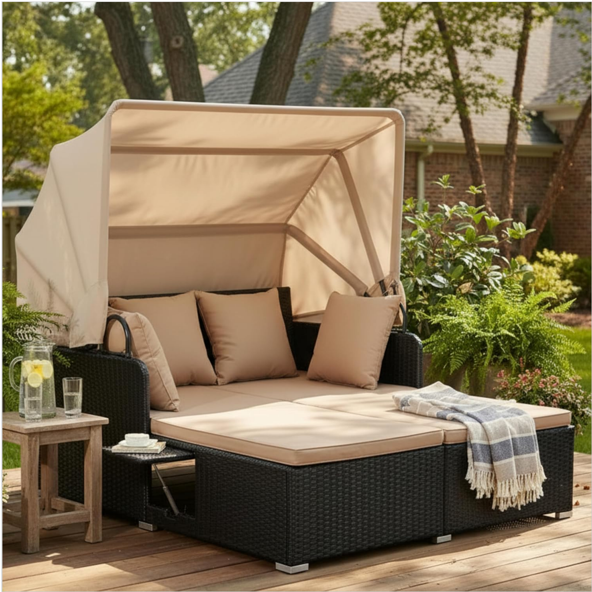
Image: The Tangkula Patio Rattan Daybed with its retractable canopy extended, situated on a wooden deck in a garden. The daybed features black rattan weaving and beige cushions.