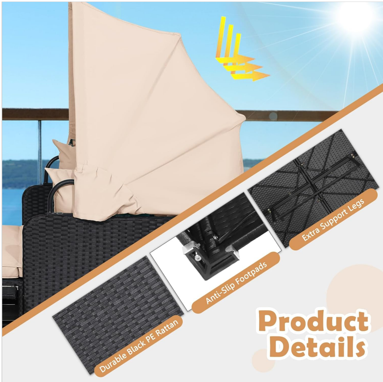
Image: Detailed view of the daybed's construction, showcasing the durable black PE Rattan, aluminum feet for stability, and additional support legs for enhanced strength.