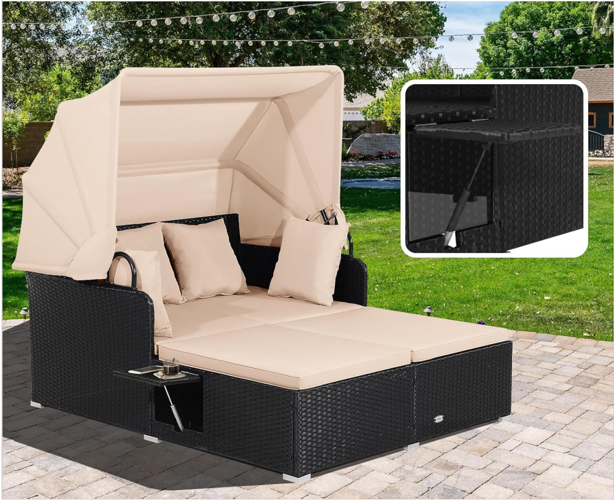
Image: The daybed with one of its retractable side tables extended, providing a surface for drinks or small items.

Provide additional space for you to store drinks or snacks