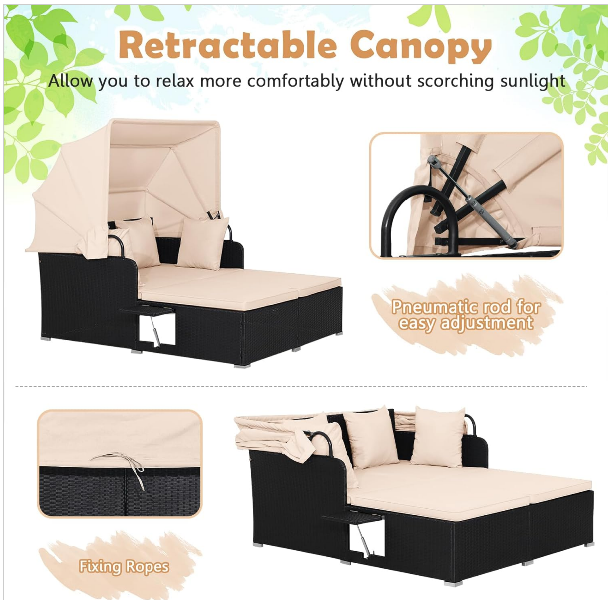
Image: Details of the retractable canopy, highlighting the pneumatic rod for easy adjustment and the fixing ropes to secure the canopy when not in use.