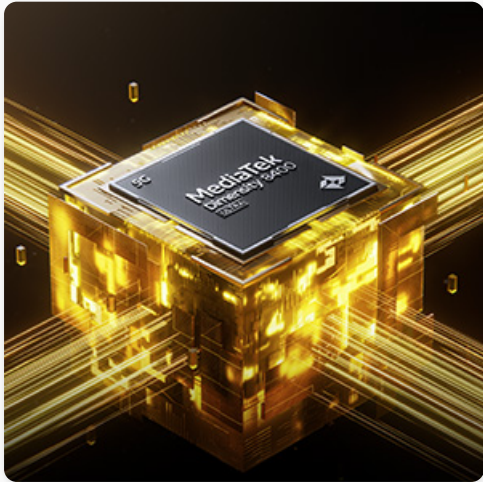
Image 8.1: The MediaTek Dimensity 8400-Ultra processor.