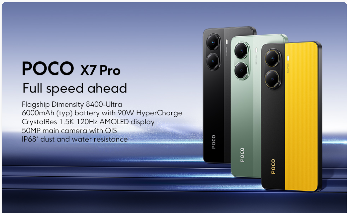
Image 1.1: The POCO X7 Pro smartphone, showcasing its design and available colors.

This manual provides essential information for the safe and efficient use of your XIAOMI POCO X7 Pro smartphone. Please read this guide thoroughly before operating your device to ensure proper functionality and to prevent damage. Keep this manual for future reference.