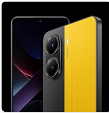
Image 6.1: The POCO X7 Pro's IP68 dust and water resistance feature.