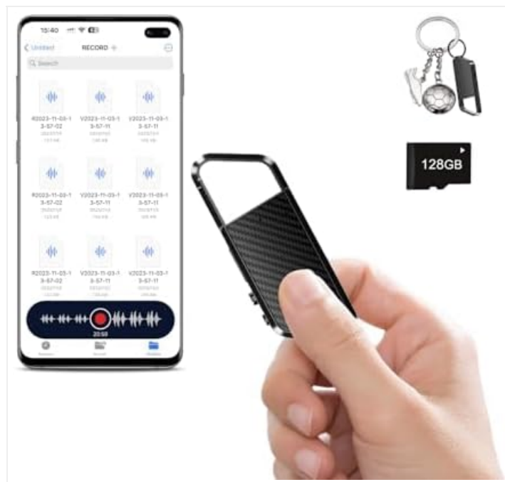
Image 1.1: The NekSide LP037 Voice Activated Recorder shown with a smartphone displaying recorded files, a keychain, and a 128GB memory card. This illustrates the compact size and included accessories.

Thank you for choosing the NekSide LP037 128GB Voice Activated Recorder. This device is designed for high-quality audio recording with features such as voice activation, noise reduction, and extensive storage capacity. This manual provides detailed instructions to help you operate and maintain your recorder effectively.