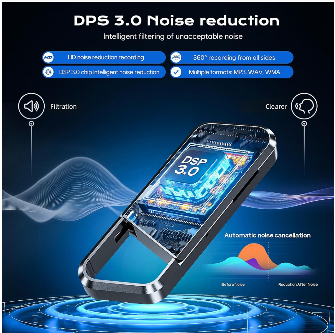
Image 5.1: A diagram illustrating the DPS 3.0 noise reduction technology within the NekSide LP037, showing how it intelligently filters noise for clearer audio, supporting HD noise reduction and 360-degree recording.

The NekSide LP037 incorporates DPS 3.0 intelligent noise reduction technology. This feature actively filters out unacceptable background noise, ensuring clearer and more intelligible recordings, especially in challenging acoustic environments.