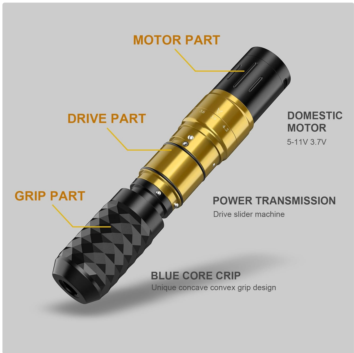
Figure 2: Exploded view illustrating the main components of the Solong Tattoo Gun: Motor Part, Drive Part, and Grip Part. The machine utilizes a domestic 5-11V 3.7V motor and a drive slider mechanism for power transmission, with a unique concave-convex grip design.