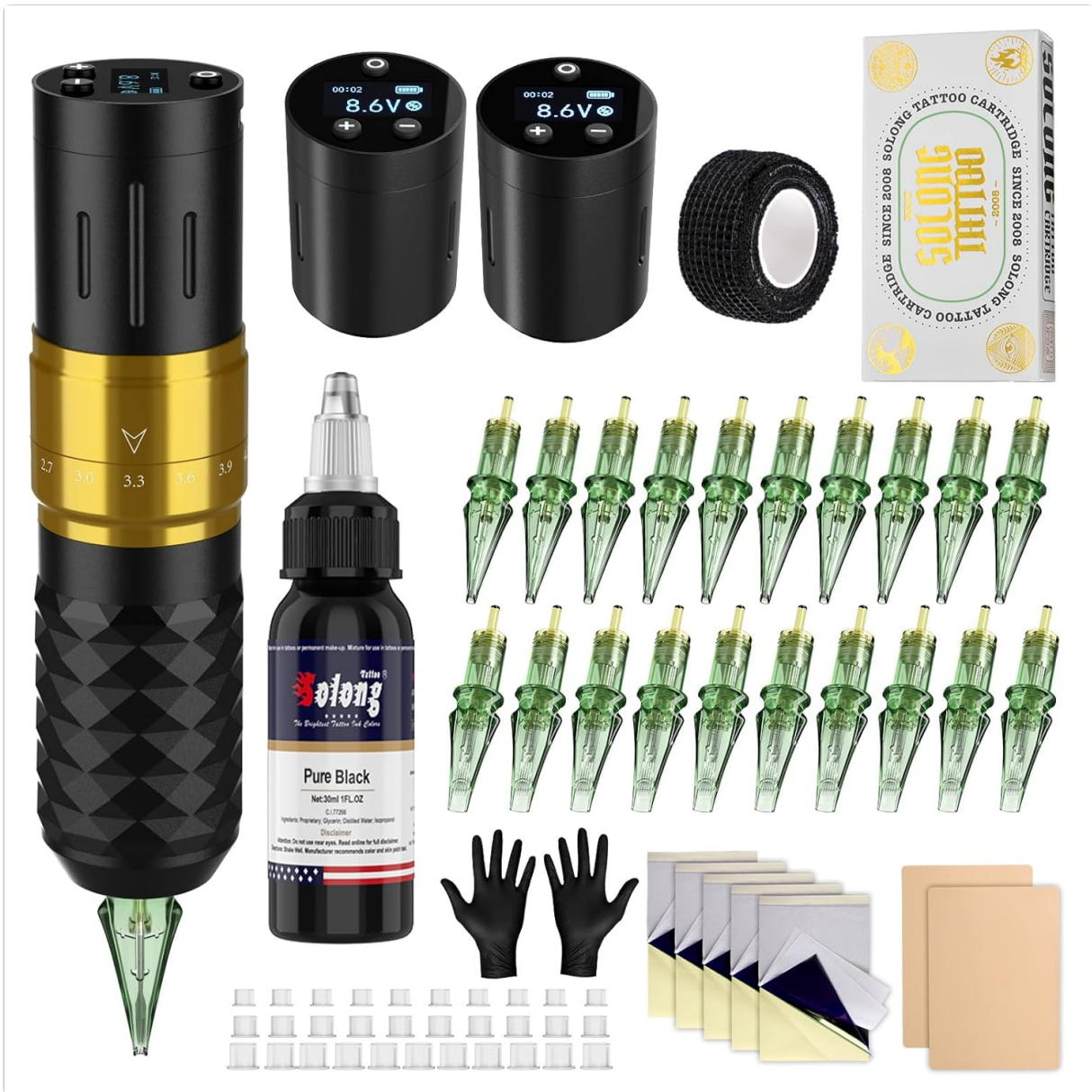
Figure 1: Complete Solong Tattoo Gun Kit SL-TK0002-9 contents, including the wireless machine, two batteries, various needle cartridges, tattoo ink, practice skin, and accessories.