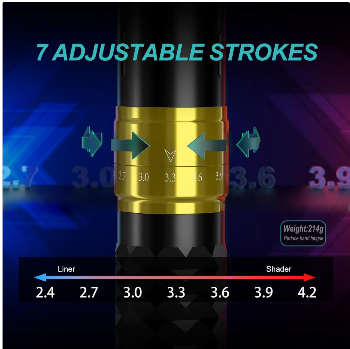
Figure 4: Detailed view of the machine's adjustable stroke mechanism, indicating settings from 2.4mm to 4.2mm, suitable for both lining and shading.