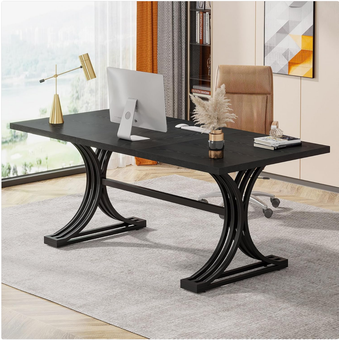
Figure 2: Desk in Use. This image shows the Tribesigns 63" Large Home Office Desk set up in a modern office environment, demonstrating its ample workspace for a computer and other office essentials.