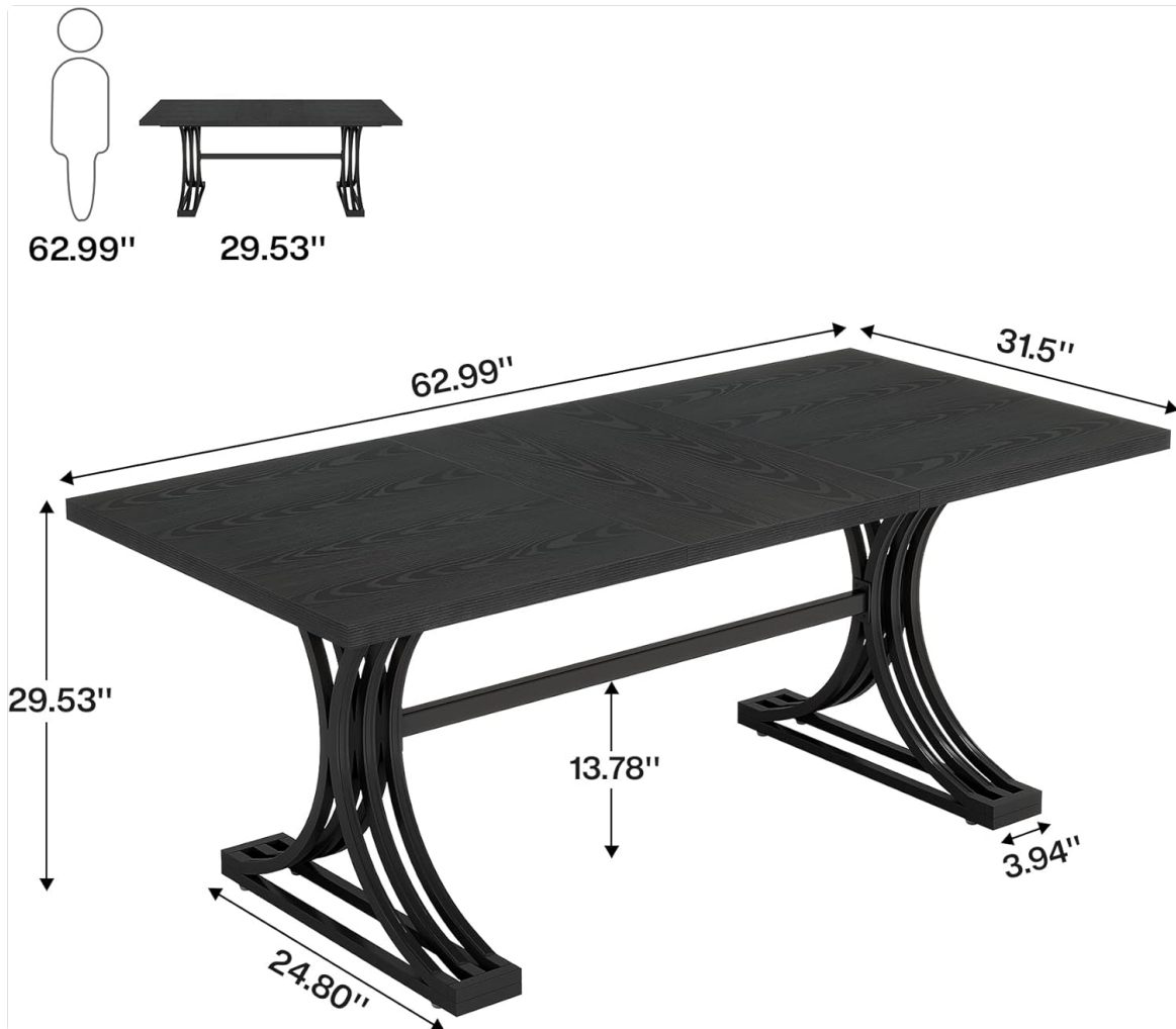
Figure 1: Desk Dimensions. This diagram illustrates the overall dimensions of the Tribesigns 63" Large Home Office Desk, including its length, width, and height, along with the spacing of the legs.