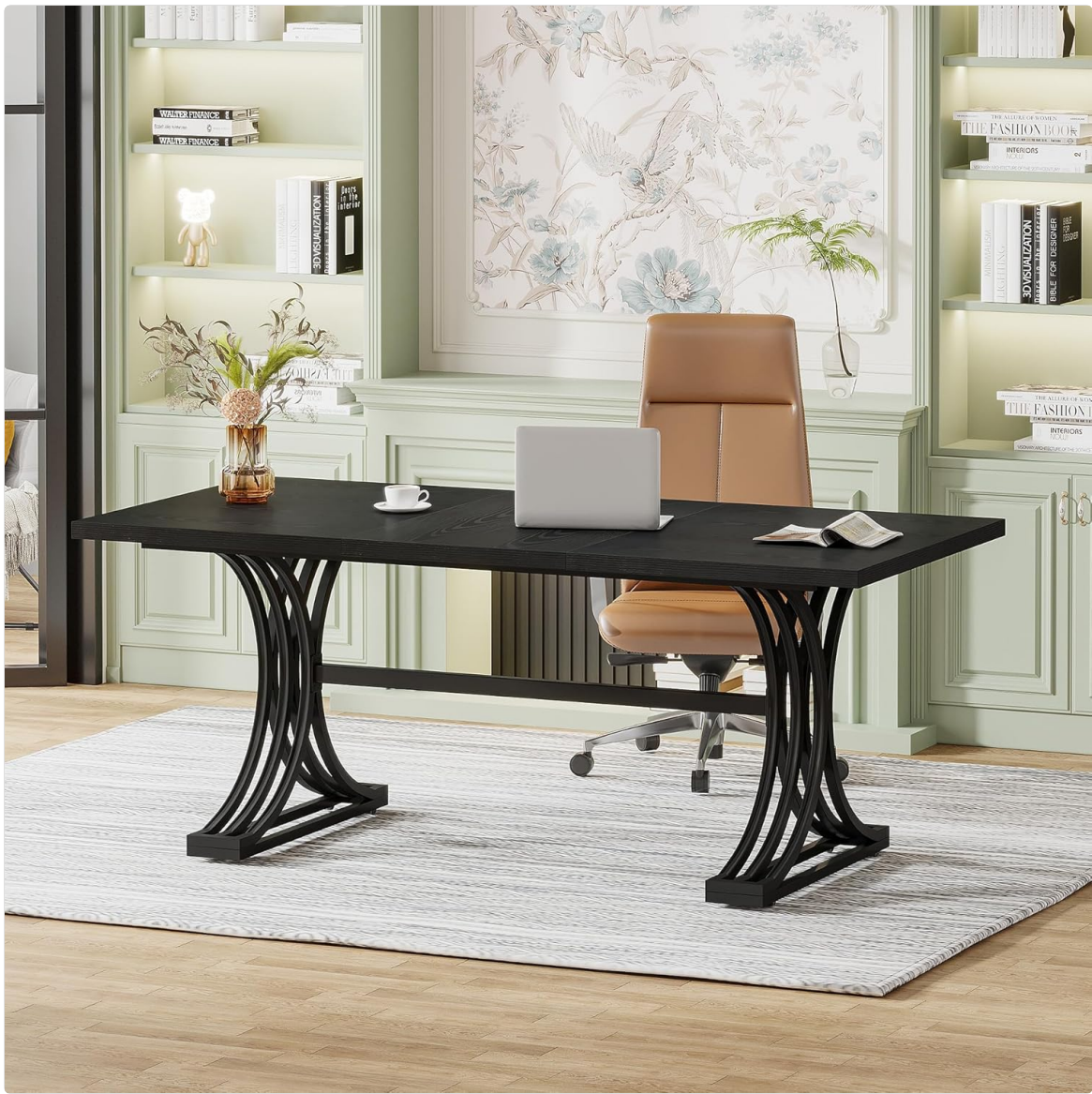
Figure 3: Collaborative Workspace. This image highlights the spacious design of the desk, allowing two individuals to comfortably work side-by-side, making it suitable for collaborative tasks or shared office spaces.