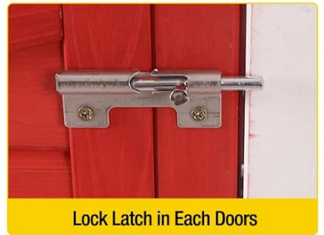
Lock Latch in Each Doors