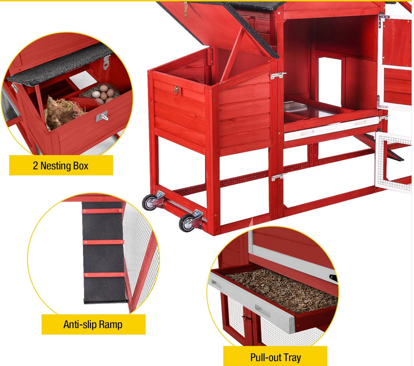
Image: Detailed view of the chicken coop's humanized design features, including the two nesting boxes, anti-slip ramp, and convenient pull-out tray for cleaning.