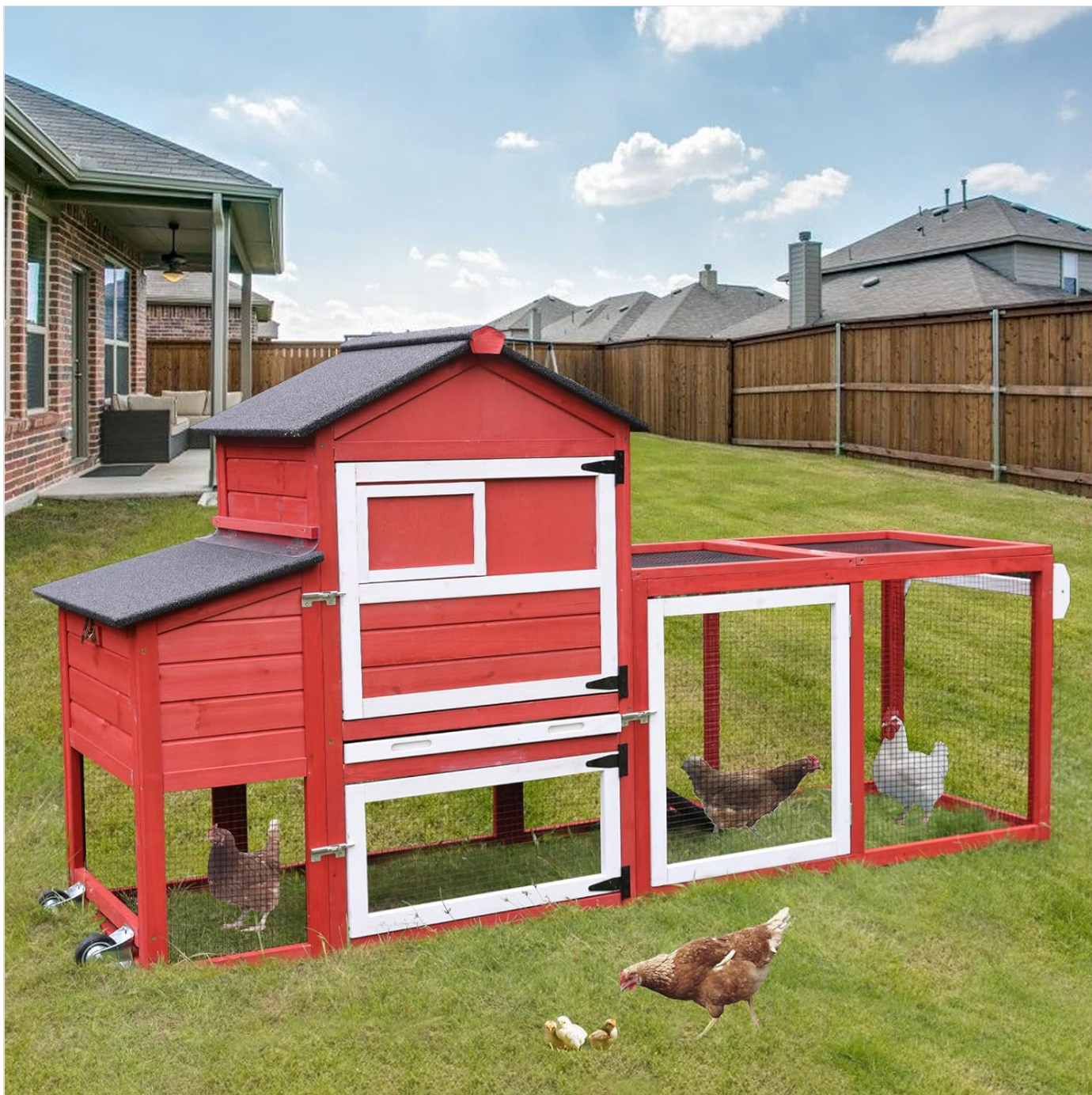
Image: The Aivituvn chicken coop situated in a grassy backyard, demonstrating its use with chickens freely moving within the enclosed run.