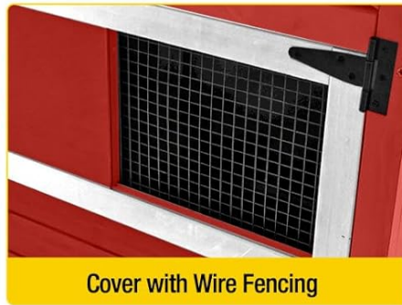
Cover with Wire Fencing