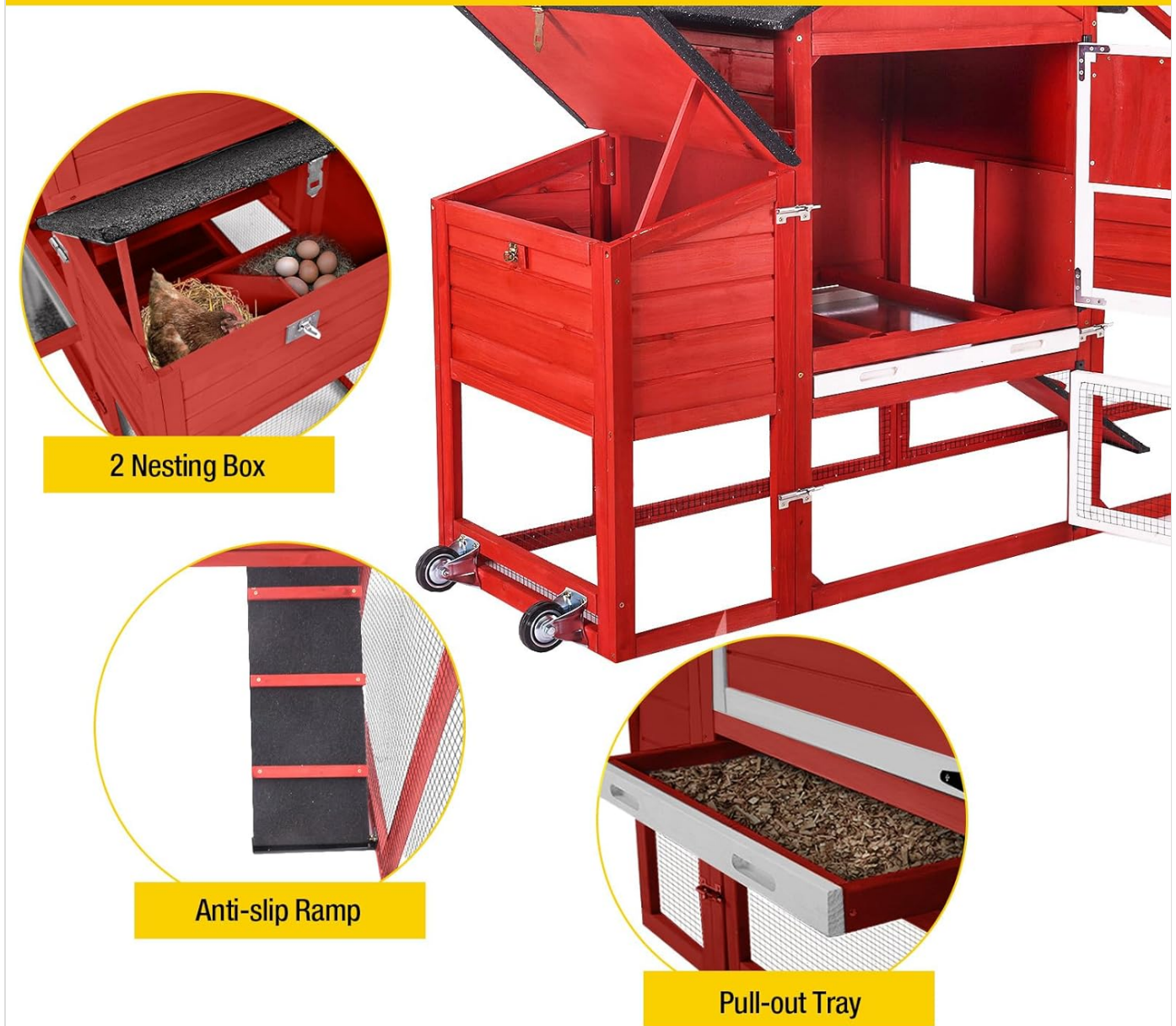
Image: Detailed view of the chicken coop's humanized design features, including the two nesting boxes, anti-slip ramp, and convenient pull-out tray for cleaning.