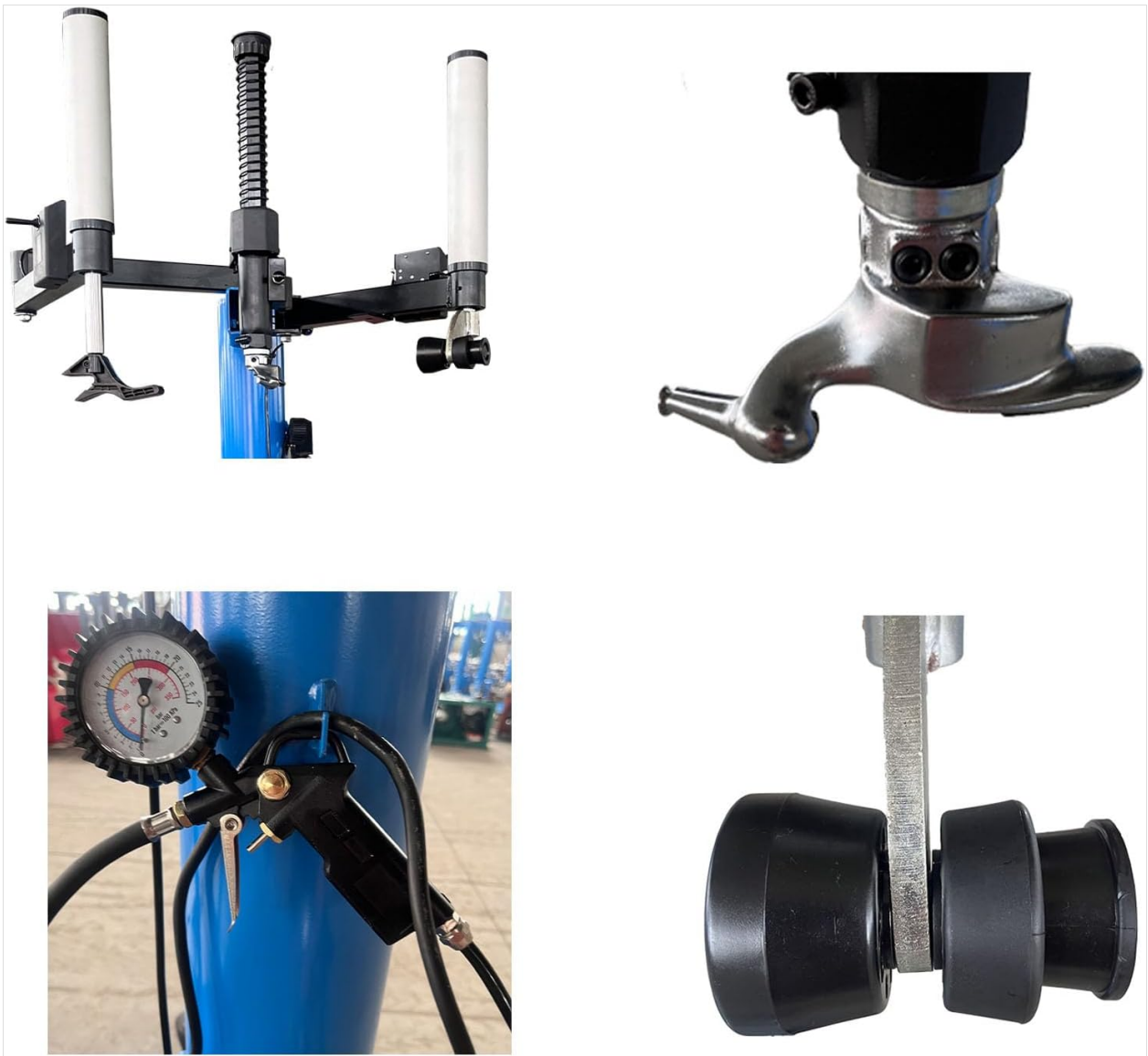
Figure 3.3: Close-up view of the ME-T530Z tire changer's double assist arms, inflation gauge with pedal control, and other operational components.