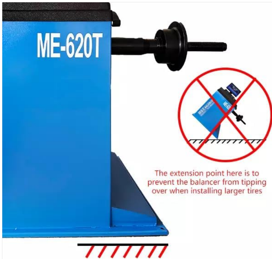
Figure 3.6: The extension point at the base of the ME-B620 Wheel Balancer, designed to prevent tipping when installing larger tires.