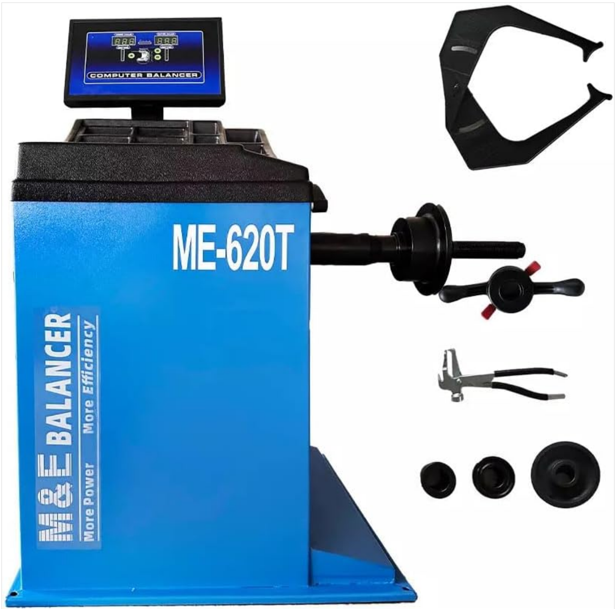
Figure 3.4: The KATOOL ME-B620 Wheel Balancer shown with various accessories for wheel balancing.