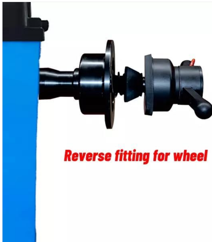
Figure 3.8: Illustration of the reverse fitting method for mounting wheels on the ME-B620 Wheel Balancer.