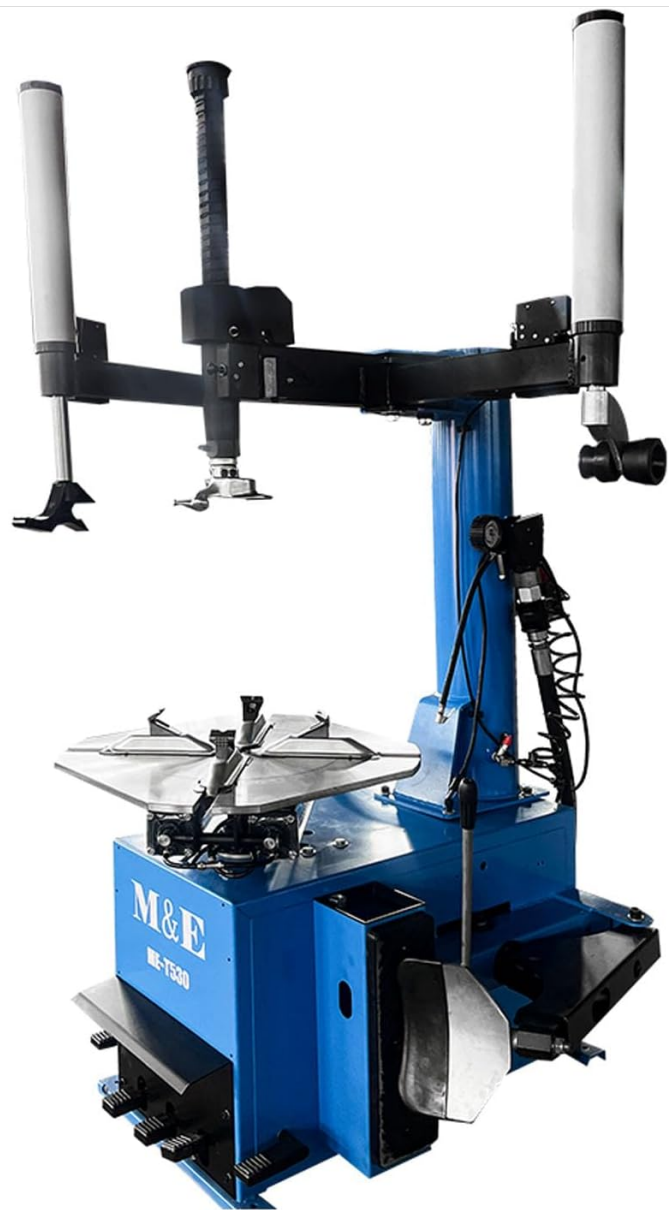
Figure 3.1: General view of the KATOOL ME-T530Z Double Assist Arm Tire Changer.