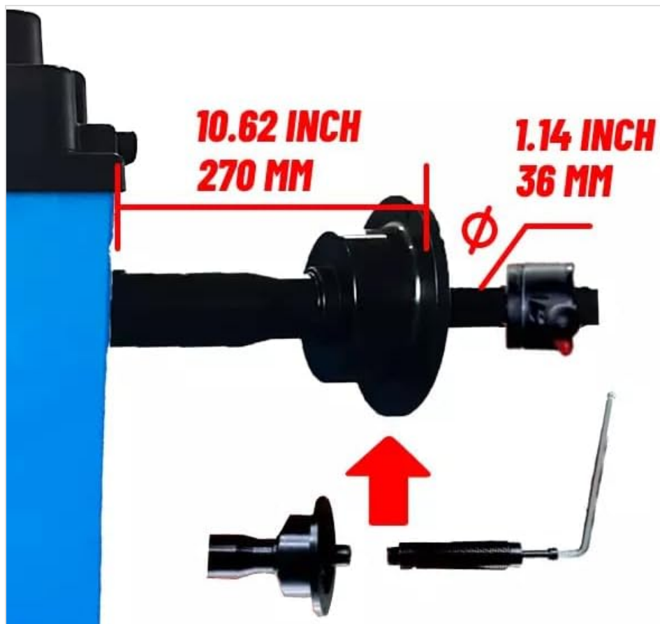
Figure 3.7: Diagram illustrating the dimensions of the ME-B620 Wheel Balancer's shaft, including diameter and length.