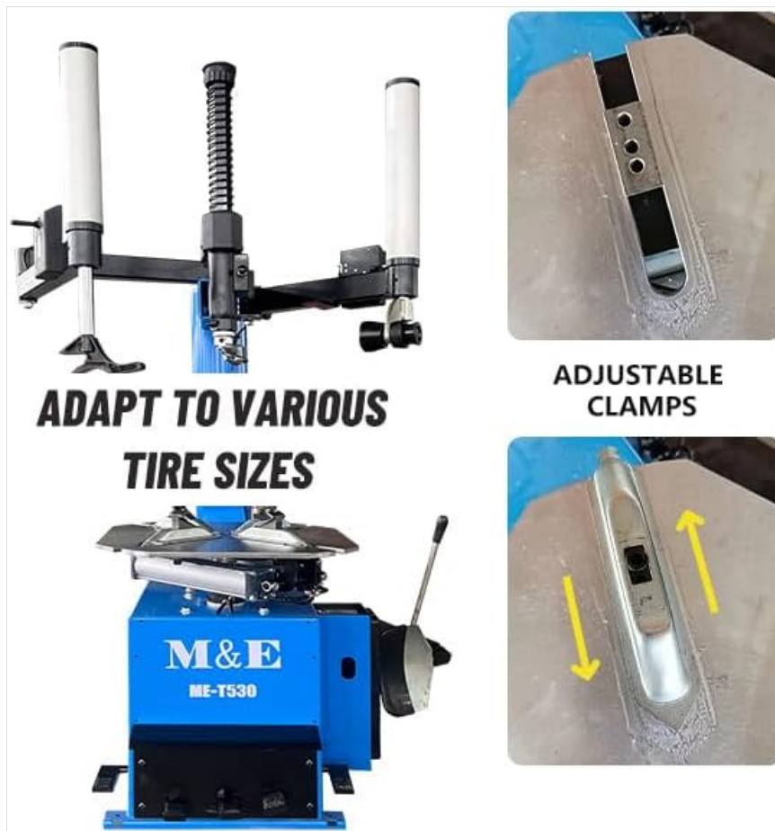
Figure 3.2: Detail of the adjustable clamps on the ME-T530Z tire changer, designed to adapt to various tire sizes.