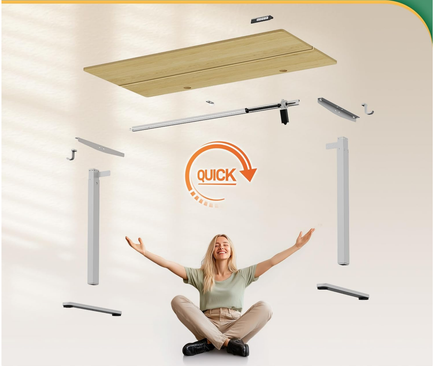
Image: Visual guide illustrating the streamlined assembly process with pre-labeled parts.

All Holes Are Pre-Drilled And All Accessories Are Pre-Labeled Clearly