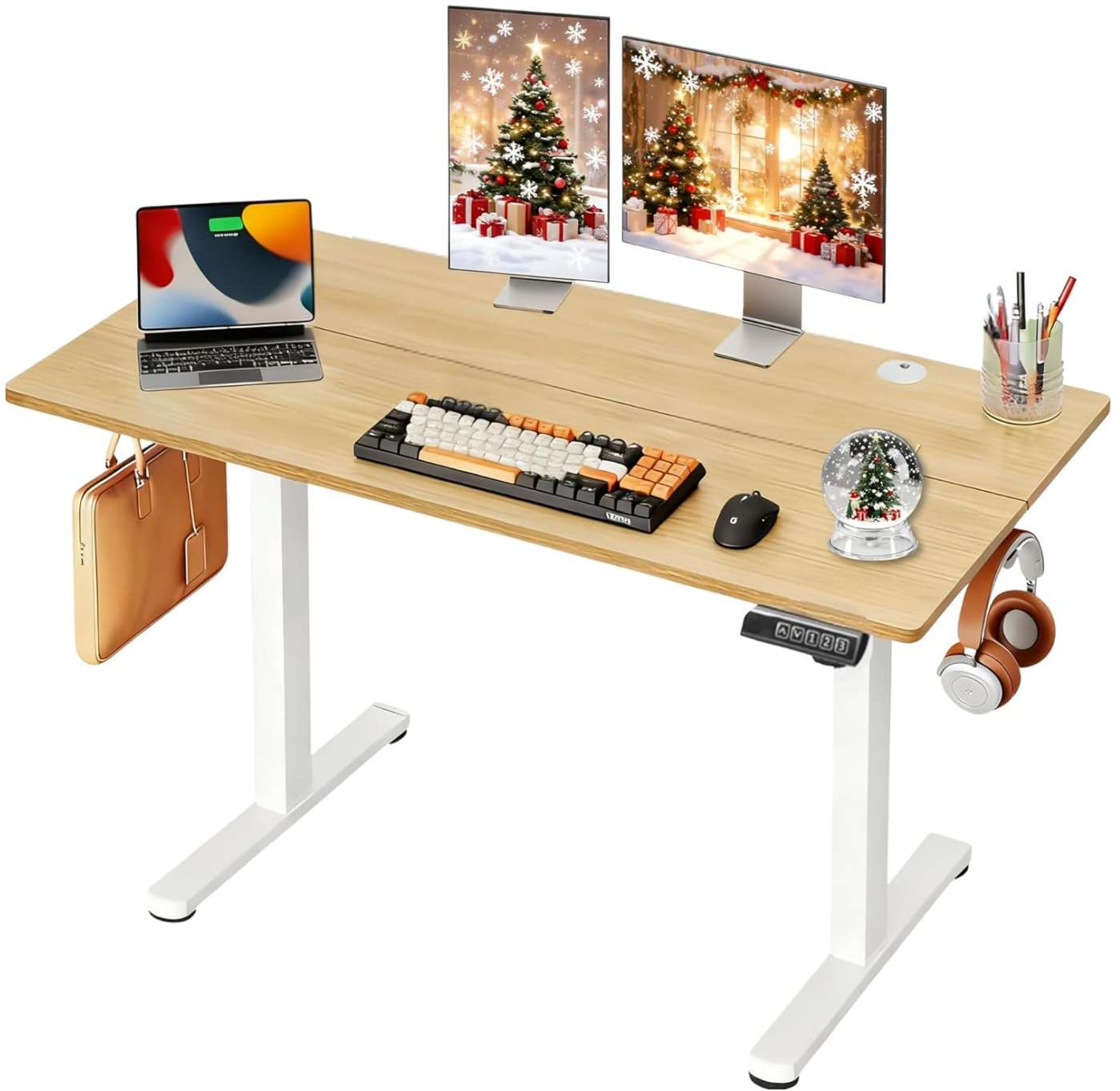
Image: The DEVAISE 48 Inch Electric Standing Desk, showcasing its spacious maple desktop and white frame, equipped for a modern workspace.