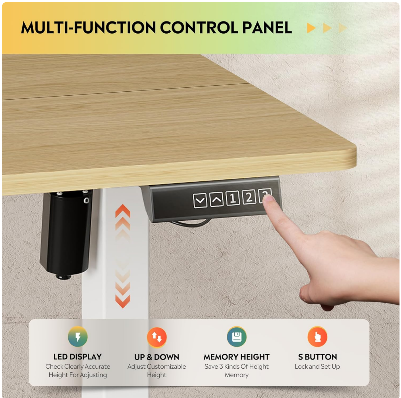
Image: The multi-function control panel with LED display, up/down arrows, and memory preset buttons.