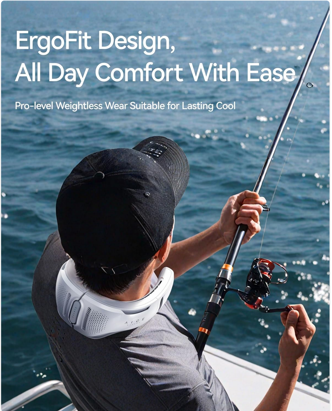
Figure 5: The device worn comfortably during outdoor activity.

Pro-level Weightless Wear Suitable for Lasting Cool