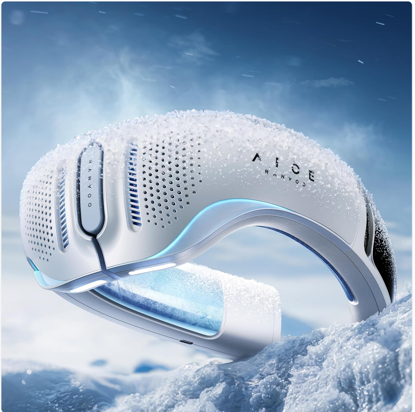
Figure 1: The RANVOO AICE LITE Plus 2025 Neck Air Conditioner, highlighting its cooling capabilities.