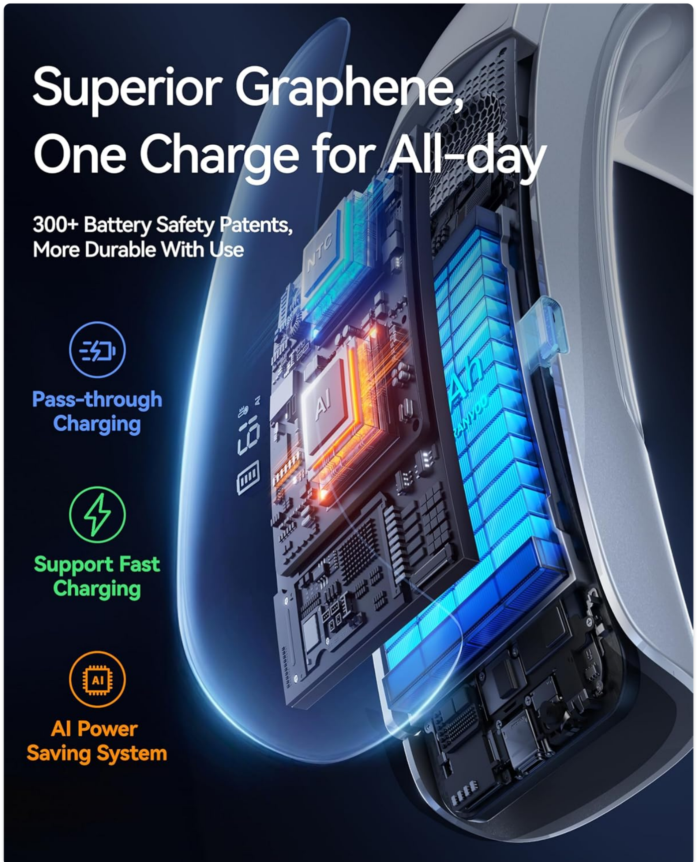
Figure 3: Overview of the device's battery and charging system.