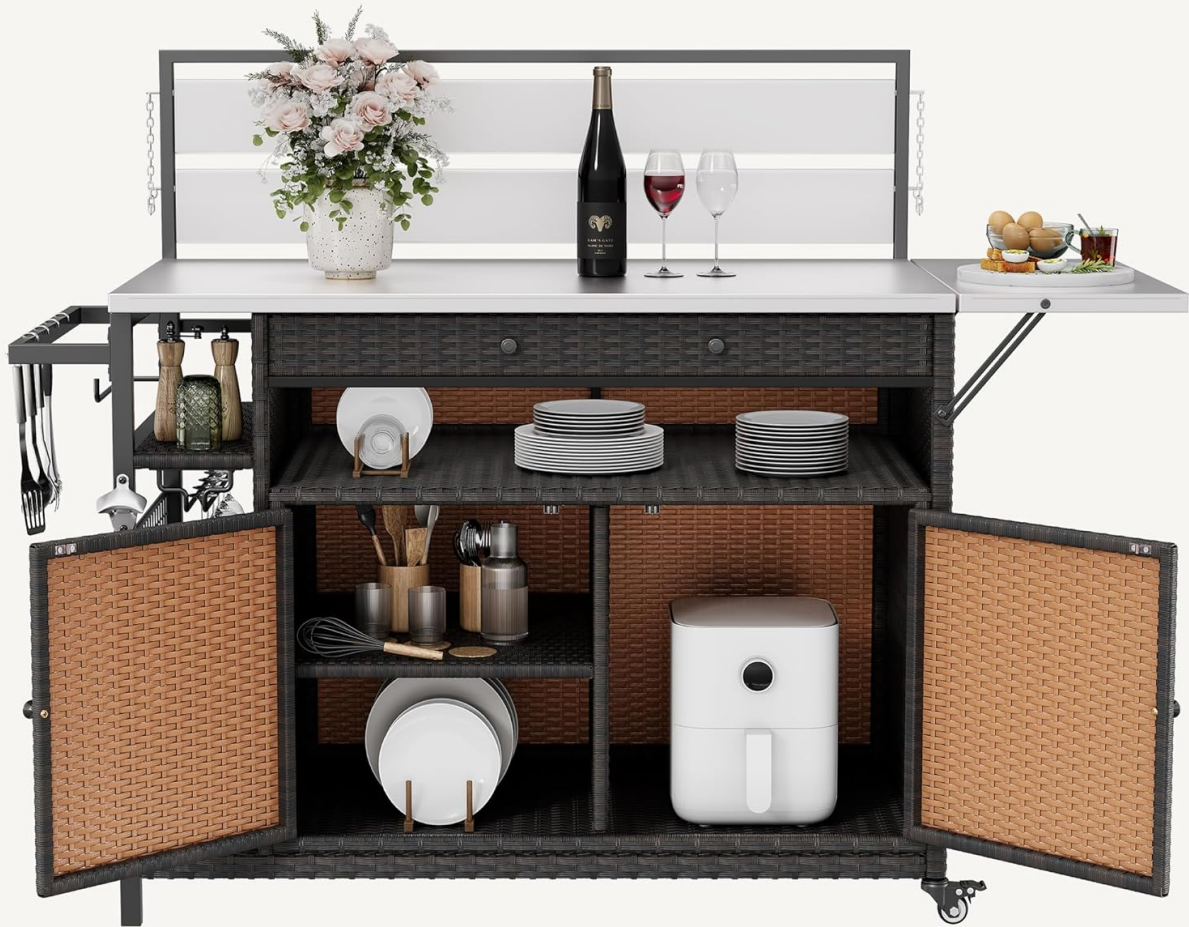
Image 3: View of the bar table with cabinet doors open, revealing the spacious interior storage compartments suitable for various kitchen items and appliances.

Your browser does not support the video tag.