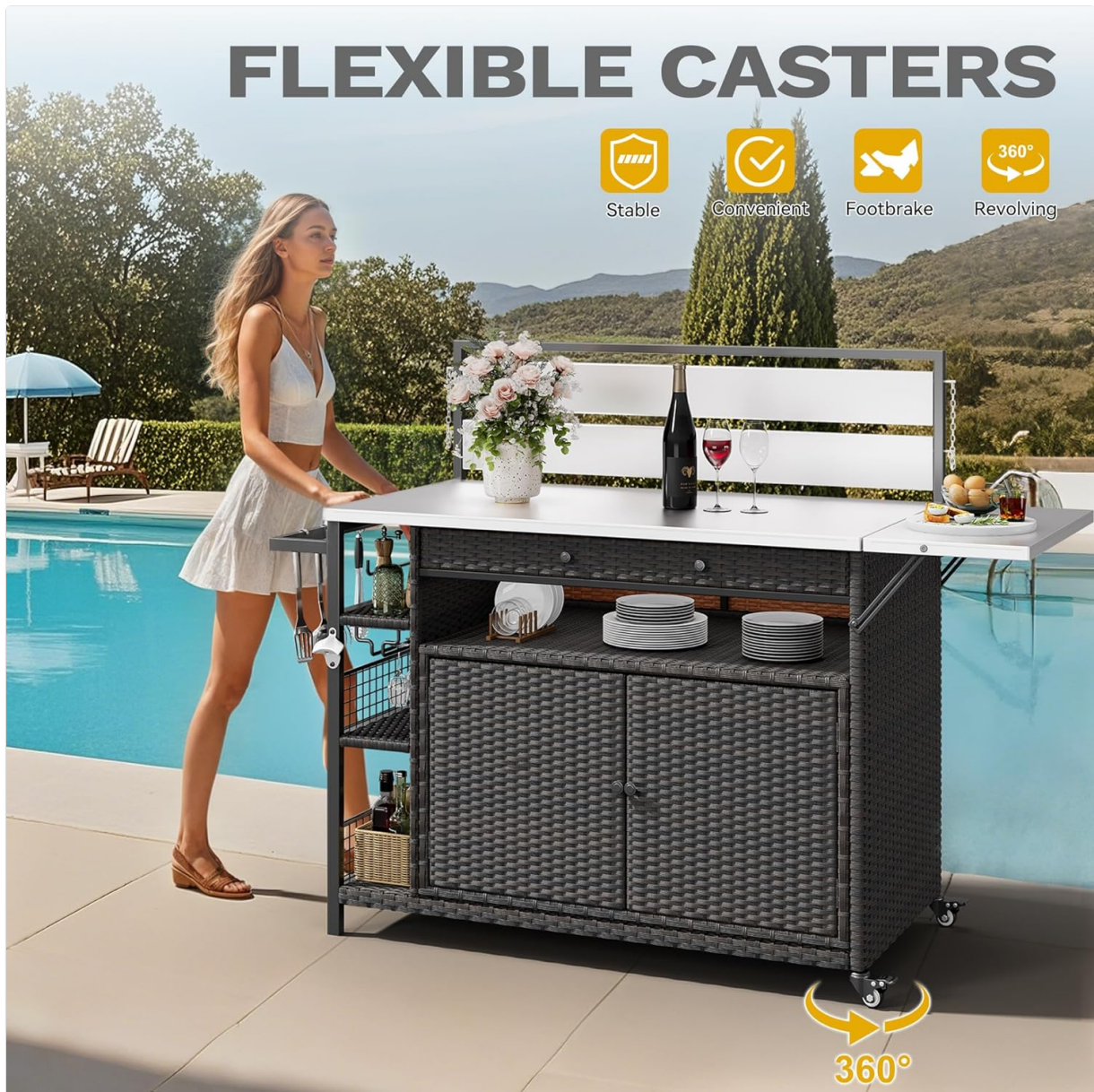
Image 1: Close-up of the flexible casters with footbrakes, highlighting the mobility and stability features of the bar table.

Once assembled, position the bar table on a flat, stable outdoor surface. The unit features 360° smooth wheels for easy mobility and brakes to ensure it stands firmly.