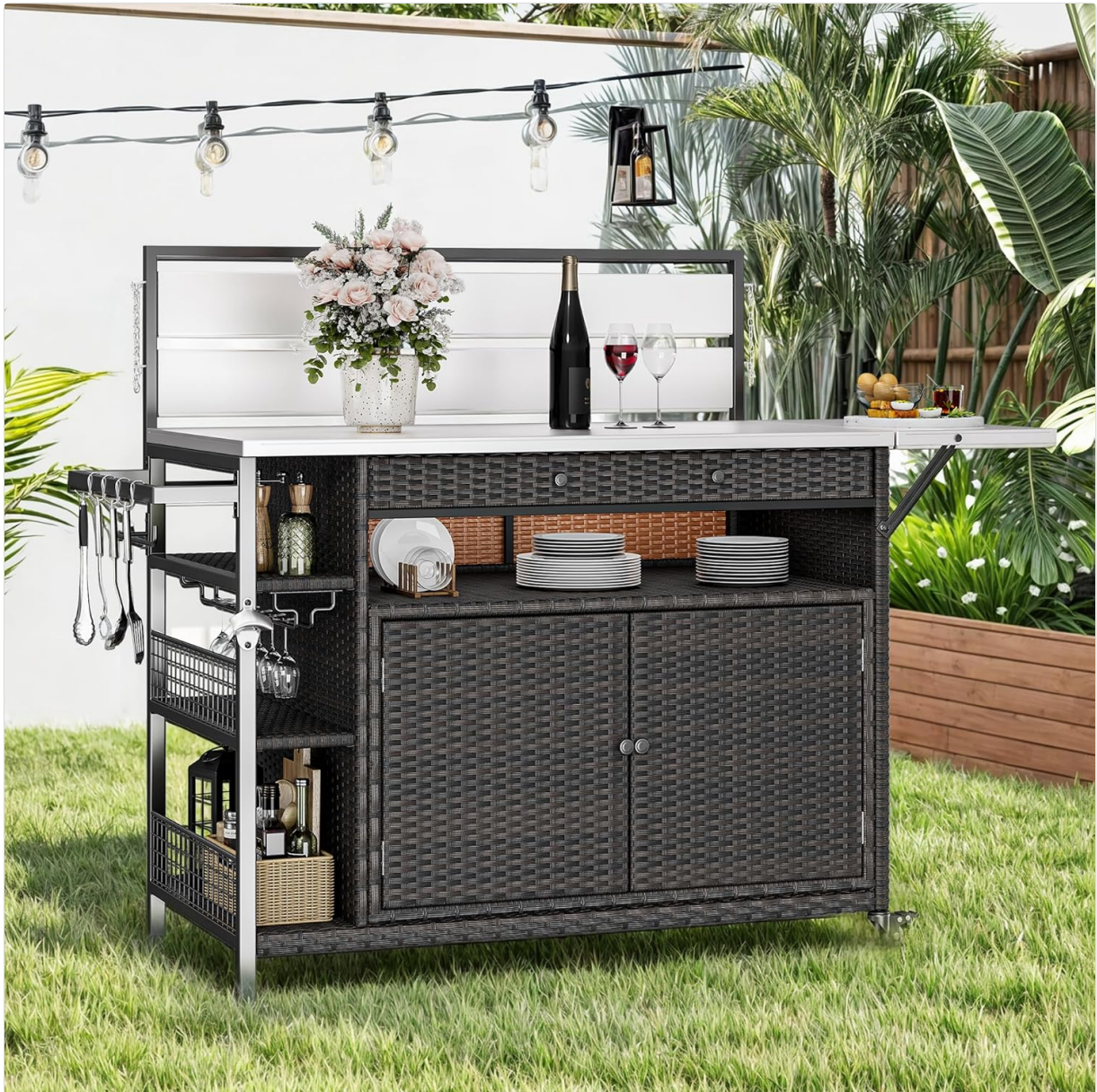
Image 2: The DWVO XL Outdoor Bar Table showcasing its extended stainless steel tabletop, open storage, and cabinet storage, ready for outdoor use.