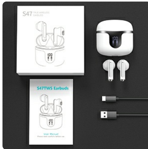
Image: A visual representation of the package contents, including the earbuds, charging case, charging cable, and user manual.