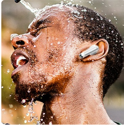
Image: A person wearing the earbuds while being splashed with water, illustrating their IPX7 water resistance for active use.

The S47 earbuds are IPX7 waterproof, meaning they can resist sweat, rain, and minor water splashes. They are suitable for workouts and outdoor activities. However, they are not designed for swimming or submersion in water. Ensure the earbuds are dry before placing them back into the charging case to prevent damage.