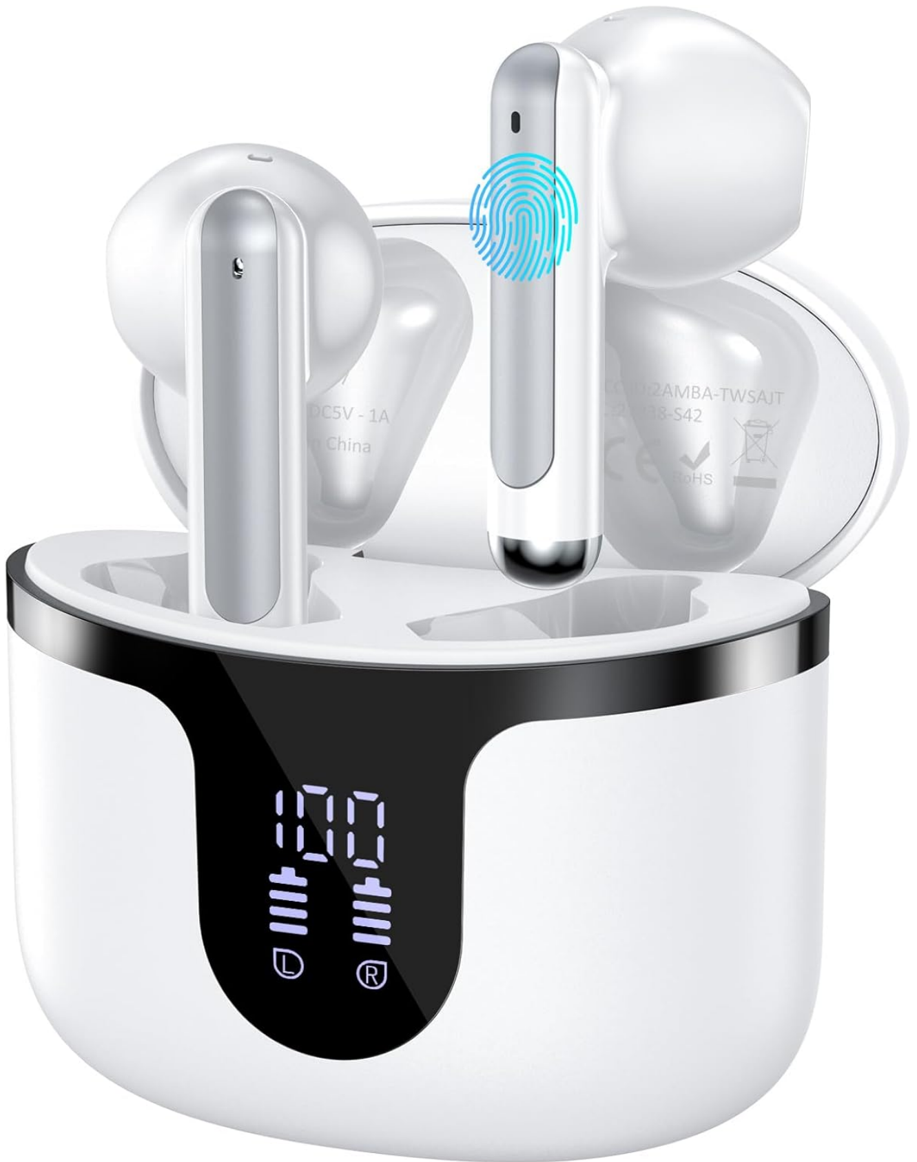
Image: The BHNYBWUL S47 Snow White Wireless Earbuds in their charging case, displaying the LED battery indicator.