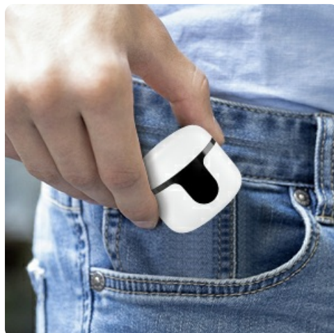
Image: The compact charging case easily fits into a pocket, highlighting its portability and ease of storage.

When not in use, store the earbuds in their charging case to protect them from dust and damage, and to keep them charged. Store the case in a cool, dry place away from extreme temperatures.