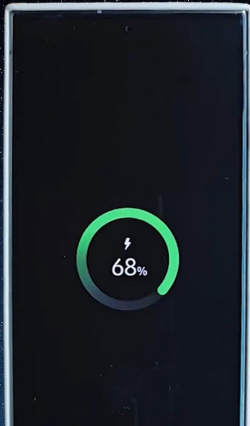
Image: The Jopuzia G25 Ultra screen showing the battery charging indicator, emphasizing the 7000mAh battery capacity.