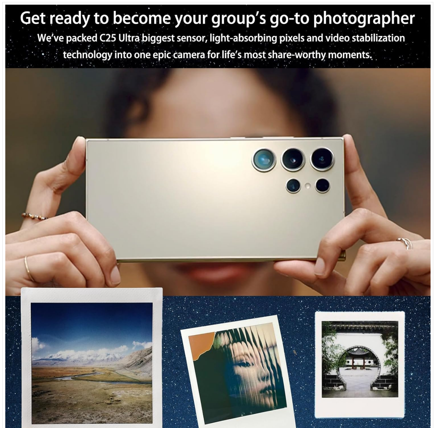
Image: The Jopuzia G25 Ultra displaying its camera interface, demonstrating focus capabilities and various shooting modes.