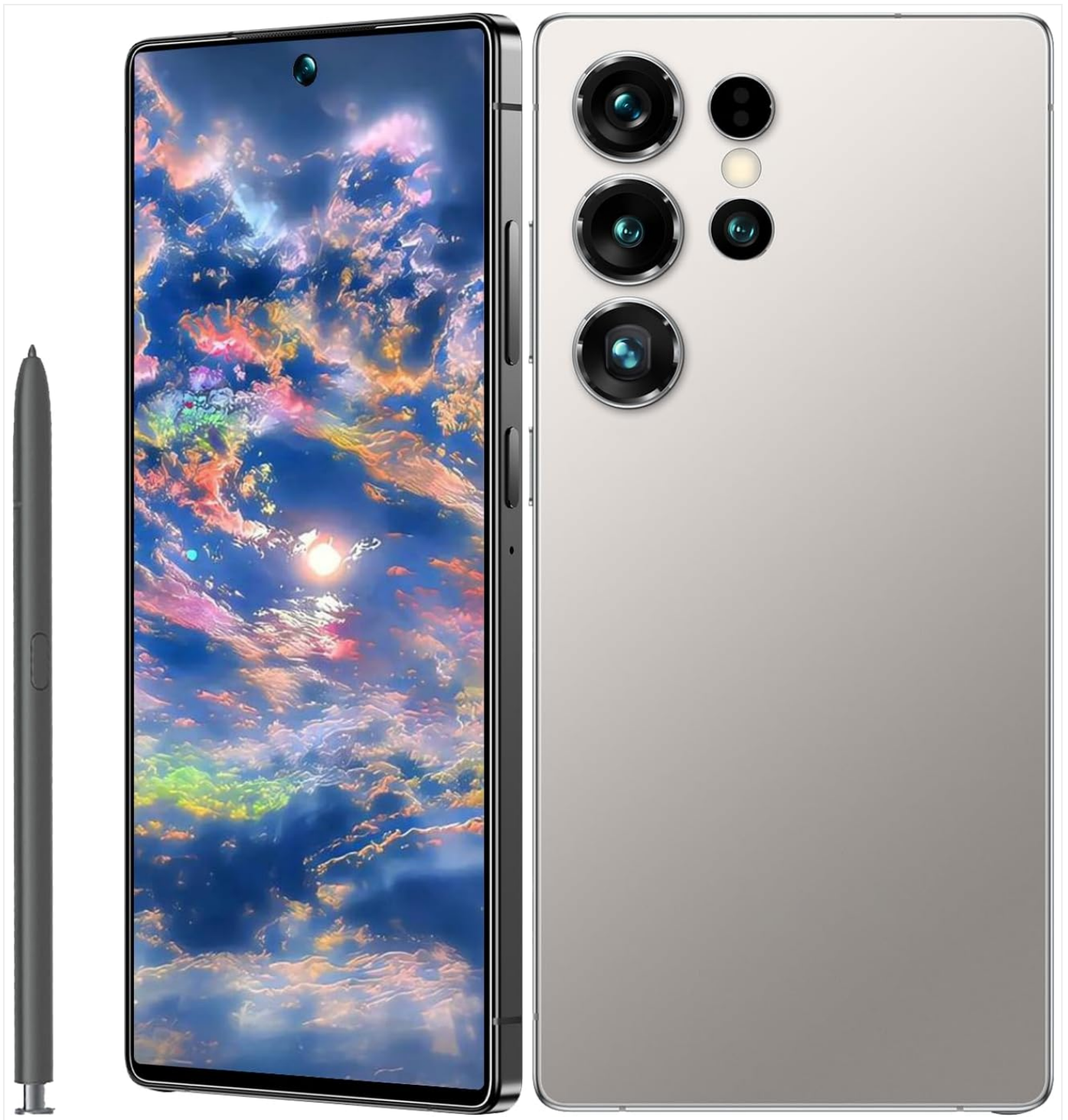
Image: The Jopuzia G25 Ultra smartphone shown with its included S Pen stylus, highlighting the device's sleek design and the accessory.