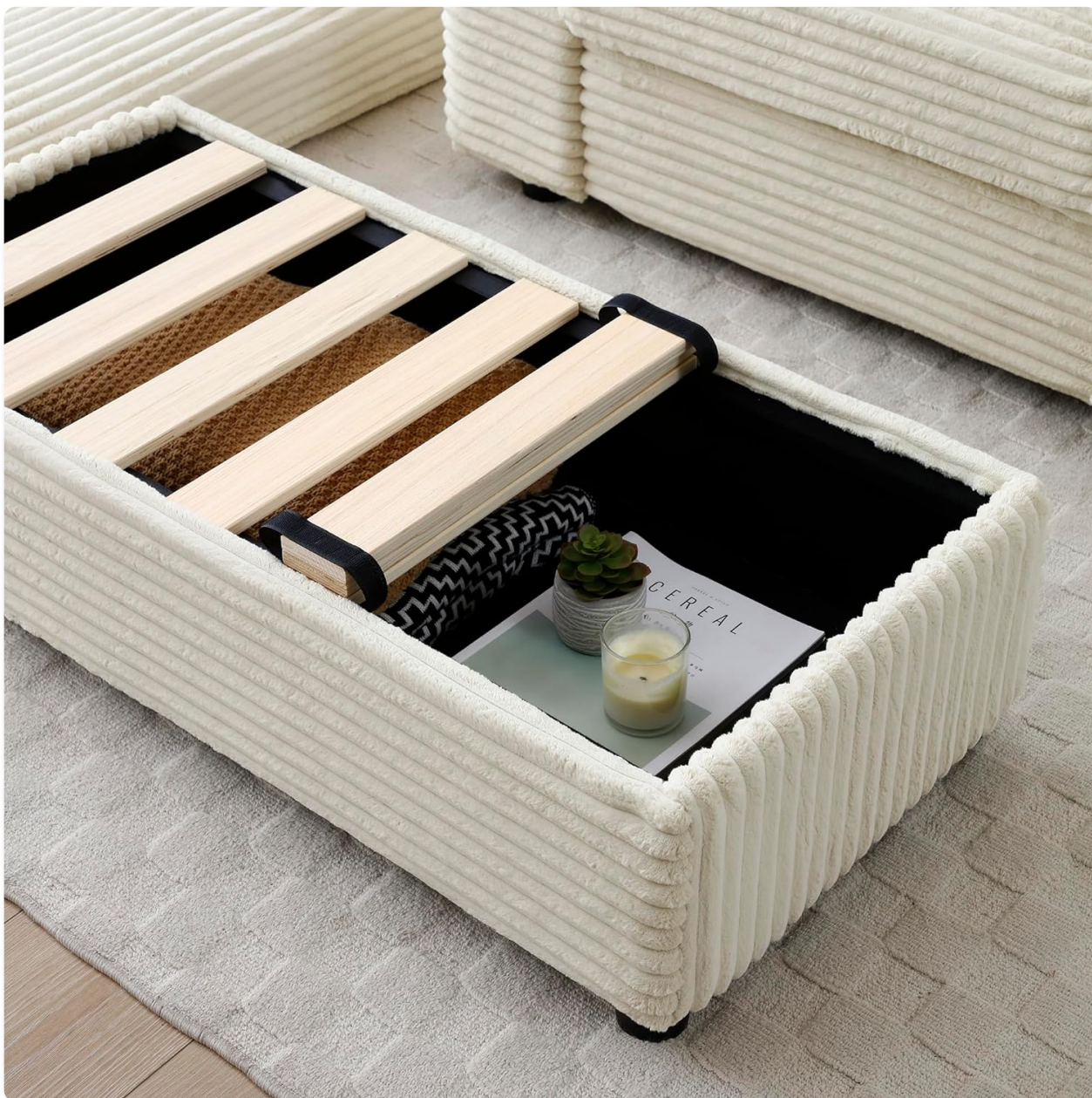
Image: An ottoman with its top lifted, revealing a spacious internal storage compartment, ideal for blankets, books, or other living room essentials.