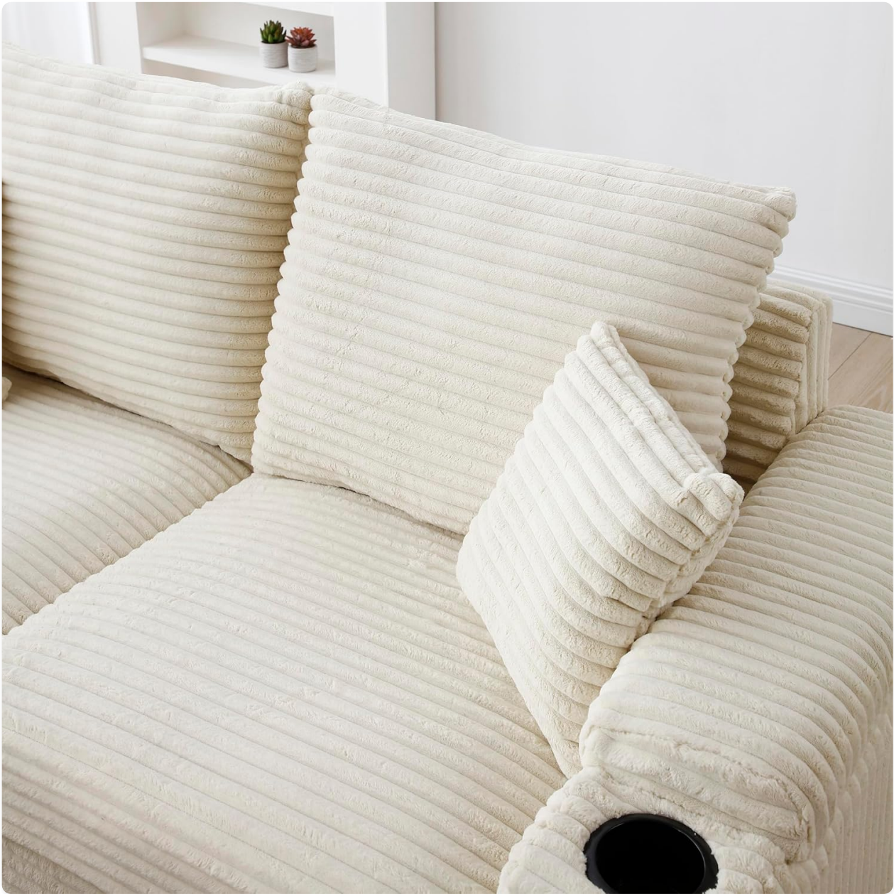
Image: A close-up shot highlighting the soft, ribbed texture of the corduroy fabric and the plushness of the sofa's cushions, emphasizing the material quality.