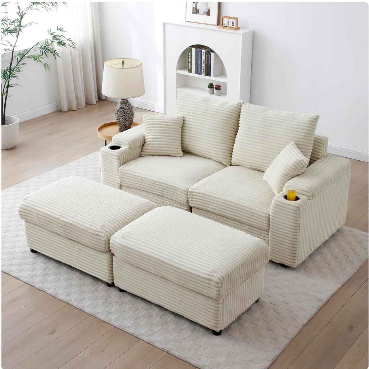
Image: The Loveseat with Ottomans Modular Sectional Sofa, showcasing its cream corduroy fabric and versatile configuration with two separate ottomans, suitable for various living spaces.