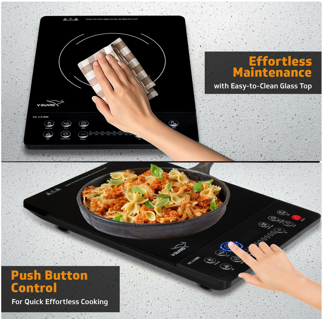
Image: Demonstrating the effortless maintenance of the cooktop's easy-to-clean glass top.