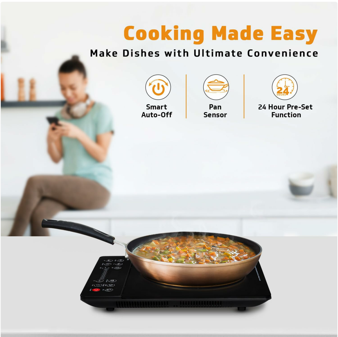
Image: The cooktop demonstrating Smart Auto-Off, Pan Sensor, and 24-hour Pre-set Function for enhanced convenience.