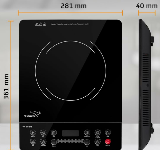
Image: Illustration of the cooktop's aerodynamic cooling system and compact dimensions (361mm x 281mm x 40mm).

Stylish and Compact Design Easy to Fit in your Kitchen