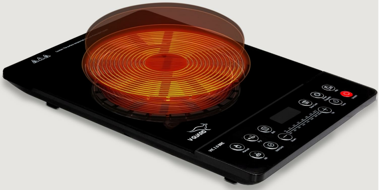
Image: Visual representation of the cooktop's power and temperature settings, ranging from 300W/80°C to 2000W/240°C.