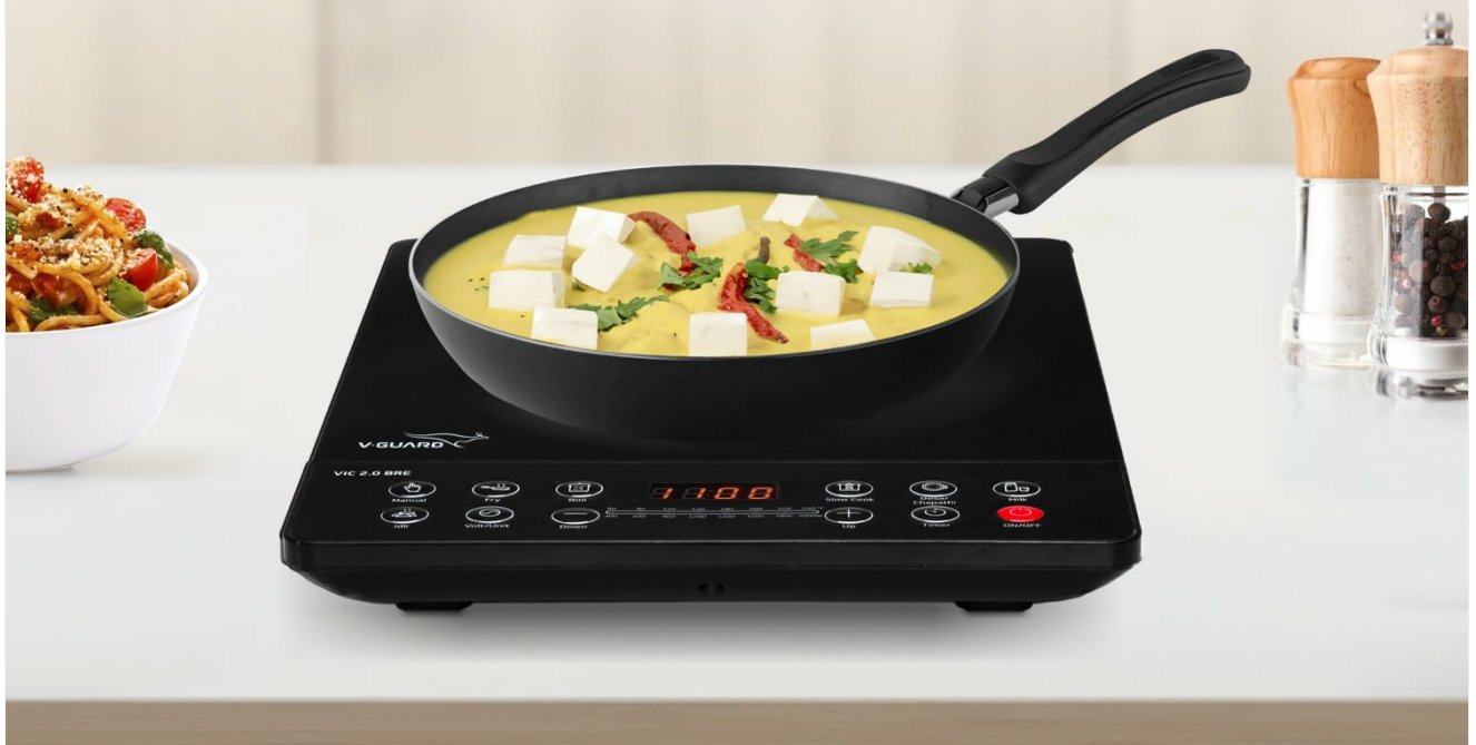
Image: Key features of the V-Guard VIC 2.0 BRE Induction Cooktop, including surge protection, temperature levels, timer, and cooking modes.