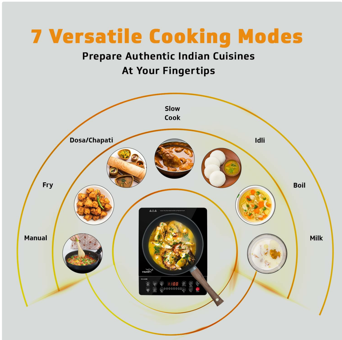
Image: A visual guide to the 7 versatile cooking modes available on the V-Guard VIC 2.0 BRE Induction Cooktop.