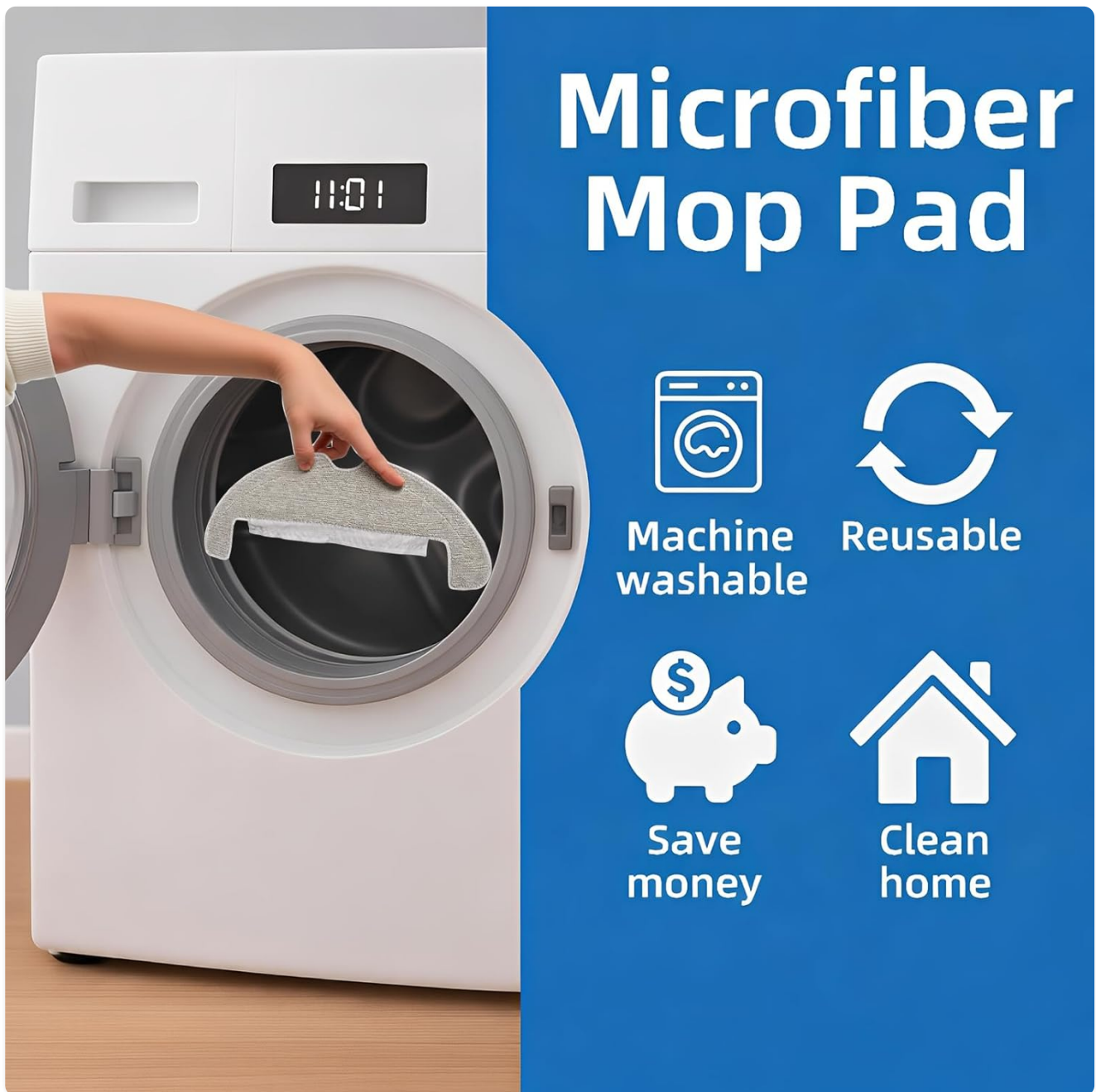
Image: Microfiber Mop Pad, indicating it is machine washable and reusable, contributing to cost savings and a clean home.