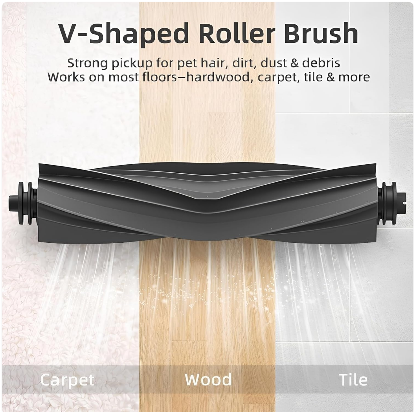
Image: V-Shaped Roller Brush designed for effective pickup on hardwood, carpet, and tile floors.

Strong pickup for pet hair, dirt, dust & debris Works on most floors—hardwood, carpet, tile & more