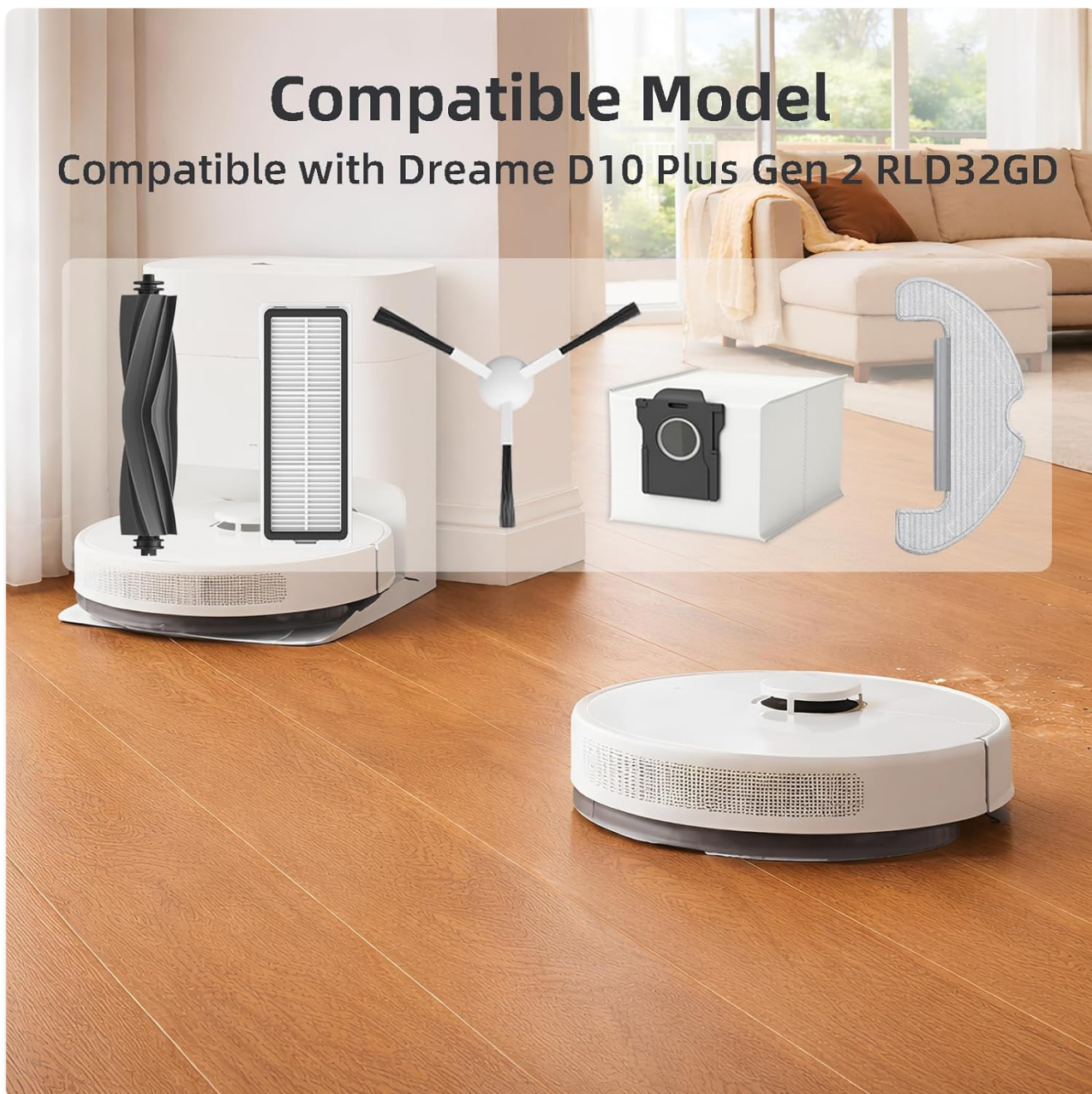
Image: Overview of replacement parts installed on the Dreame D10 Plus Gen 2 robot vacuum. This image shows the main brush, HEPA filter, side brush, and dust bag in relation to the vacuum cleaner.

Compatible with Dreame D10 Plus Gen 2 RLD32GD