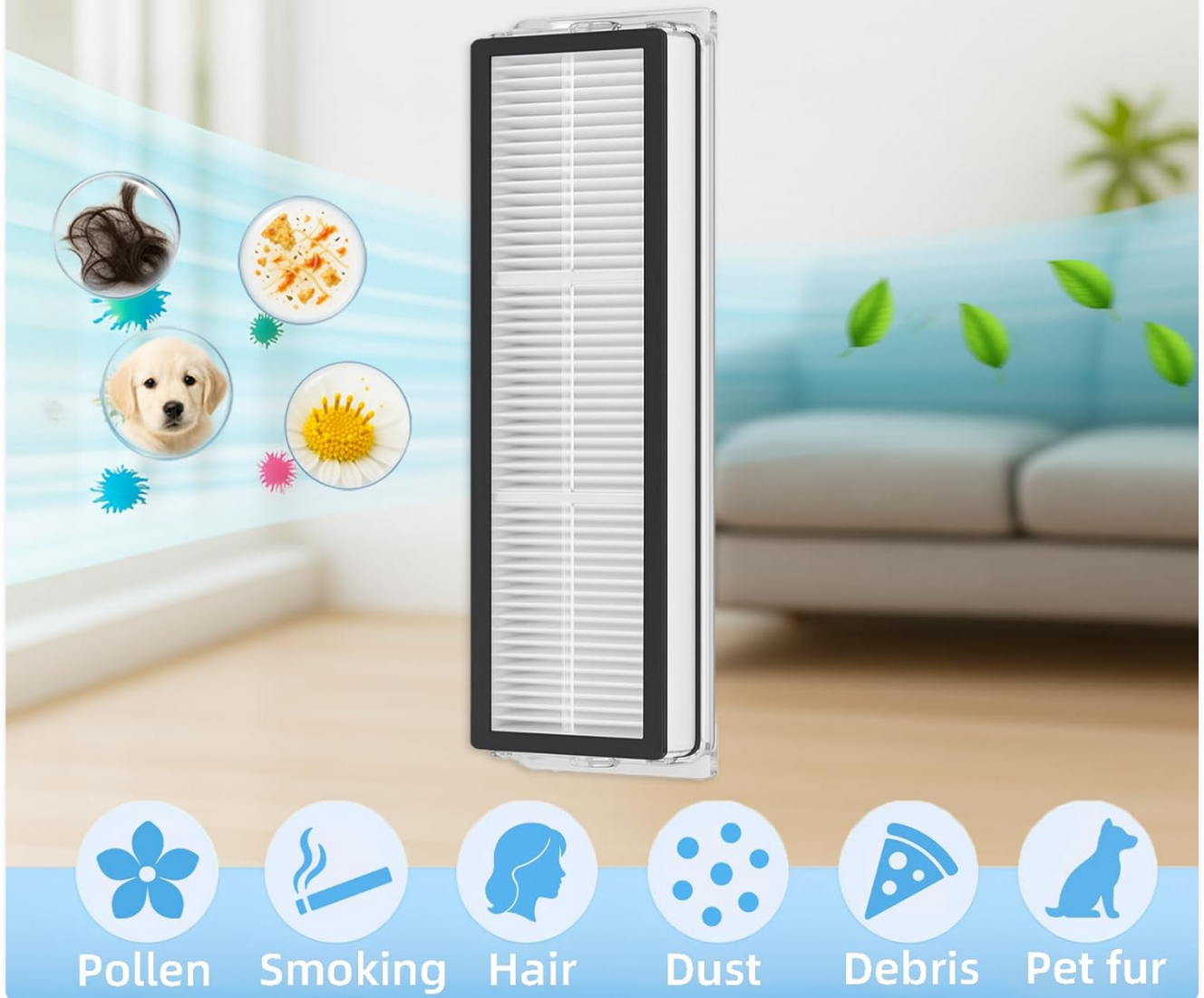
Image: High-Efficiency HEPA Filter designed to capture 99.9% of airborne particles as small as 0.1 microns, including pollen, smoke, hair, dust, debris, and pet fur.

Captures 99.9% of airborne particles as small as 0.1 microns