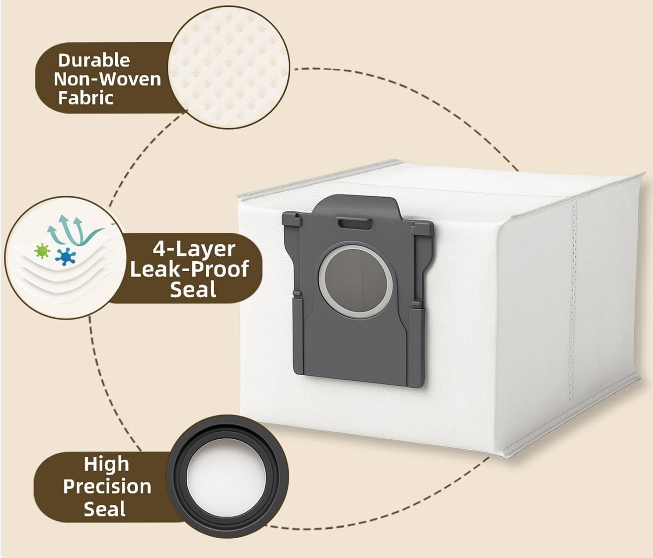
Image: Illustration of the dust bag's construction, featuring durable non-woven fabric, a 4-layer leak-proof seal, and a high-precision seal to prevent leakage.