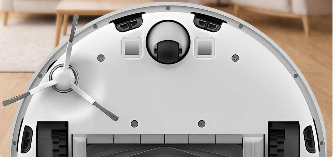
Image: Illustration of the 3-arm side brush, highlighting its perfect fit, sturdy connection, and gentle bristles for floor protection.