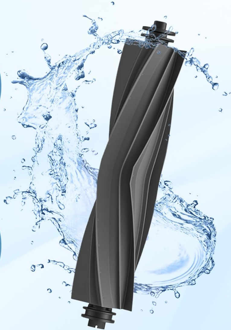
Image: Close-up of the V-shaped brush design and a quick-release cap for simplified hair removal and maintenance.