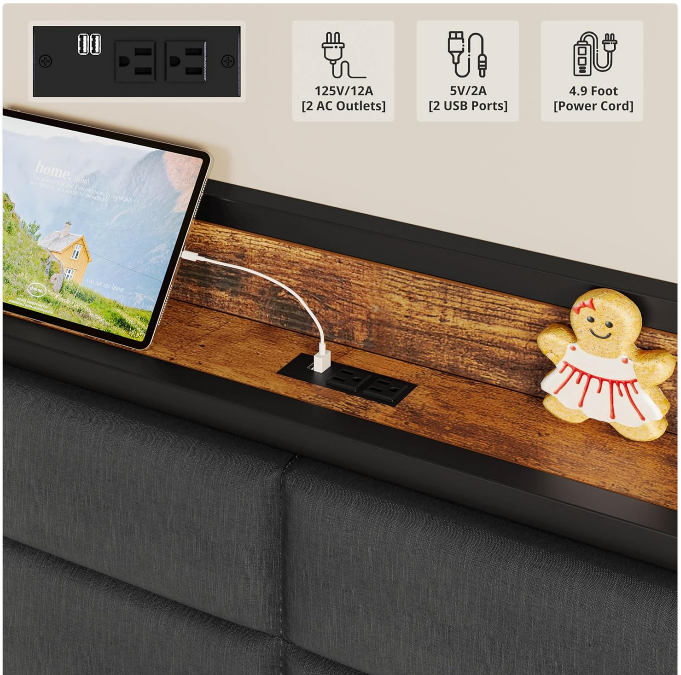
Image: A detailed view of the built-in charging station on the daybed's headboard shelf, showing the AC outlets and USB ports.