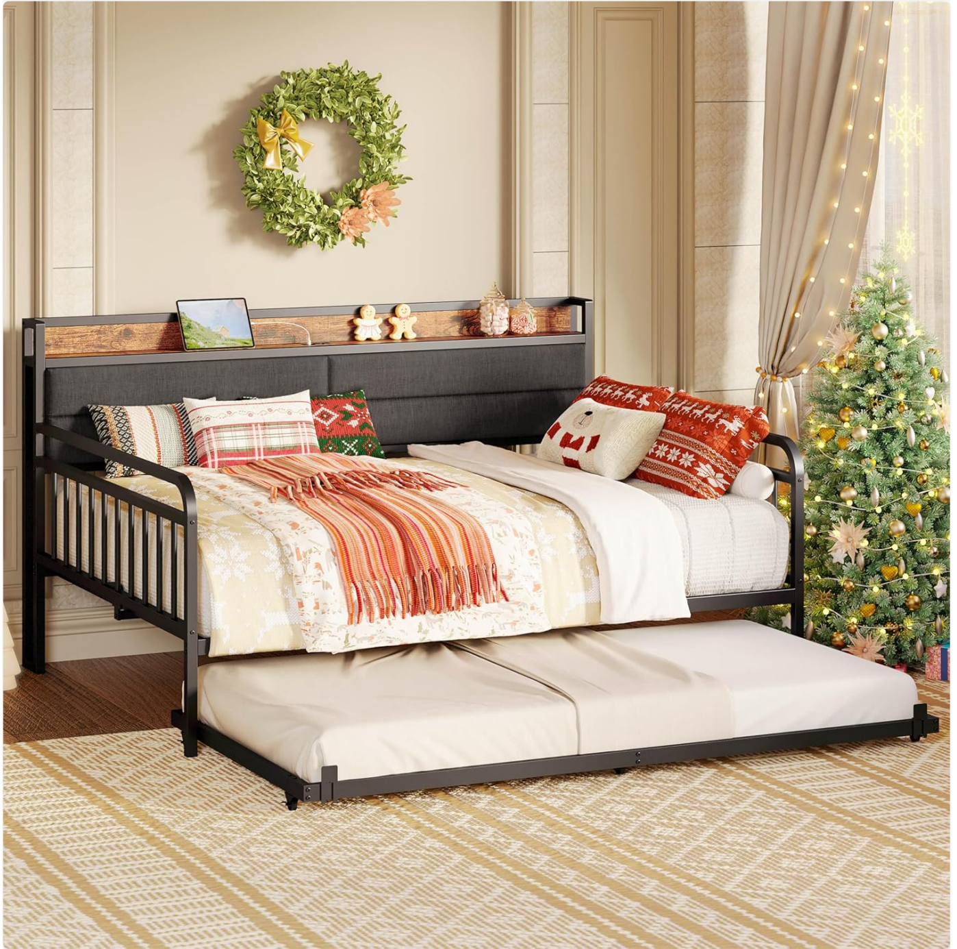
Image: The LIKIMIO Daybed with Trundle positioned in a room, demonstrating its use as both a bed and a seating area.