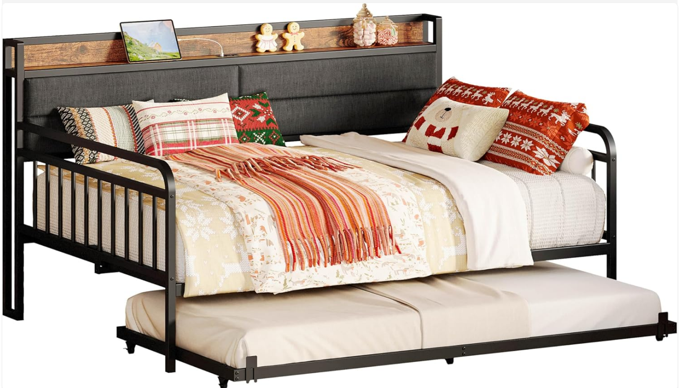
Image: The LIKIMIO Daybed with Trundle in a black finish, showcasing its full-size bed and pull-out twin trundle.

Thank you for choosing the LIKIMIO Daybed with Trundle. This sturdy metal full-size bed frame features an upholstered headboard and a convenient built-in charging station, making it an ideal solution for living rooms, bedrooms, and guest rooms. Designed for durability and versatility, it provides both comfortable sleeping space and practical seating.