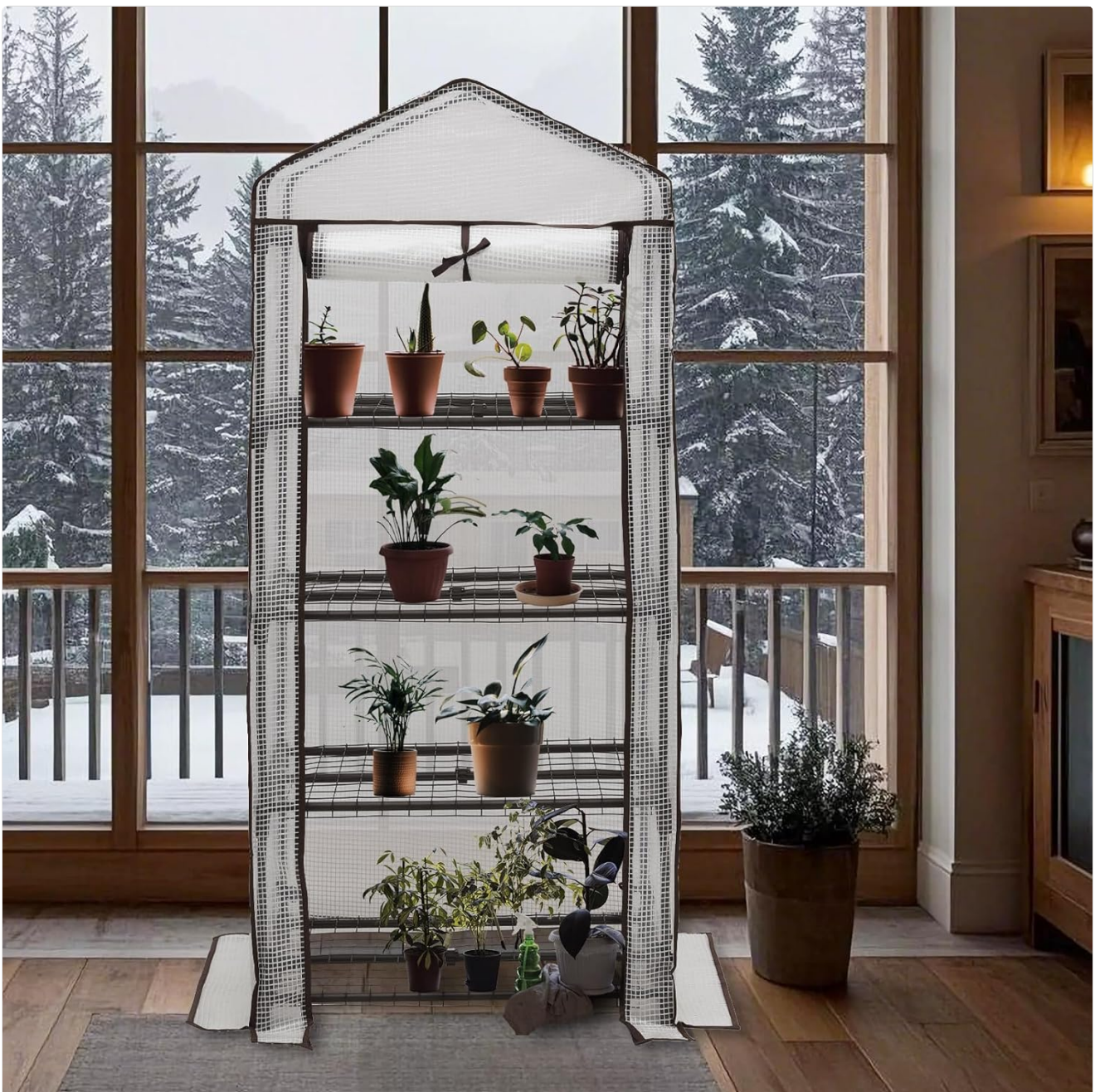
Image 5.4: The greenhouse can be used indoors to protect plants during colder seasons.