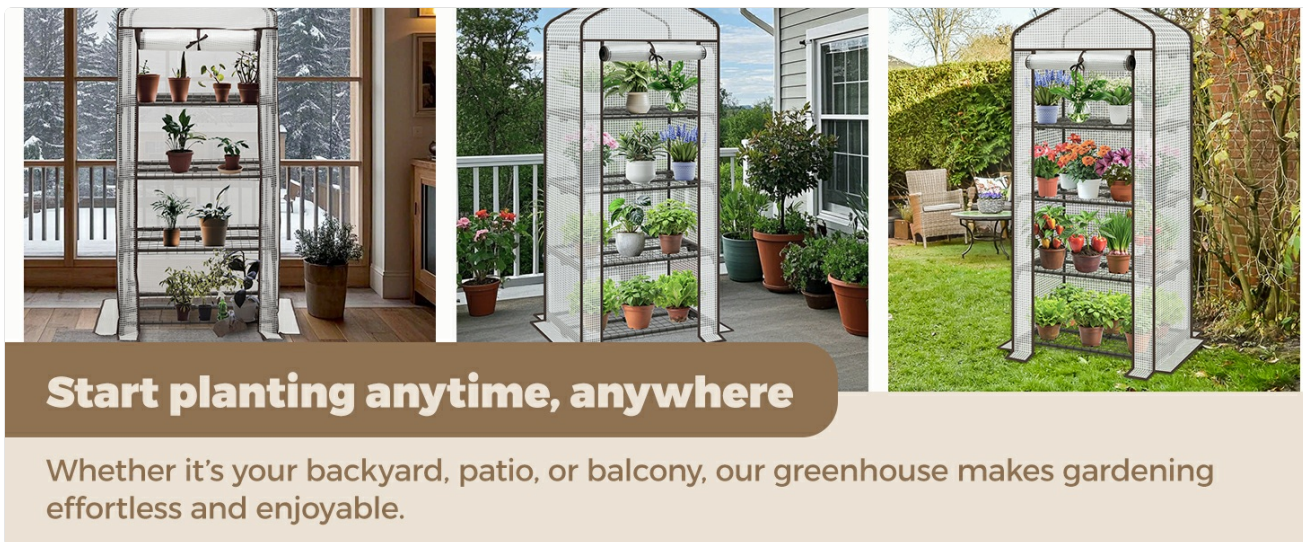
Image 5.2: The roll-up door can be secured open for ventilation or zipped closed for warmth.

The roll-up door provides essential ventilation. Open the door during warmer periods to prevent overheating and ensure air circulation. Close it to retain heat and humidity, especially during cooler temperatures or at night.