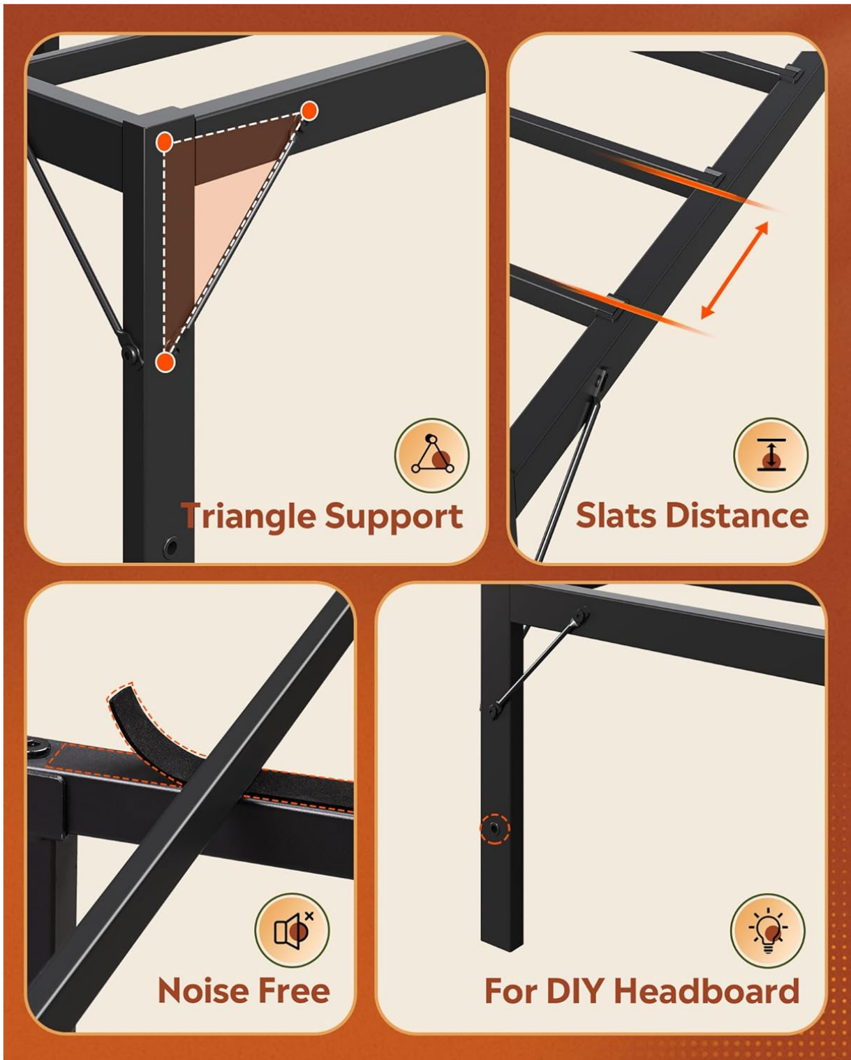
Image: Detailed view of frame features including triangular support, slat spacing, noise reduction, and headboard attachment.