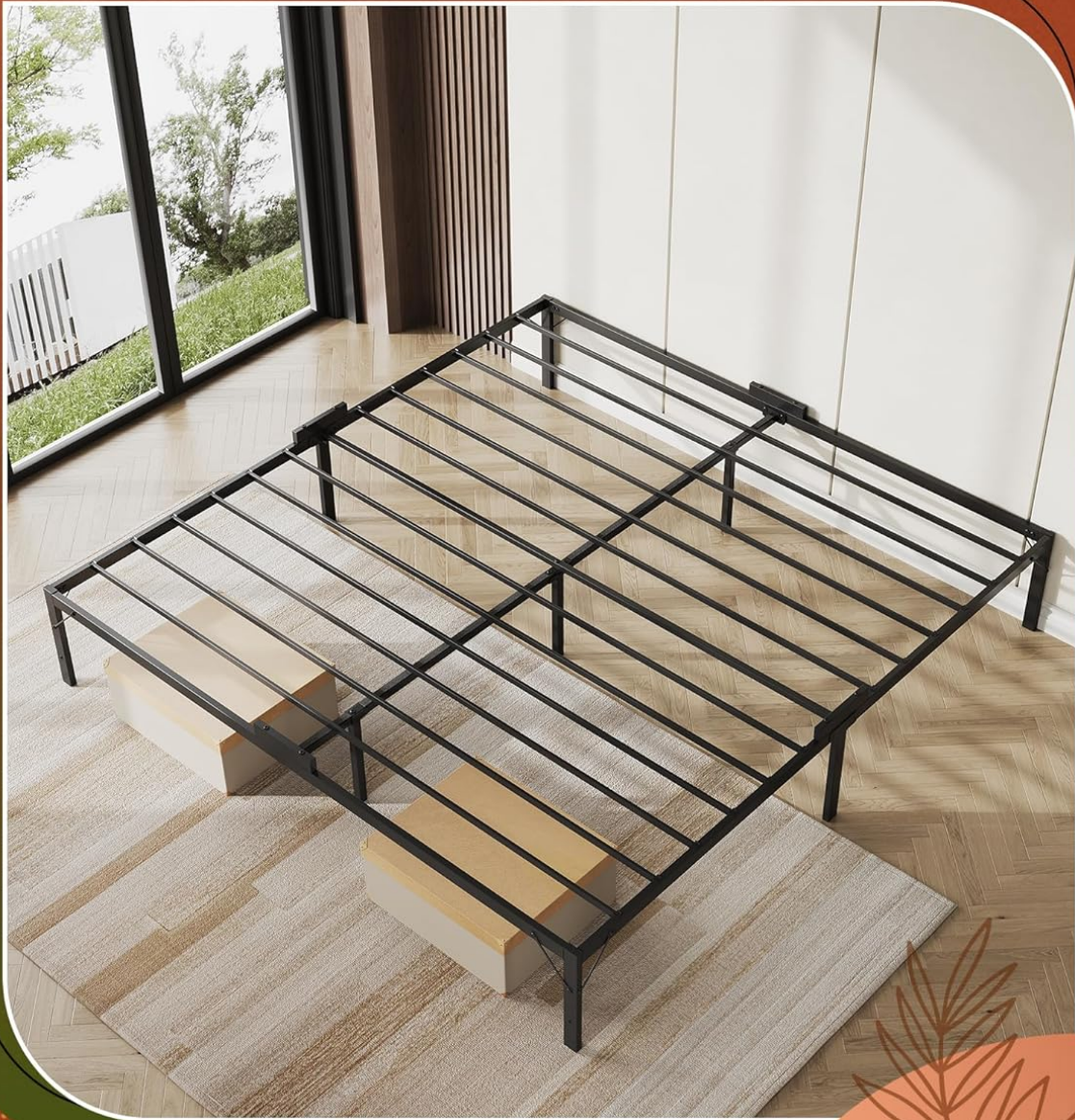
Image: The bed frame in use, highlighting the under-bed storage capacity.