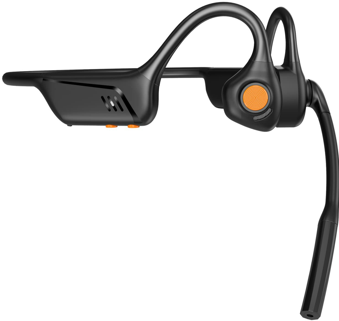
Front view of the eppfun AKC headset, showing its ergonomic design.