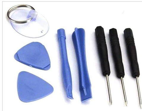
Image 2: A close-up view of the basic device opening tools, which typically include small screwdrivers, plastic pry tools, and a suction cup for screen removal.