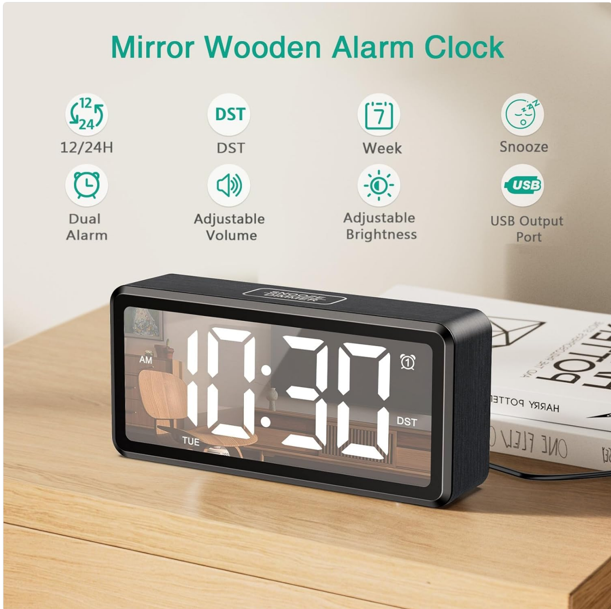
Image: Display showing the two independent alarms and the three selectable alarm modes (Monday-Friday, Monday-Sunday, Saturday-Sunday).