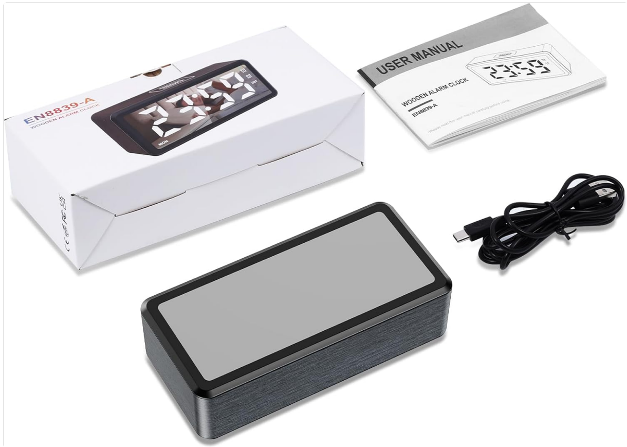
Image: Contents of the product package, including the alarm clock, Type-C cable, and user manual.