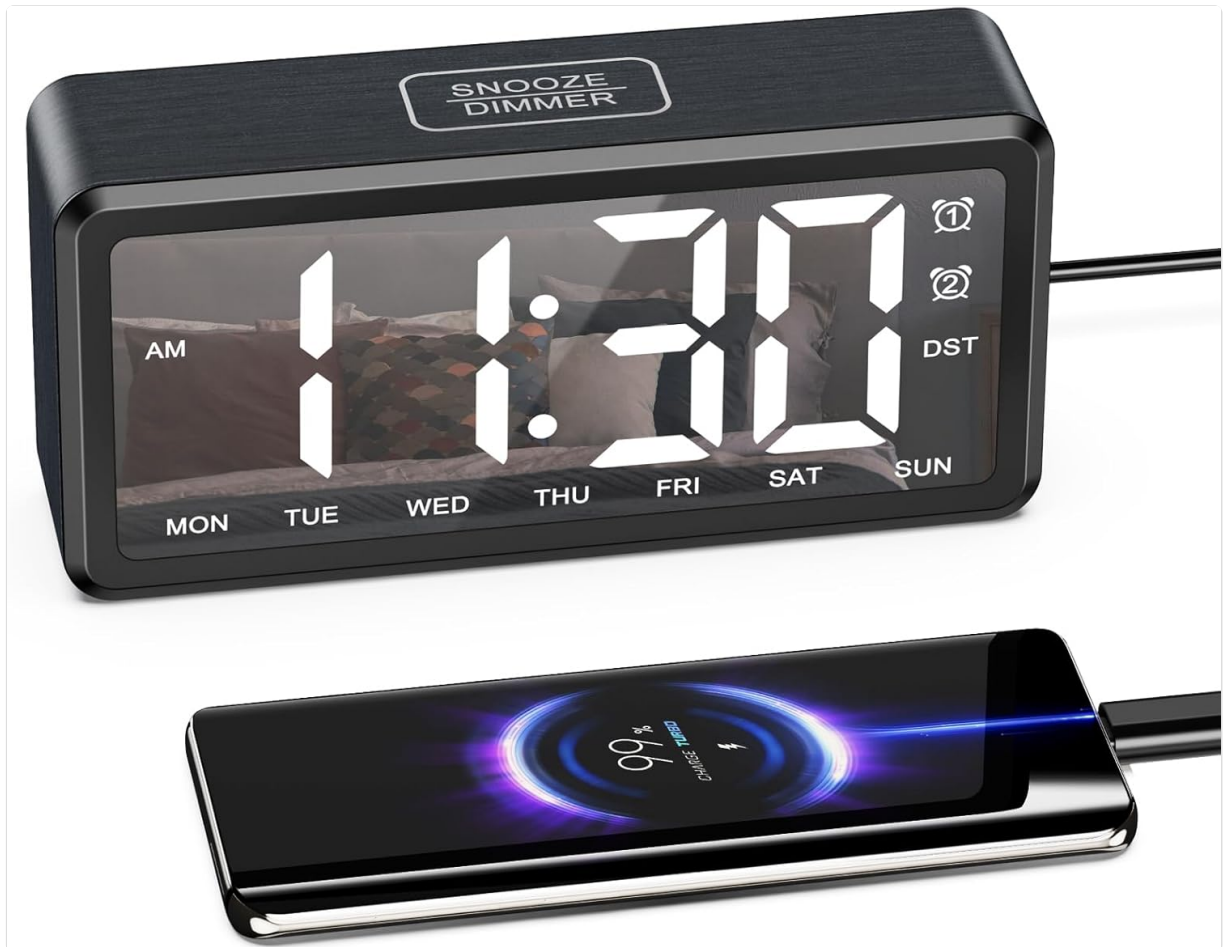
Image: The ORIA Wooden Digital Alarm Clock, showcasing its LED display and wooden finish.

This manual provides detailed instructions for the setup, operation, and maintenance of your ORIA Wooden Digital Alarm Clock. Please read this manual thoroughly before using the product to ensure proper function and longevity.