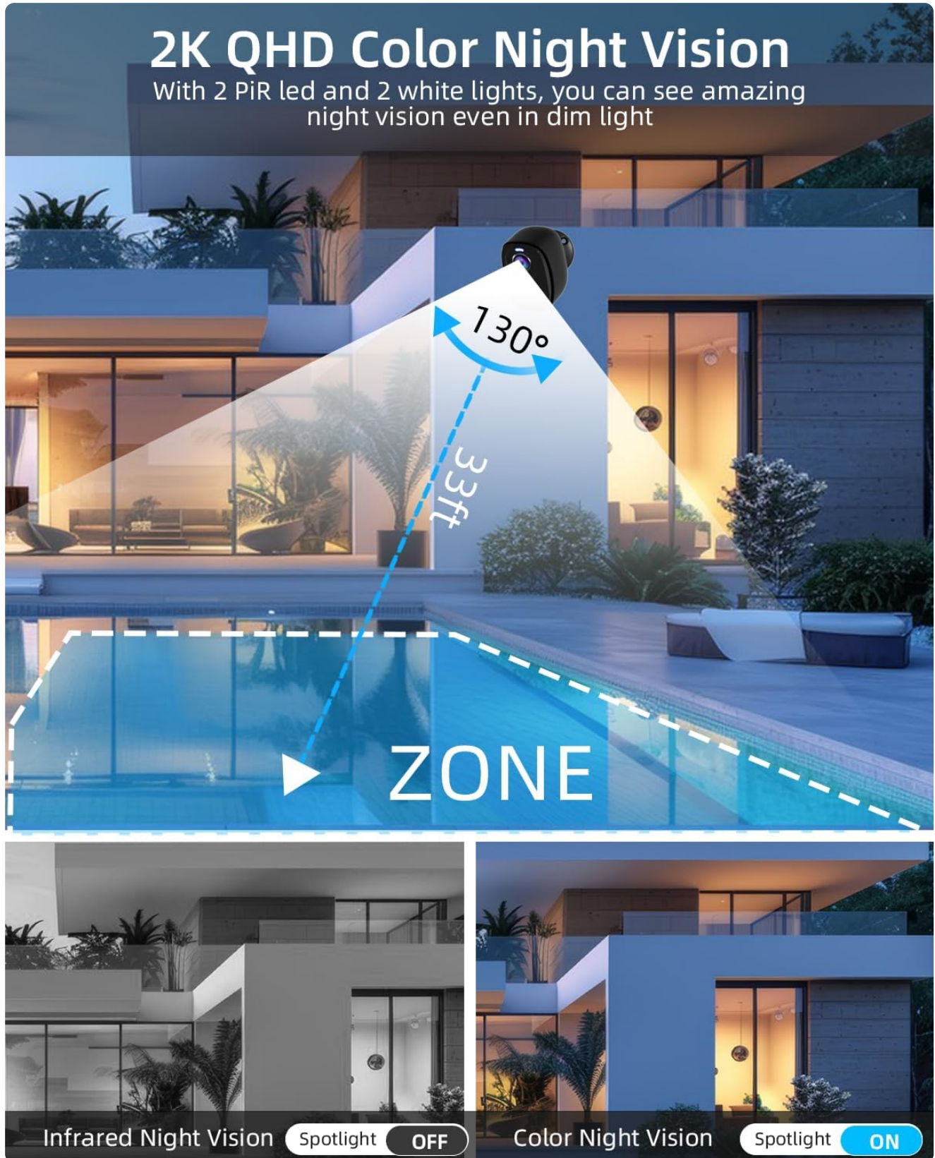
Image 2.1: The ELECCTV W1 camera demonstrating its 130-degree wide-angle view and 33ft night vision range, highlighting both infrared and color night vision capabilities.

Familiarize yourself with the camera's physical features and capabilities.