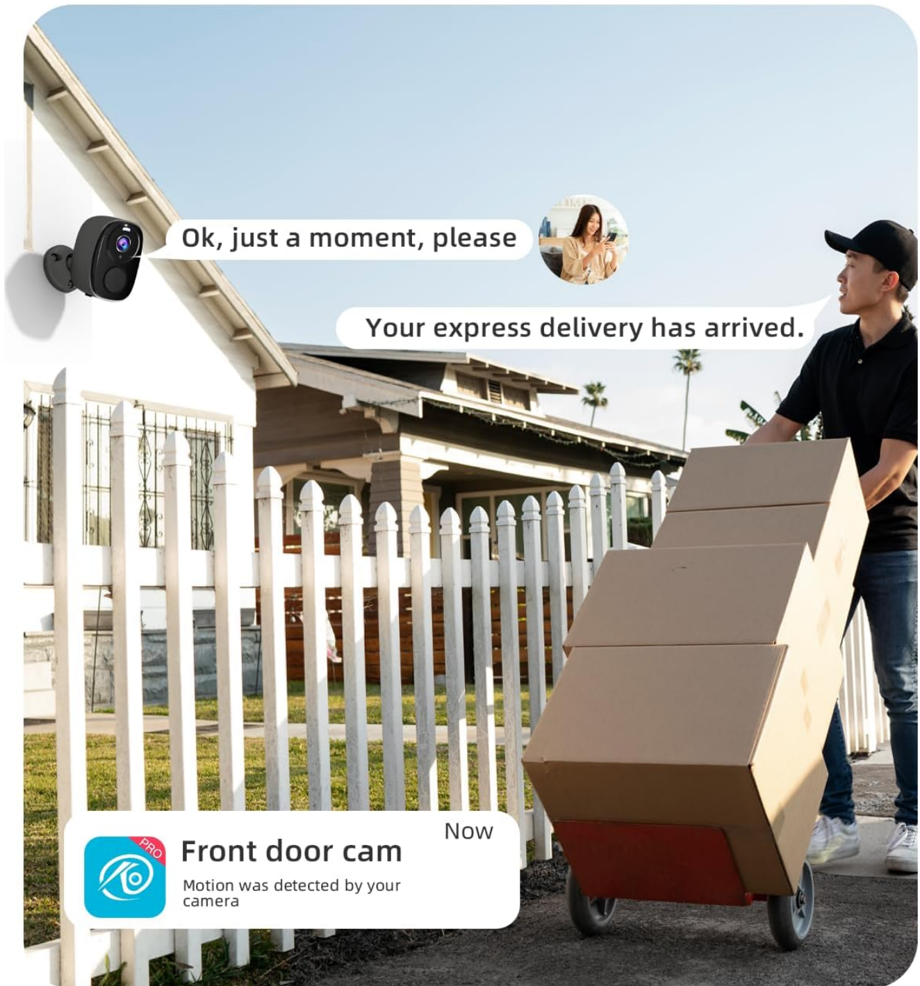
Image 4.2: A user communicating with a delivery driver via the camera's two-way audio feature, demonstrating real-time interaction.

Listen and talk in real-time with the built-in microphone and speaker