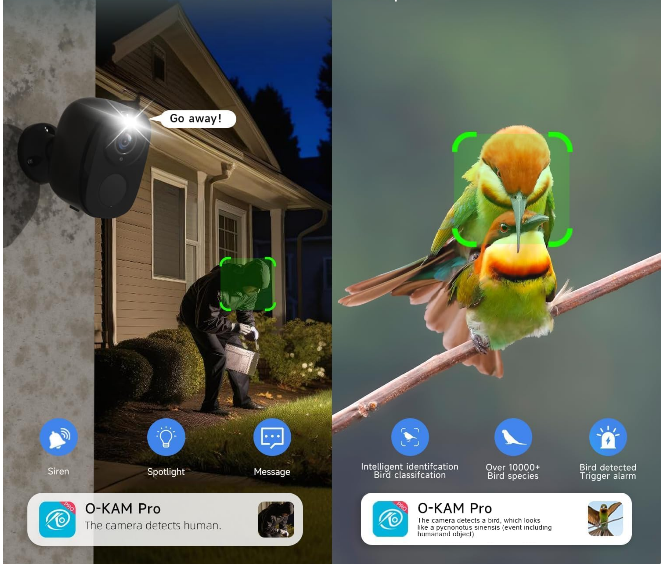
Image 4.7: The camera's bird identification feature, showing a bird detected and classified, alongside its night vision capabilities for human detection.

AI Birds Identification with 10000+ Species (needs to subscription)