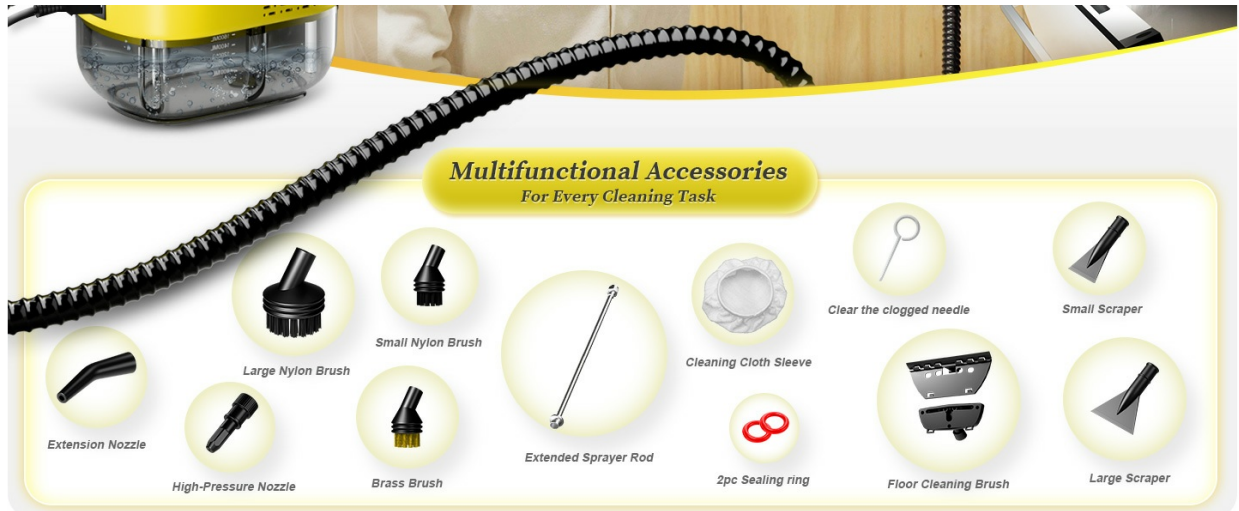
Image: Detailed diagram showcasing the multifunctional accessories included with the Flgocexs Steam Cleaner.