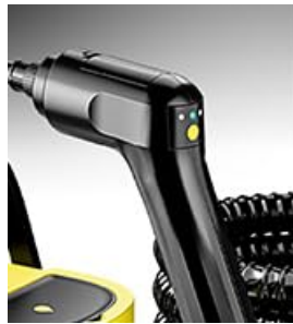
Image: Close-up of the ergonomic handle with remote control buttons and indicator lights for easy steam intensity adjustment.