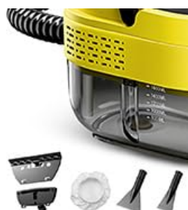
Image: Close-up view of the 1600ML water tank and funnel-shaped filling port, highlighting the ease of water addition.