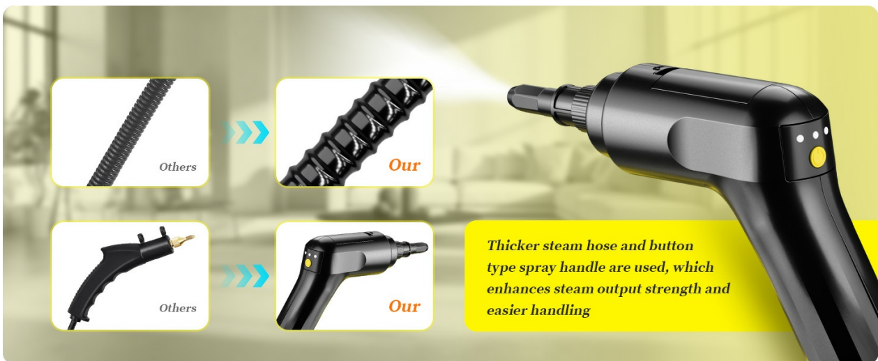
Image: Visual comparison showing the thicker steam hose and button-type spray handle, designed for enhanced steam output and easier handling.