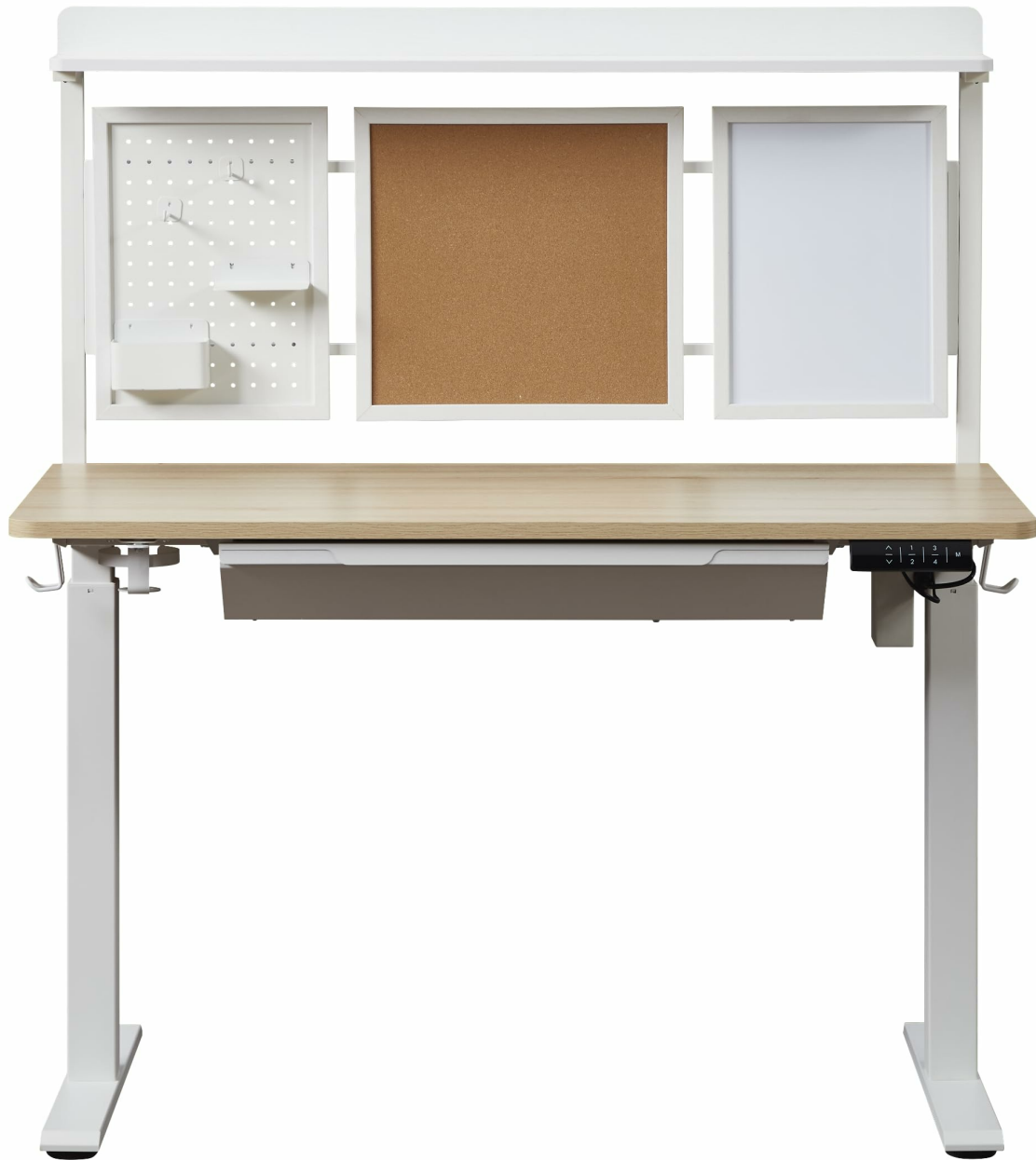
Image 1.1: The Kowo K304 Electric Height Adjustable Standing Desk with its integrated backboard and accessories.