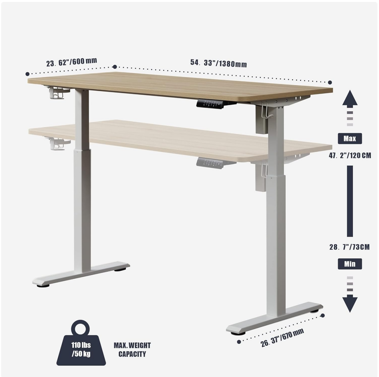
Image 8.1: Key dimensions and weight capacity of the Kowo K304 desk.