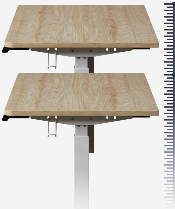
Image 5.2: Illustration of the desk's height adjustment range and mechanism.