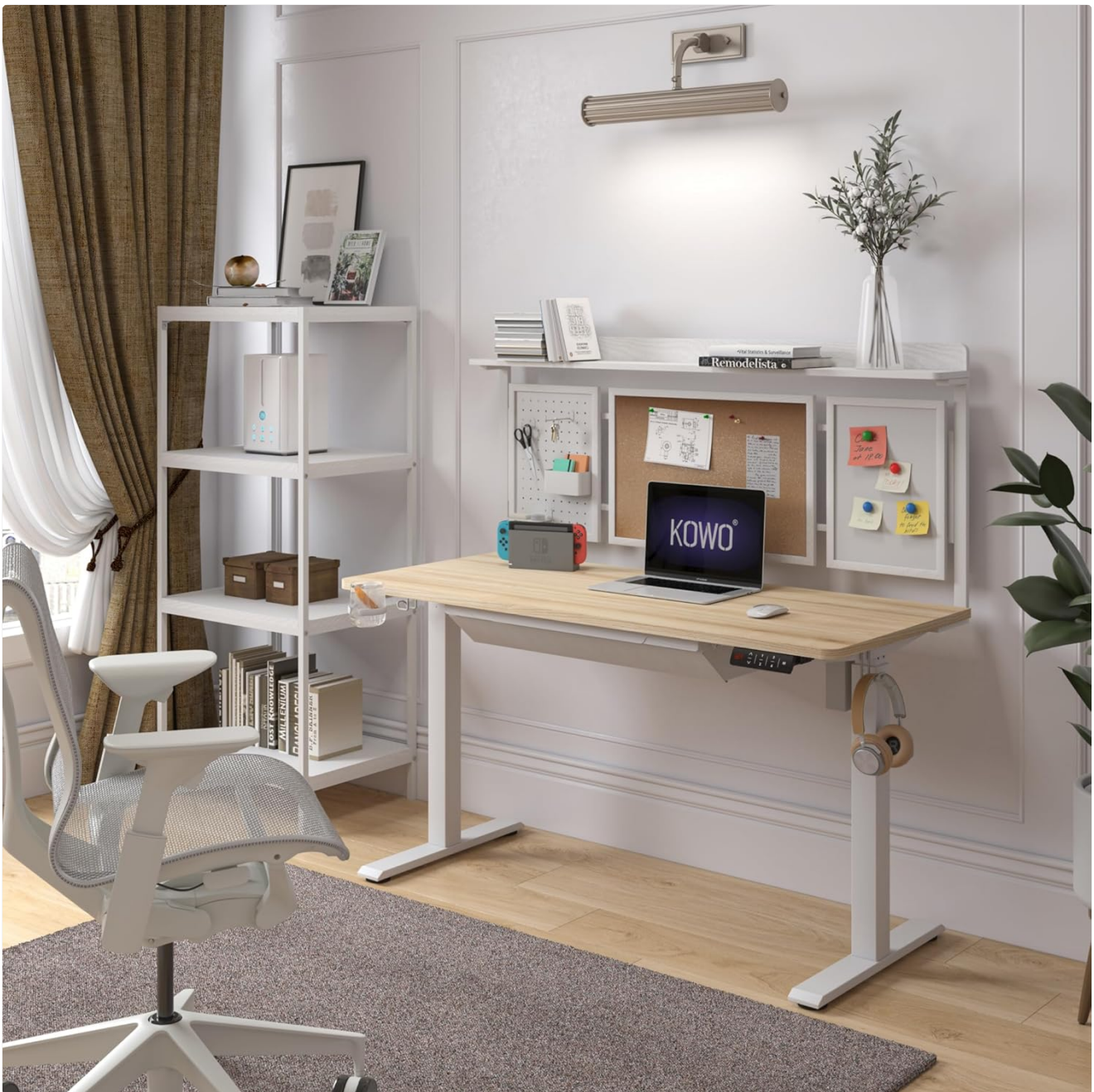
Image 1.2: Kowo K304 desk integrated into a home office environment.