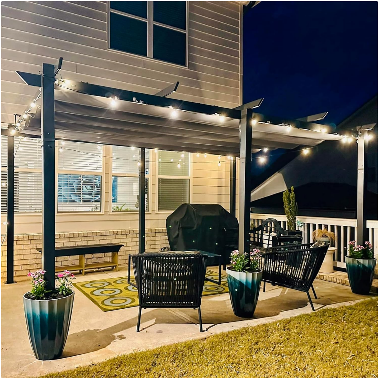
Image: Pergola at Night. The pergola is shown at night, illuminated by string lights, creating an inviting and ambient outdoor living space on a patio, highlighting its aesthetic appeal for evening use.