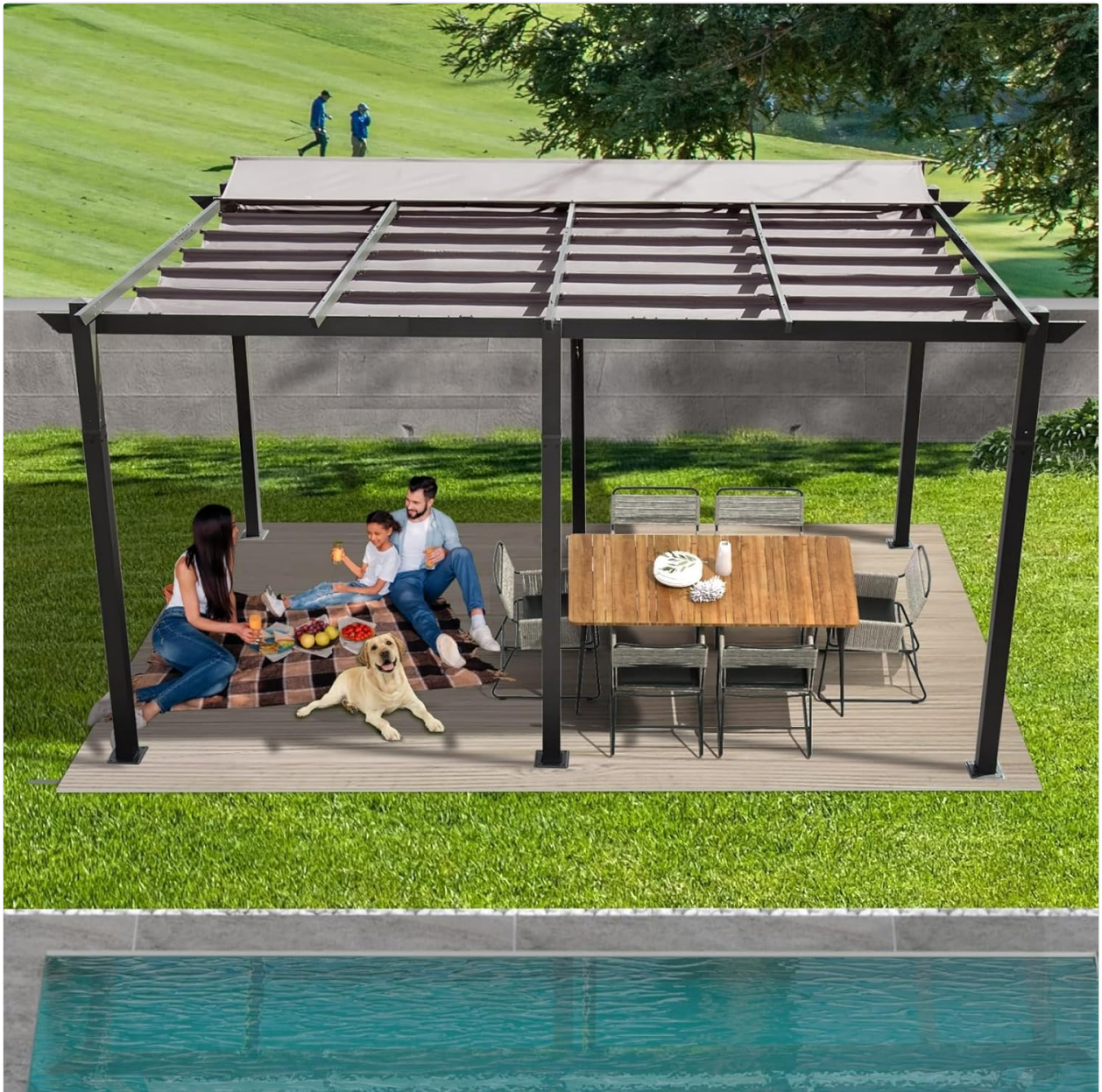
Image: Pergola in Use. This image shows the LLS 11' x 16' Outdoor Retractable Pergola installed on a deck in a backyard, providing a shaded area for a family picnic and an outdoor dining setup, demonstrating its spacious and functional design.