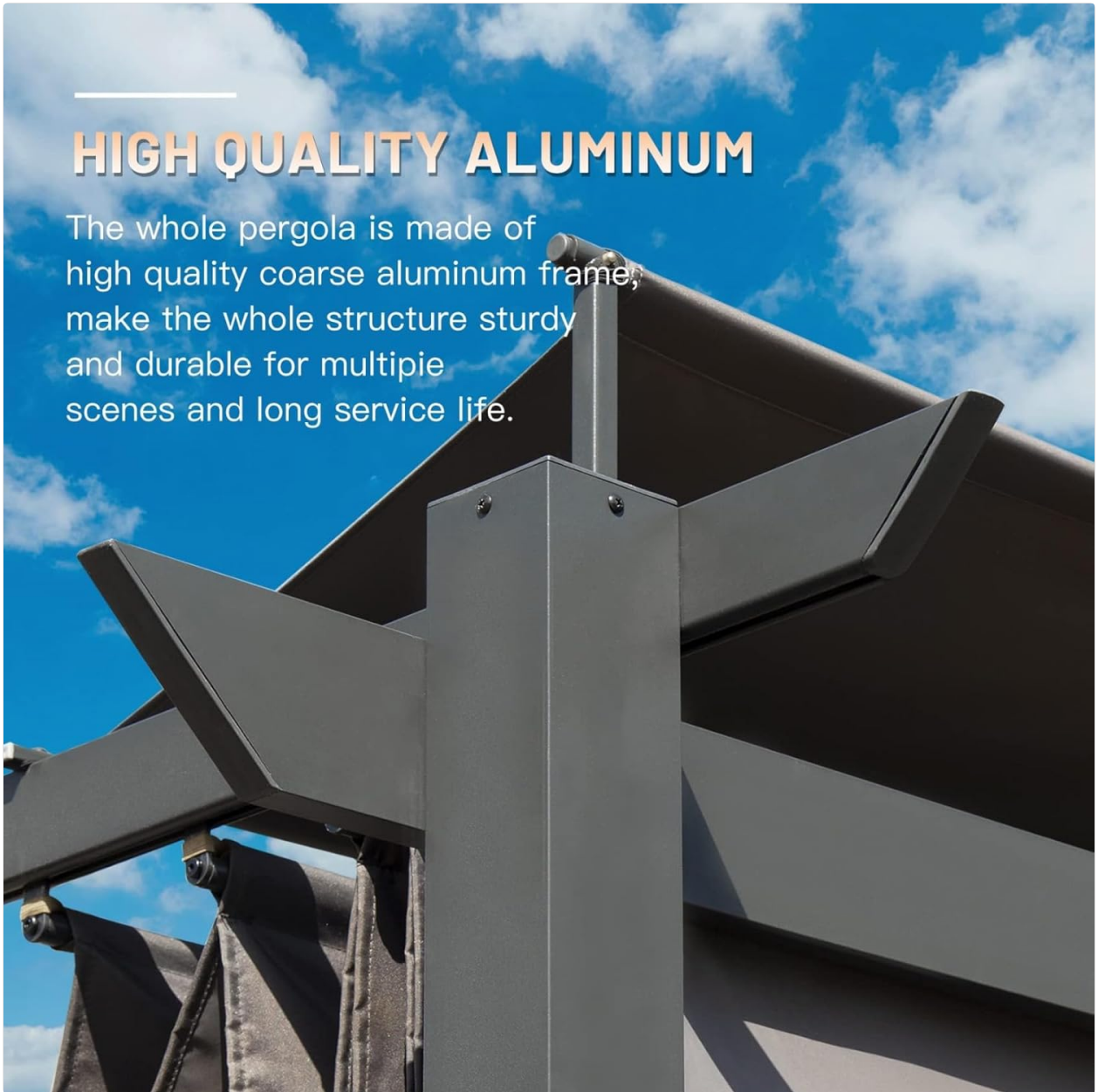
Image: High Quality Aluminum. This image highlights the robust construction of the pergola's frame, made from high-quality coarse aluminum, ensuring a sturdy and durable structure for extended service life.

The whole pergola is made of high quality coarse aluminum frame, make the whole structure sturdy and durable for multiple scenes and long service life.