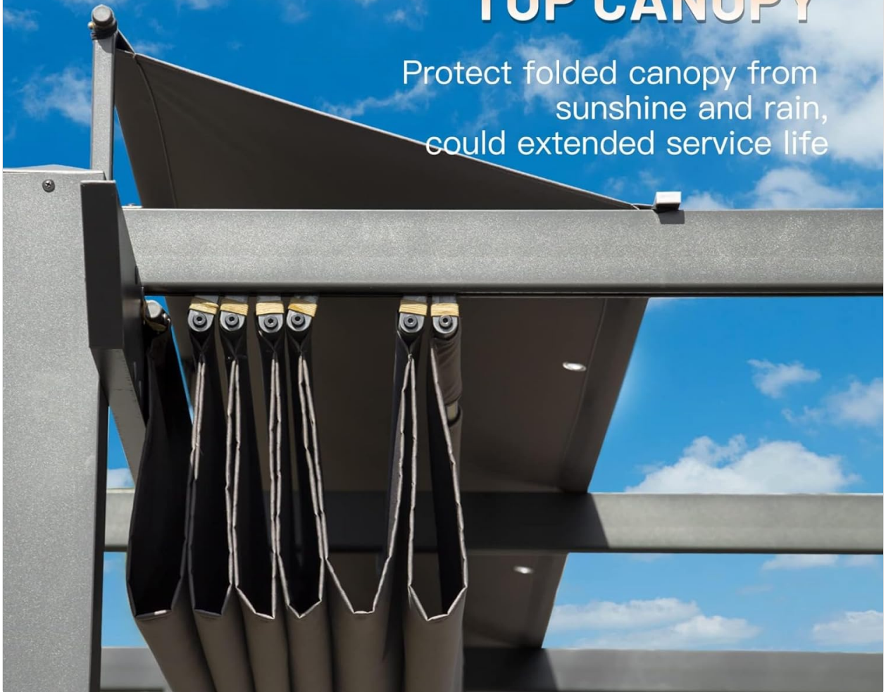
Image: Extra Protective Top Canopy. A detailed view of the additional small canopy positioned above the main retractable canopy. This feature is designed to protect the folded canopy from direct exposure to sun and rain, thereby extending its lifespan.

Protect folded canopy from sunshine and rain, could extended service life