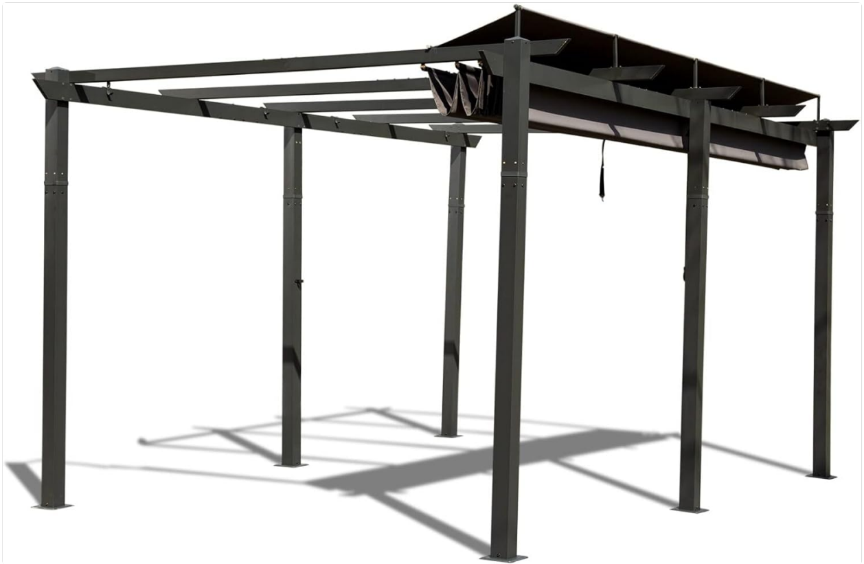
Image: Pergola with Retracted Canopy. A full view of the pergola structure with its canopy fully retracted, showcasing the open design and the protective top canopy that shields the folded fabric.