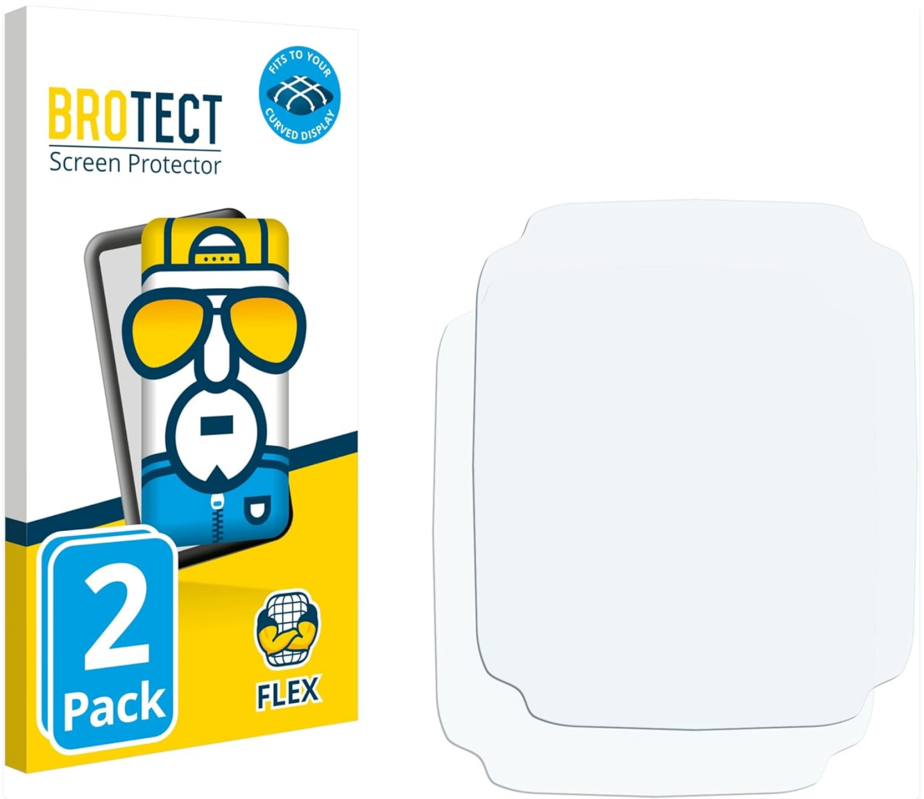
Image: Packaging of the BROTECT Flex Full-Cover Screen Protector showing two protectors included.

The BROTECT Flex Full-Cover screen protector is designed to provide comprehensive protection for your curved screen device, specifically compatible with the Maoo Amplify 2 1.85". This innovative material offers a perfect fit, safeguarding your device against dust and scratches while preserving the original touch experience.