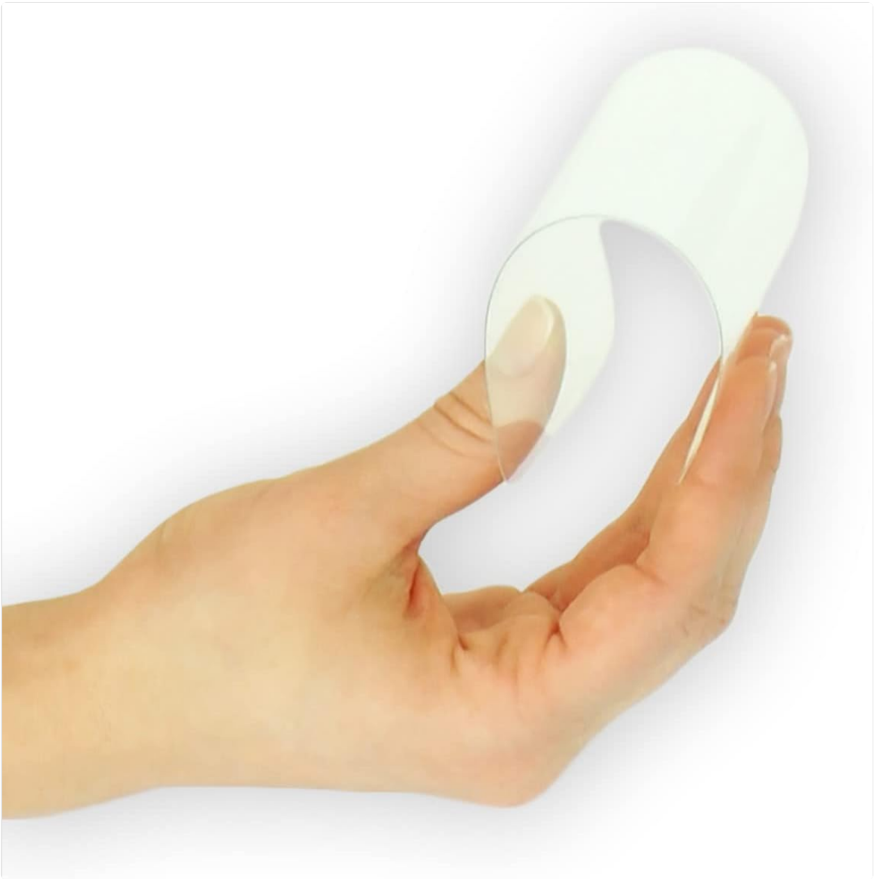
Image: A hand demonstrating the flexibility of the upscreen Hybrid Glass Clear Premium Screen Protector.