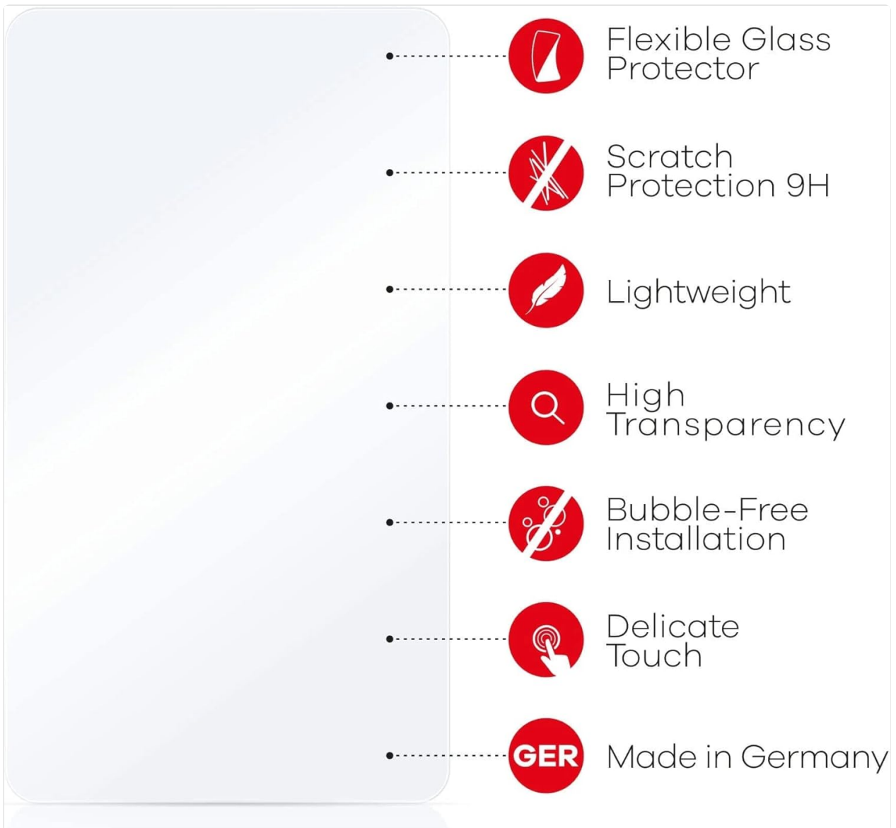
Image: Key features of the upscreens Hybrid Glass Clear Premium Screen Protector, including flexibility, 9H scratch protection, lightweight design, high transparency, bubble-free installation, delicate touch, and German manufacturing.