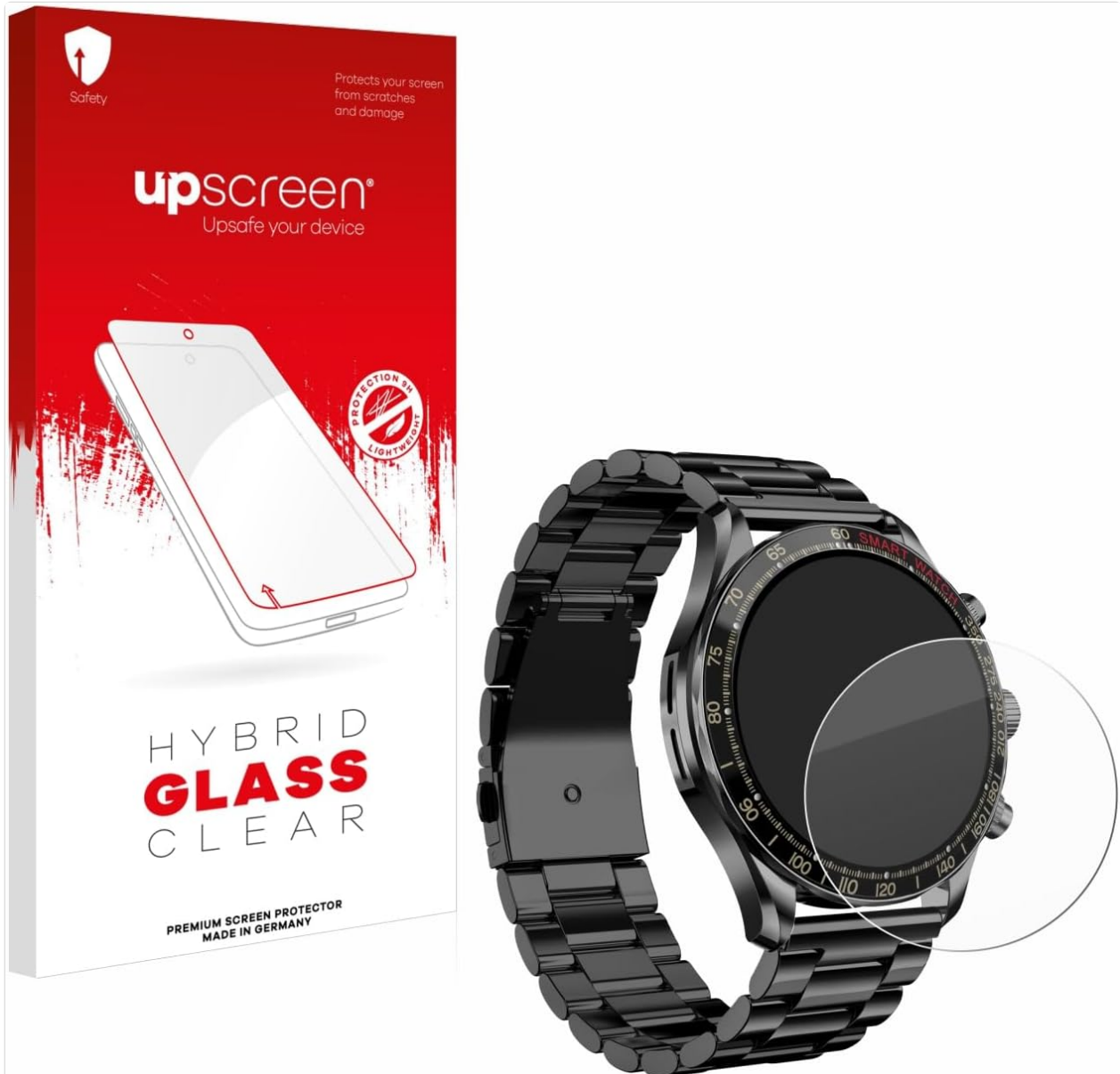
Image: The upscreens Hybrid Glass Clear Premium Screen Protector packaging alongside a Maoo Titan Smartwatch with the screen protector applied, illustrating the product and its intended use.