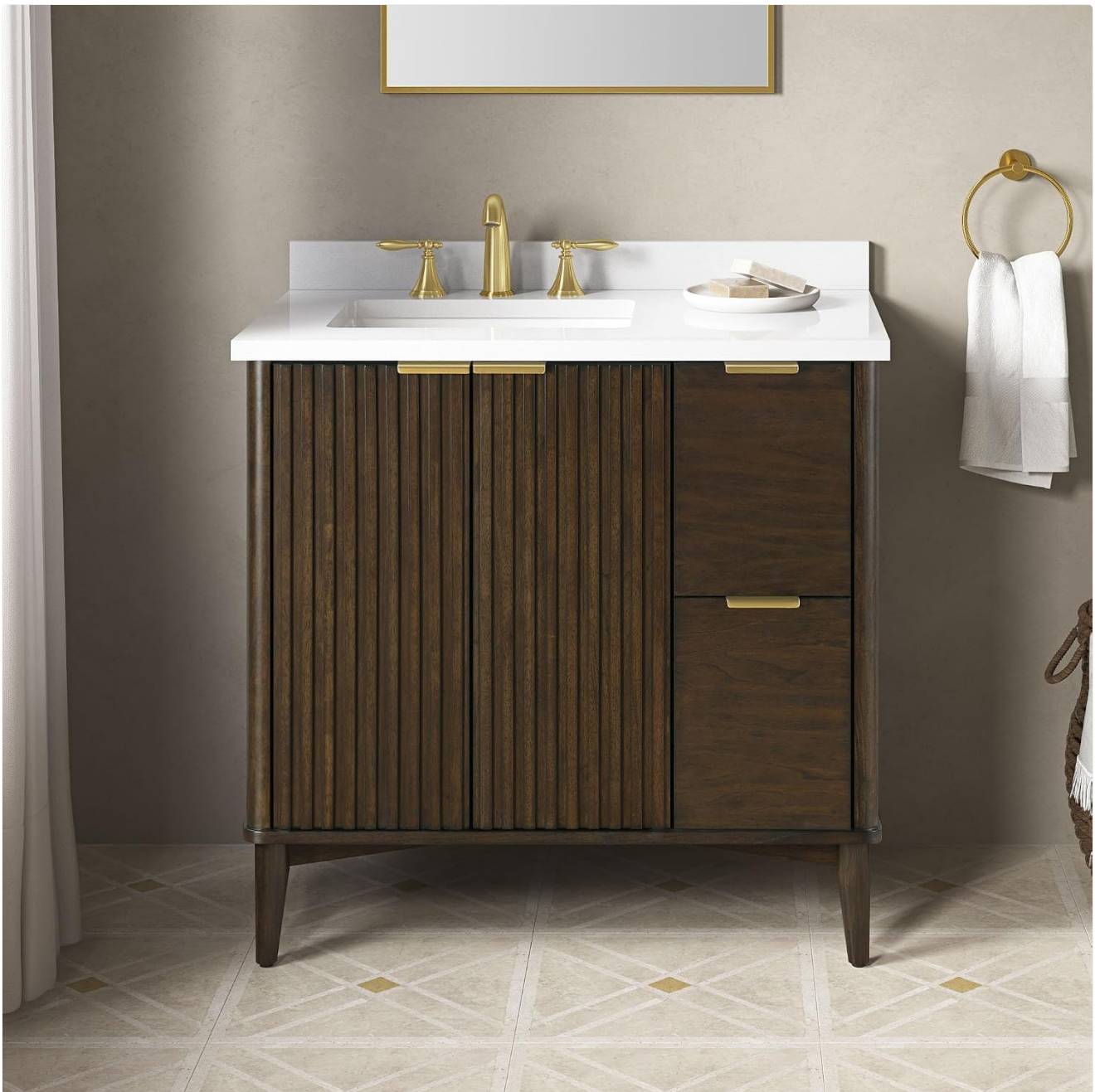
Figure 1: Front view of the OVE Decors Indy 36-inch Bathroom Vanity in Dark Walnut.