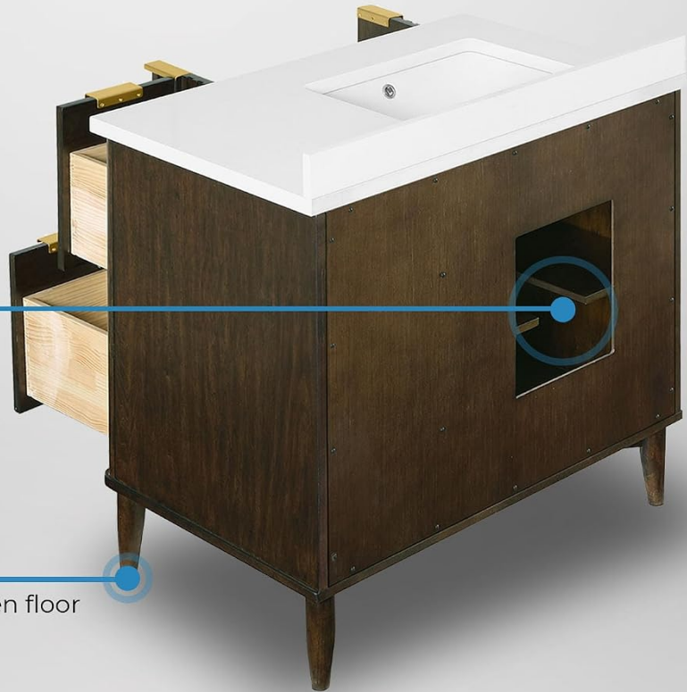
Figure 2: Vanity features an oversized back opening for plumbing access and leveling feet for stability.