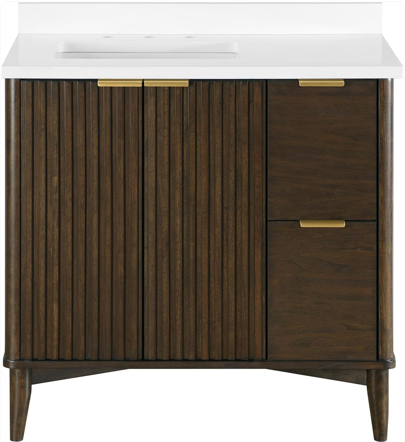
Figure 11: Front view of the vanity, showcasing its design and dimensions.