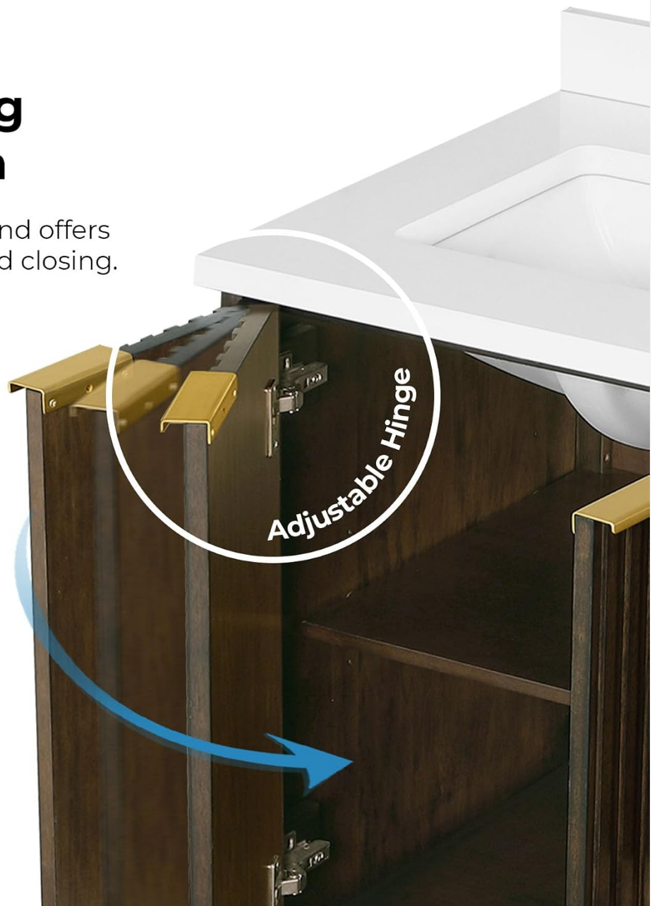
Figure 6: Illustration of the soft-closing mechanism on the vanity doors, preventing slamming.

Prevents slamming and offers effortless opening and closing.