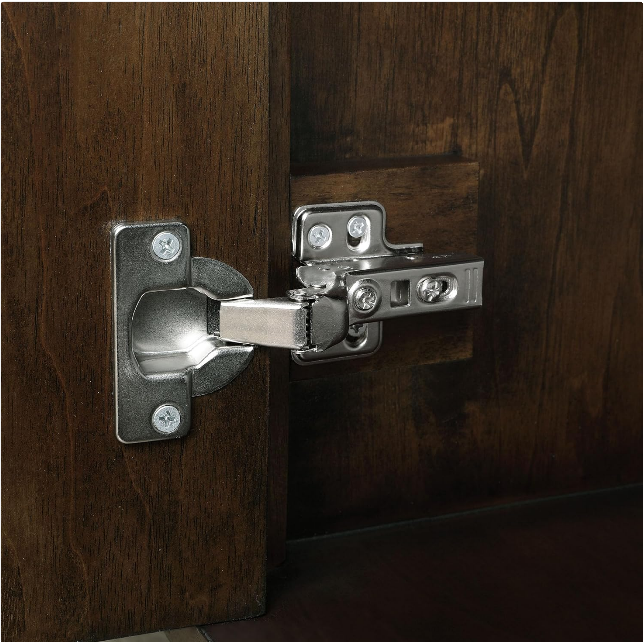
Figure 10: Adjustable hinges allow for fine-tuning door alignment and soft-close function.