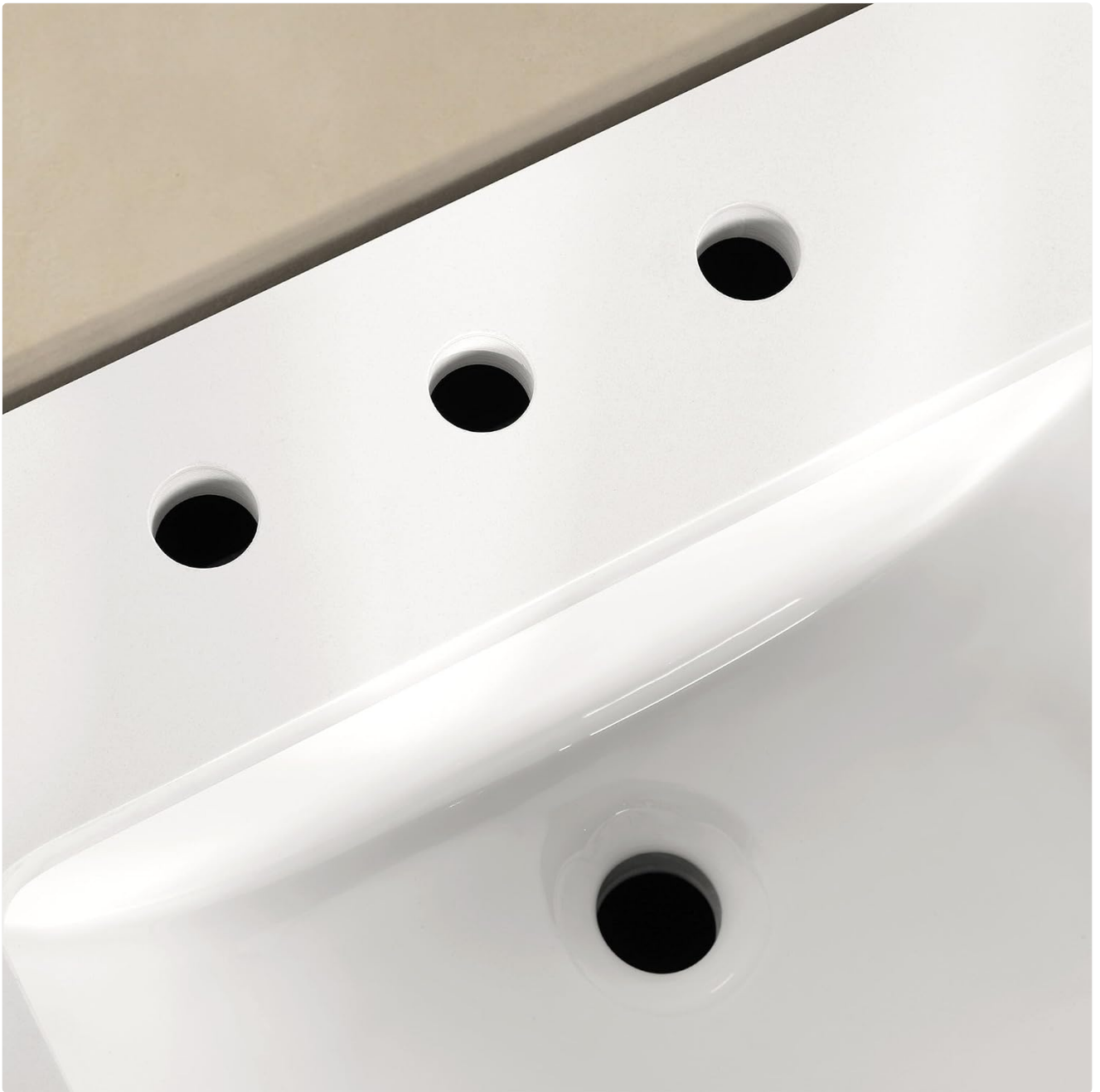
Figure 4: View of the sink basin and pre-drilled holes for faucet installation.