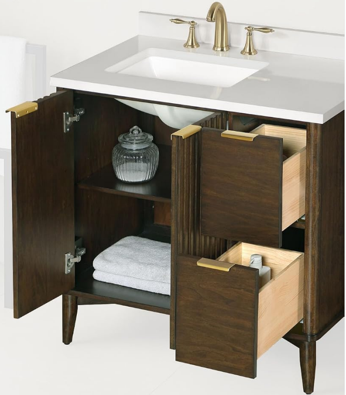
Figure 7: The vanity offers a complete storage solution with a 2-door cabinet, adjustable shelf, and two double-deep drawers.