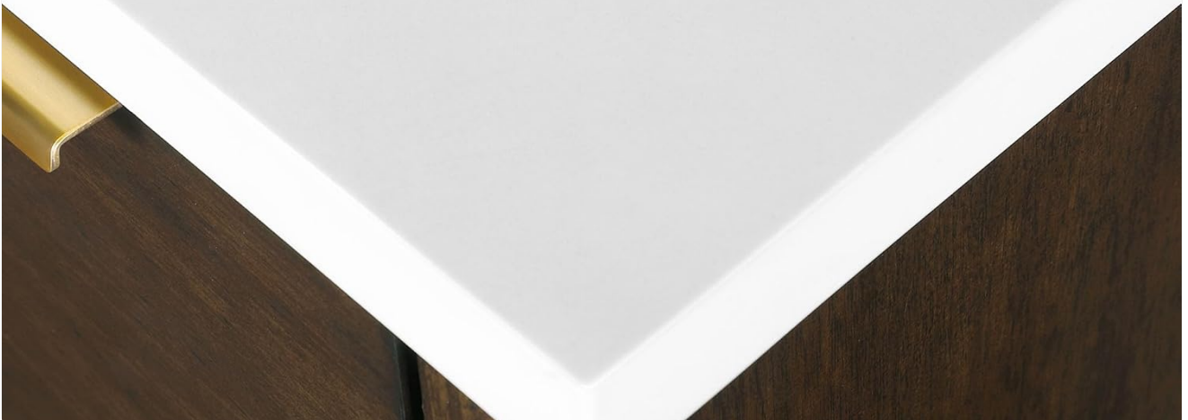
Figure 8: The engineered marble countertop is low-maintenance, durable, and hygienic.

Resistant to heat, scratches, and stains