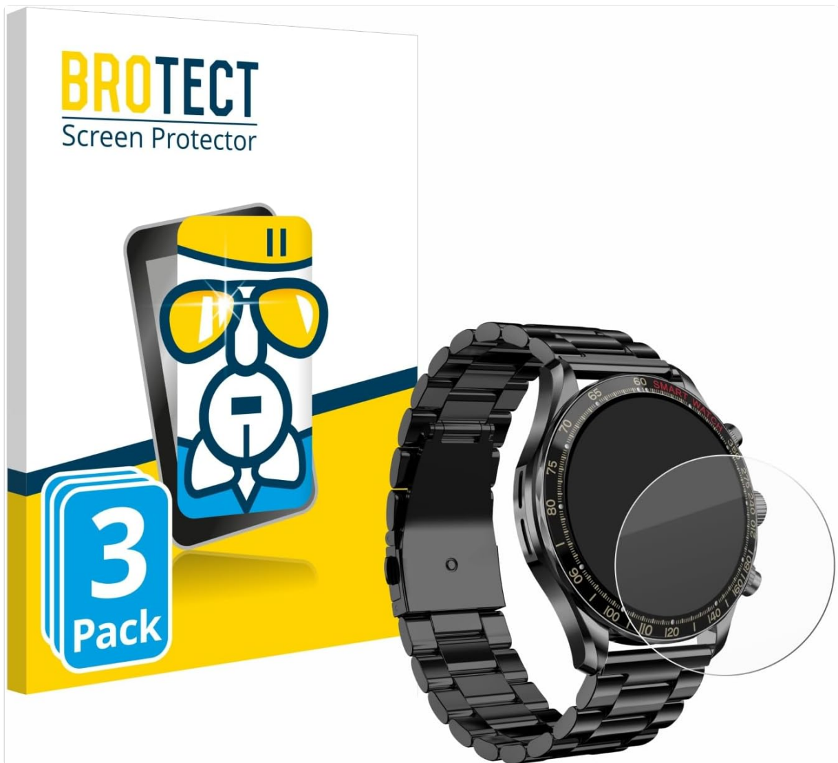
Image 1.1: brotect AirGlass Screen Protector packaging alongside a Maoo Titan Smartwatch, illustrating the product and its application.