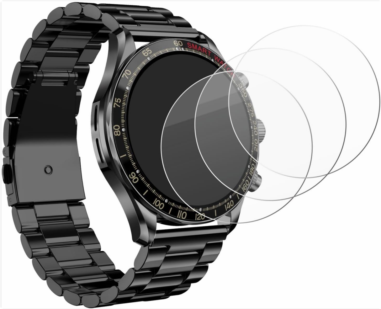
Image 3.2: The screen protector applied to the Maoo Titan Smartwatch.