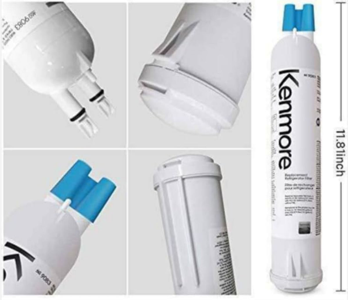
Image: Detailed views of the filter's top and bottom connections, emphasizing its leak-proof design and precise dimensions (11.8 inches in length) for a perfect fit.