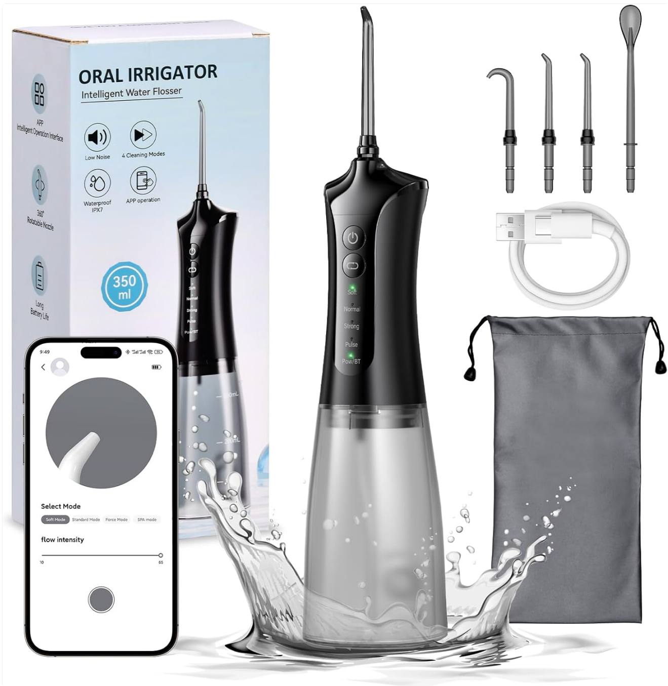
Figure 2.1: OGVD0E 1080P HD Visual Dental Water Flosser, showing the main unit, various nozzles, USB-C charging cable, and a storage pouch. A smartphone screen displaying the app interface is also visible.