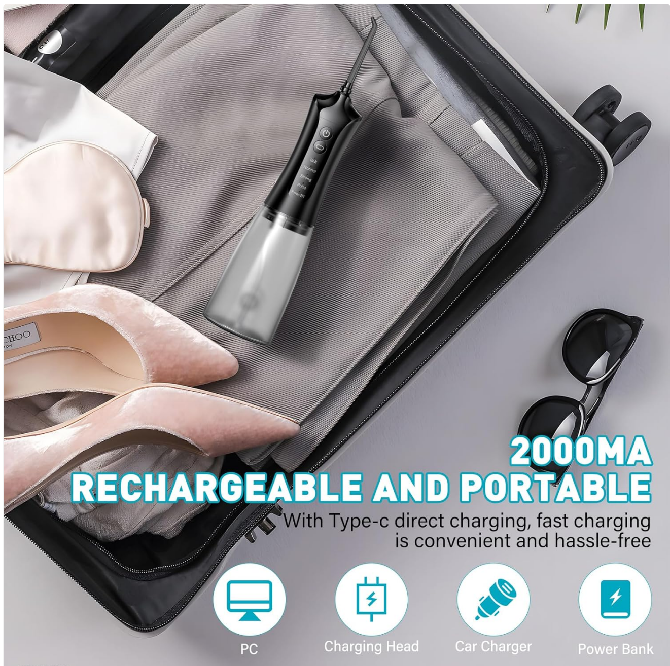
Figure 3.2: The water flosser packed in a suitcase, illustrating its portability. Icons below show various USB-C charging methods: PC, charging head, car charger, and power bank.