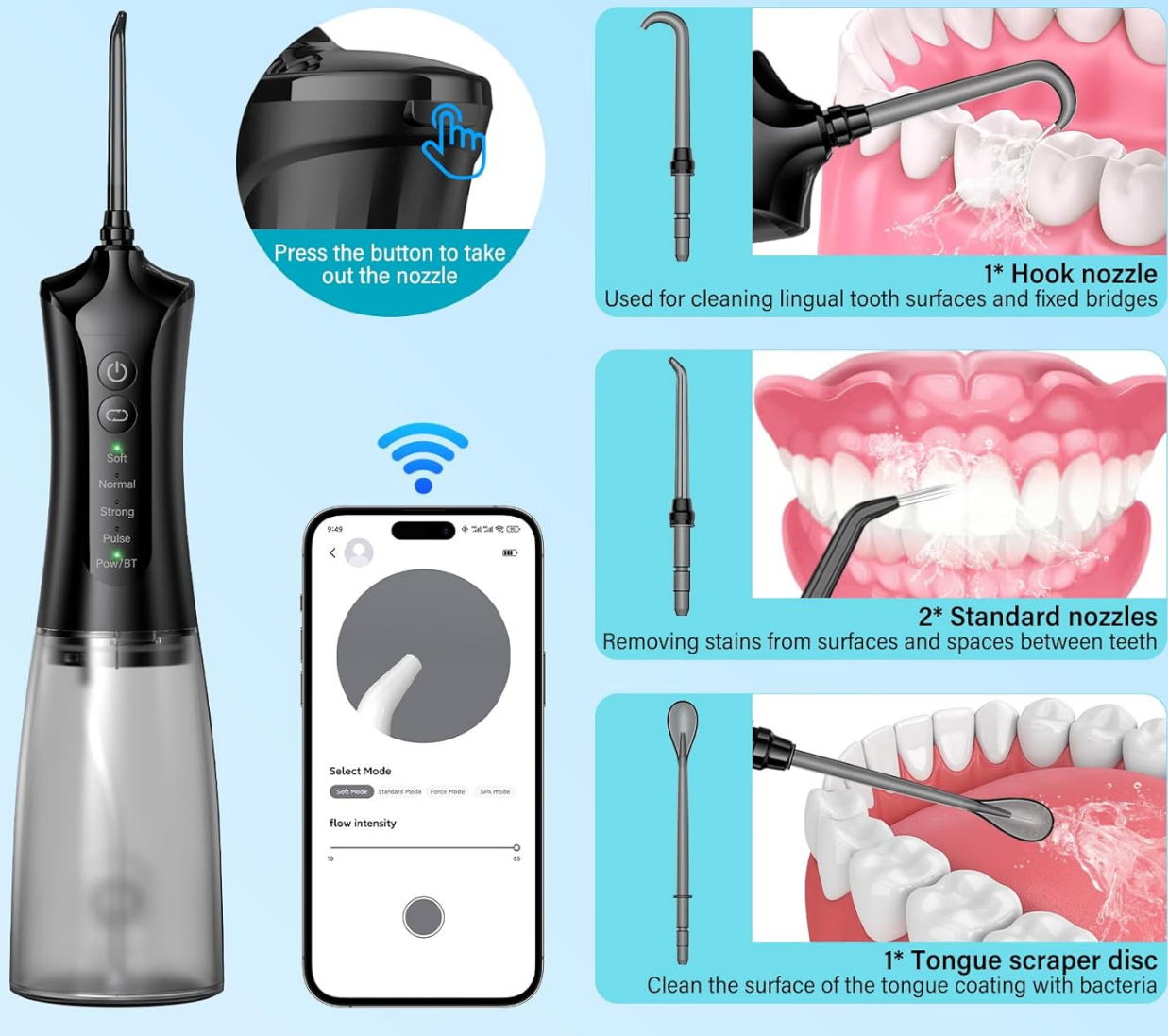
Figure 3.4: Illustrates the four professional nozzles: Hook nozzle for lingual tooth surfaces and fixed bridges, two Standard nozzles for removing stains and cleaning between teeth, and a Tongue scraper disc for cleaning the tongue coating with bacteria. It also shows how to press a button to take out the nozzle.

360 rotatable nozzle, Multi angle oral cleaning to meet different cleaning needs