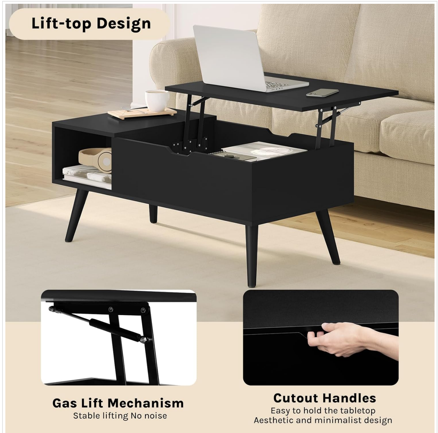
Image: Close-up of the WOLTU BTS26sz coffee table's lift-top mechanism, showing the gas lift for stable, quiet operation and the cutout handles for easy lifting.