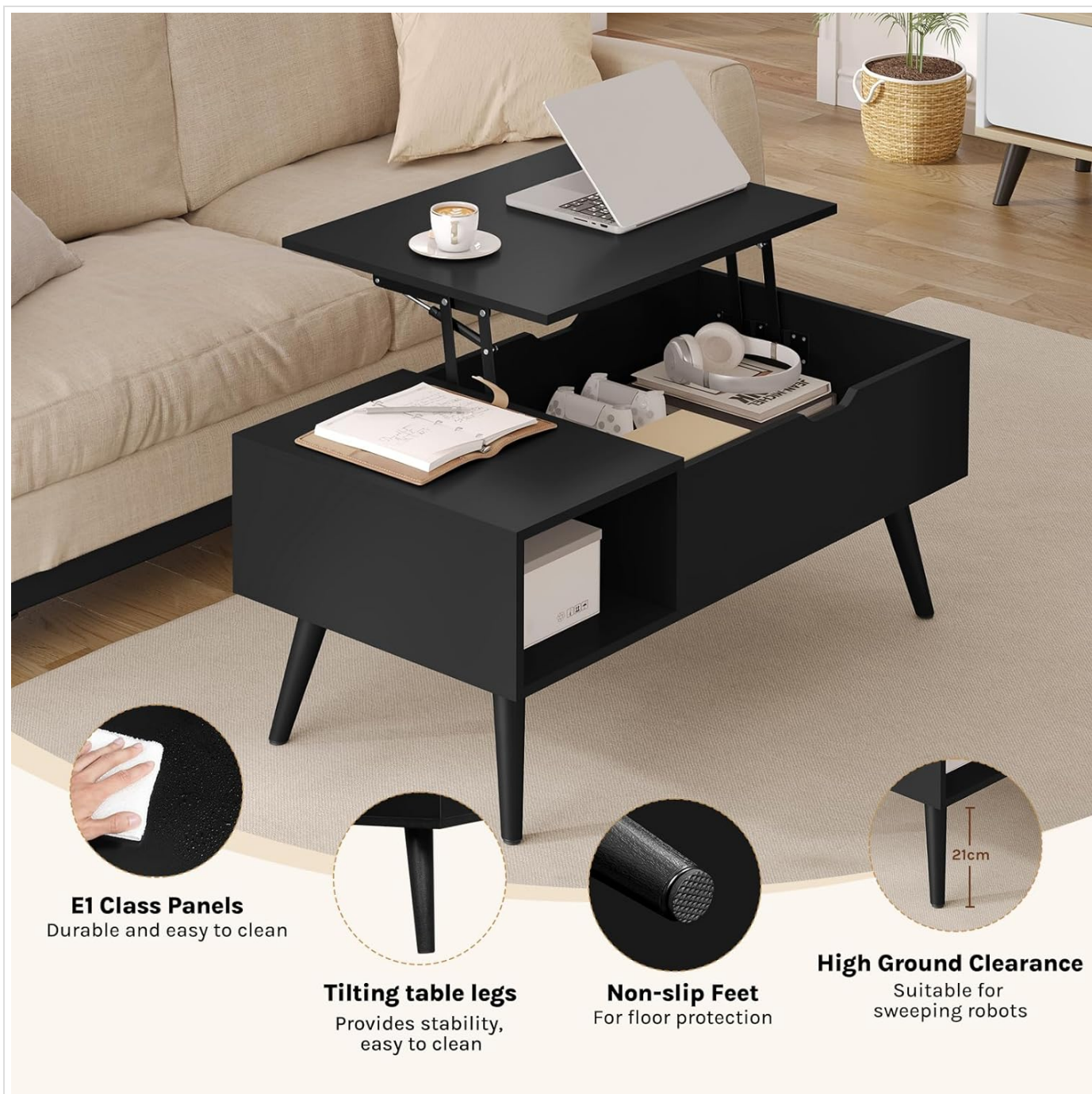
Image: Key features of the WOLTU BTS26sz coffee table, including E1 Class Panels, tilting table legs, non-slip feet, and high ground clearance.