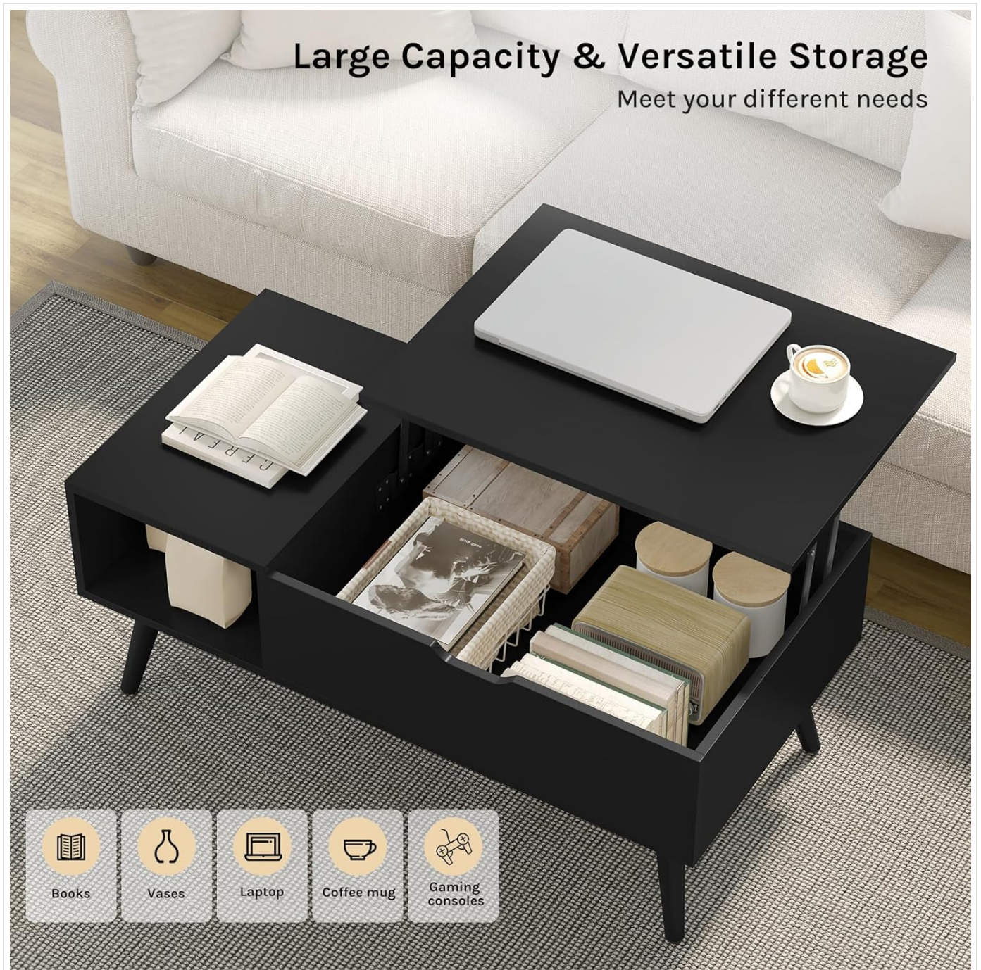
Image: WOLTU BTS26sz coffee table with its lift-top open, showcasing the large internal storage compartment filled with books, a laptop, and other items.