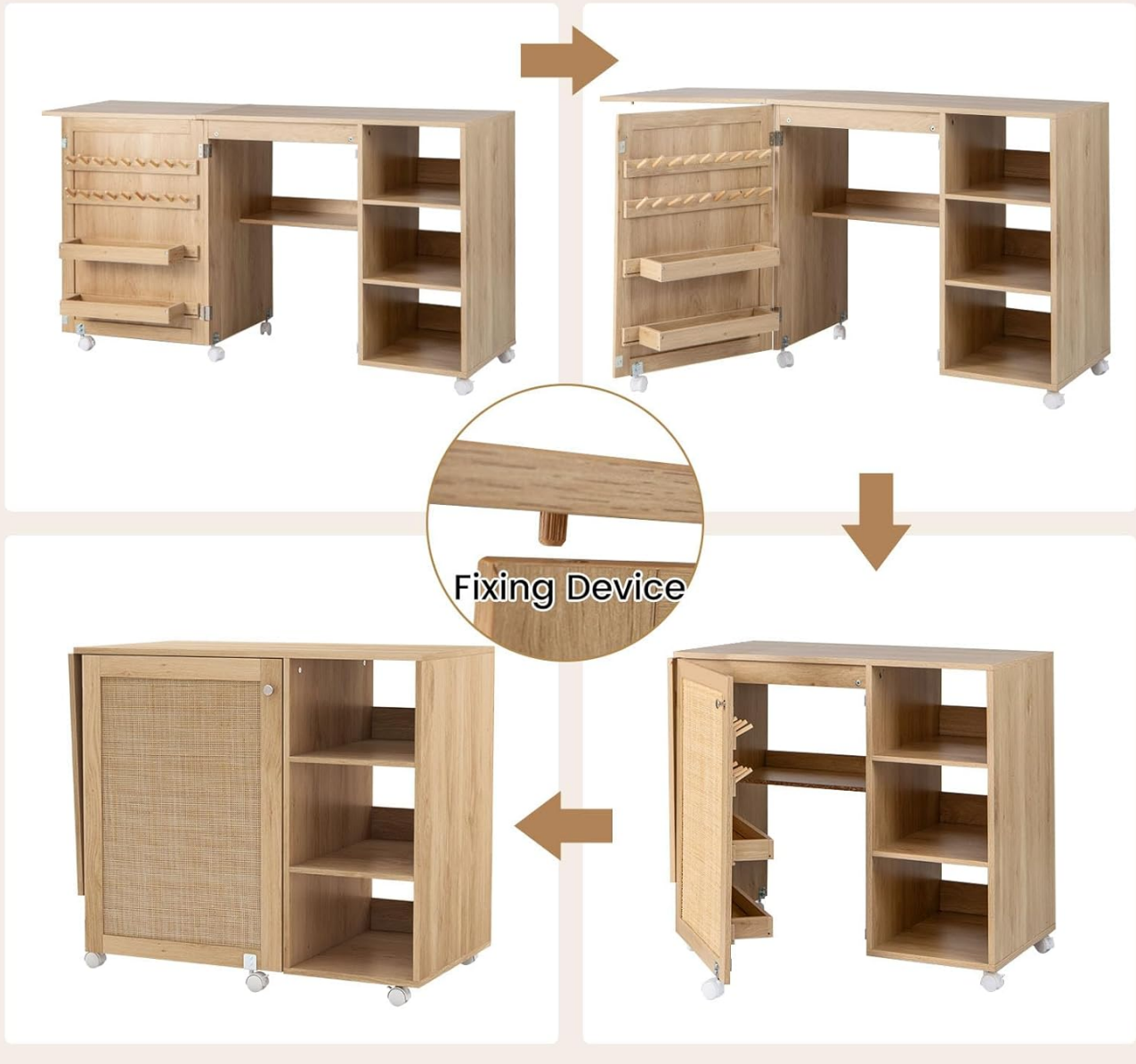
Image 2.1: A visual guide illustrating the transformation of the sewing table from its extended, open state to a compact, folded cabinet. The image highlights the folding mechanism and the internal fixing device that secures the table when closed.