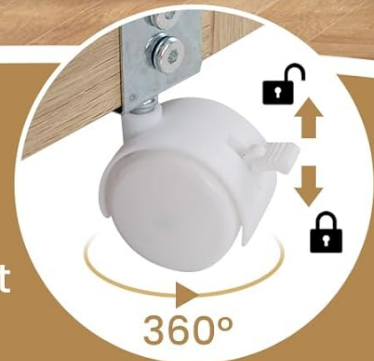
Image 3.2: A detailed view of one of the table's lockable caster wheels, illustrating its 360-degree rotation capability and the mechanism for locking and unlocking, ensuring both easy mobility and stable placement.

6 lockable wheels ensure easy movement and stability