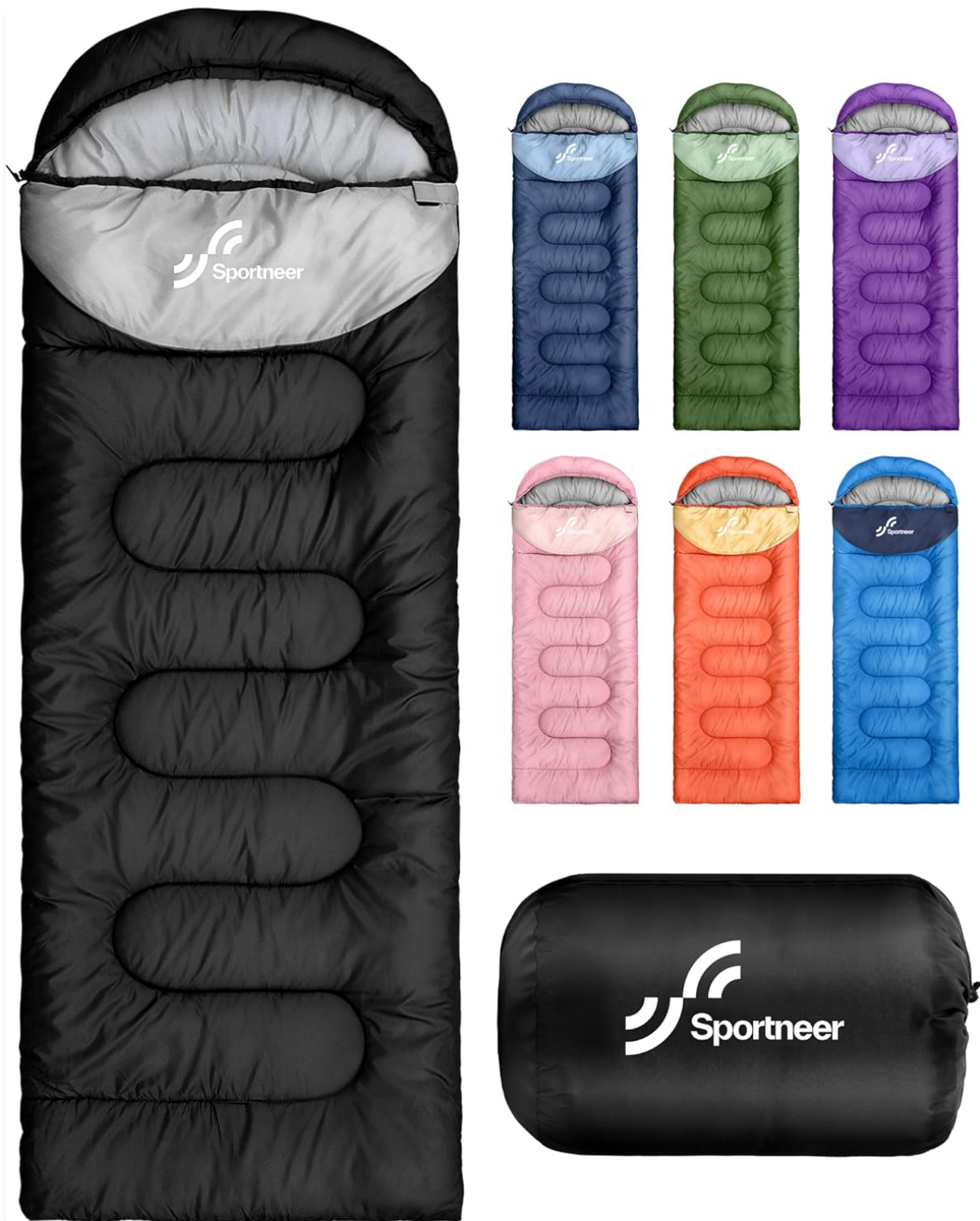
Image: The Sportneer 3-4 Season Sleeping Bag, showcasing its design and available color variations, along with its compact carry bag.