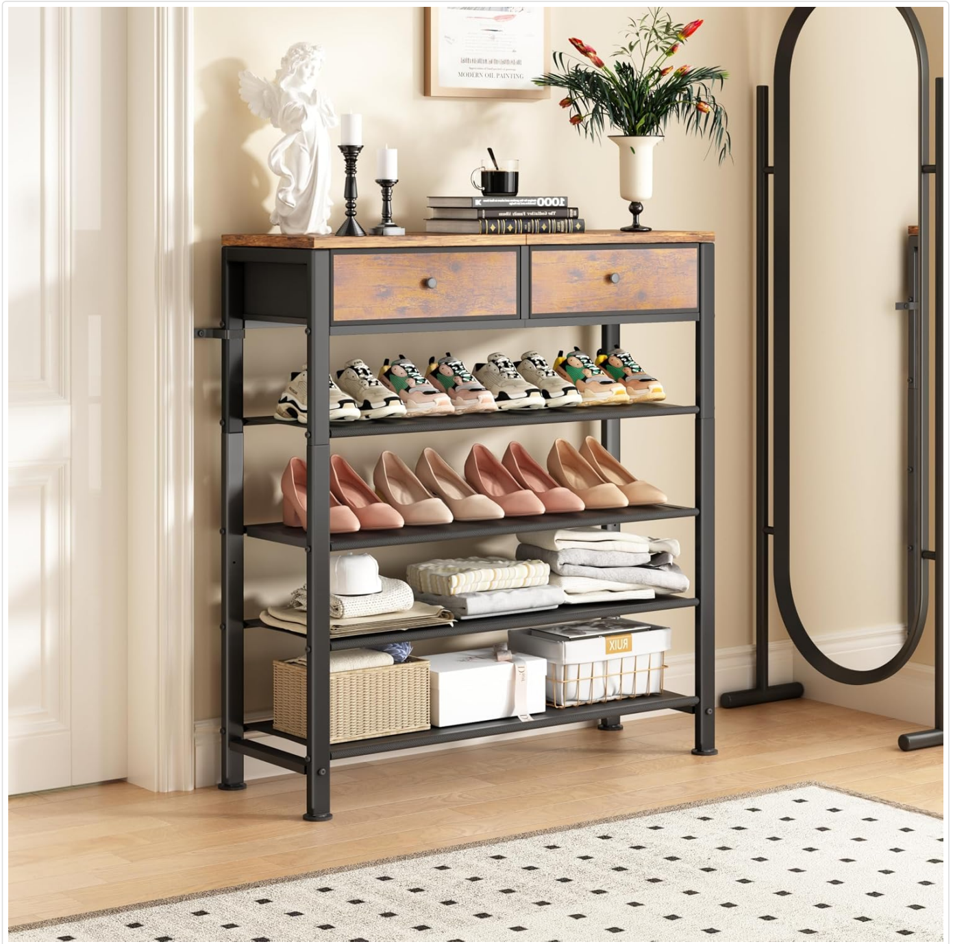
Image: All components of the Kitstorack 5-Tier Shoe Rack Organizer, including the metal frame, wooden top, fabric shelves, and drawers.