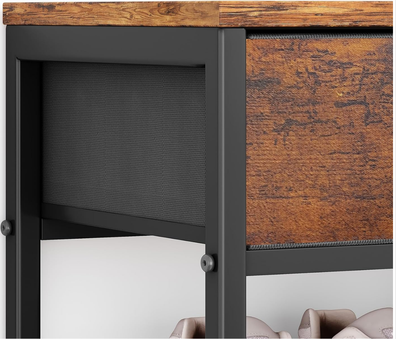
Image: Detailed view of the wooden top and the two fabric drawers, highlighting their integration into the rack structure.

Heavy-Duty Steel Frame with Premium Craftsmanship for Lasting Strength