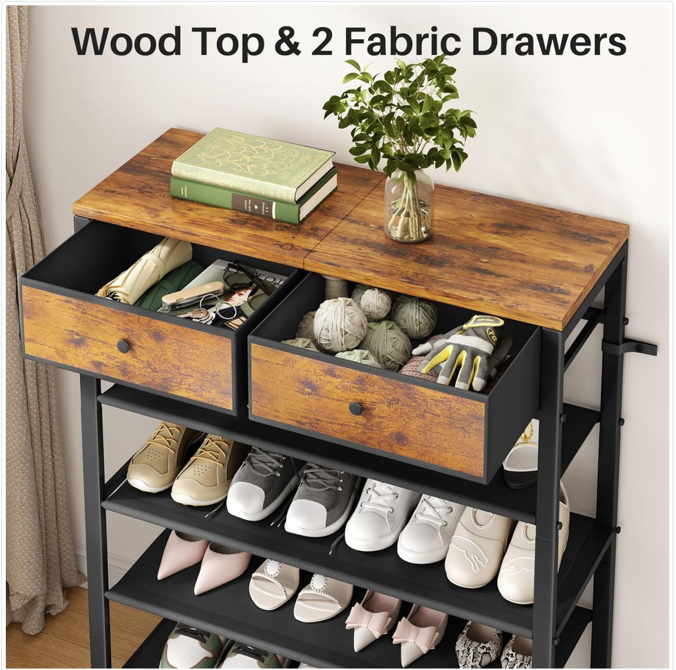
Image: The shoe rack positioned in an entryway, showcasing its capacity for shoes and the use of the top surface for decorative items and a handbag.