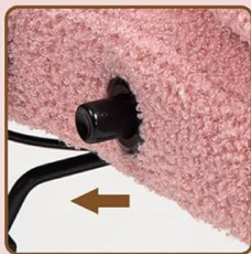
Image: The chair shown in a reclined position, illustrating its 130-degree reclining capability.