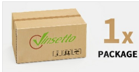
Image: A cardboard box indicating one package, representing the product's packaging.