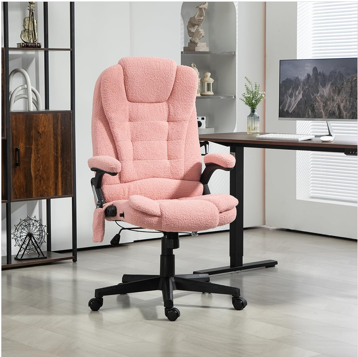
Image: The HOMCOM 6-Point Vibrating Massage Office Chair in pink, shown in an office setting.