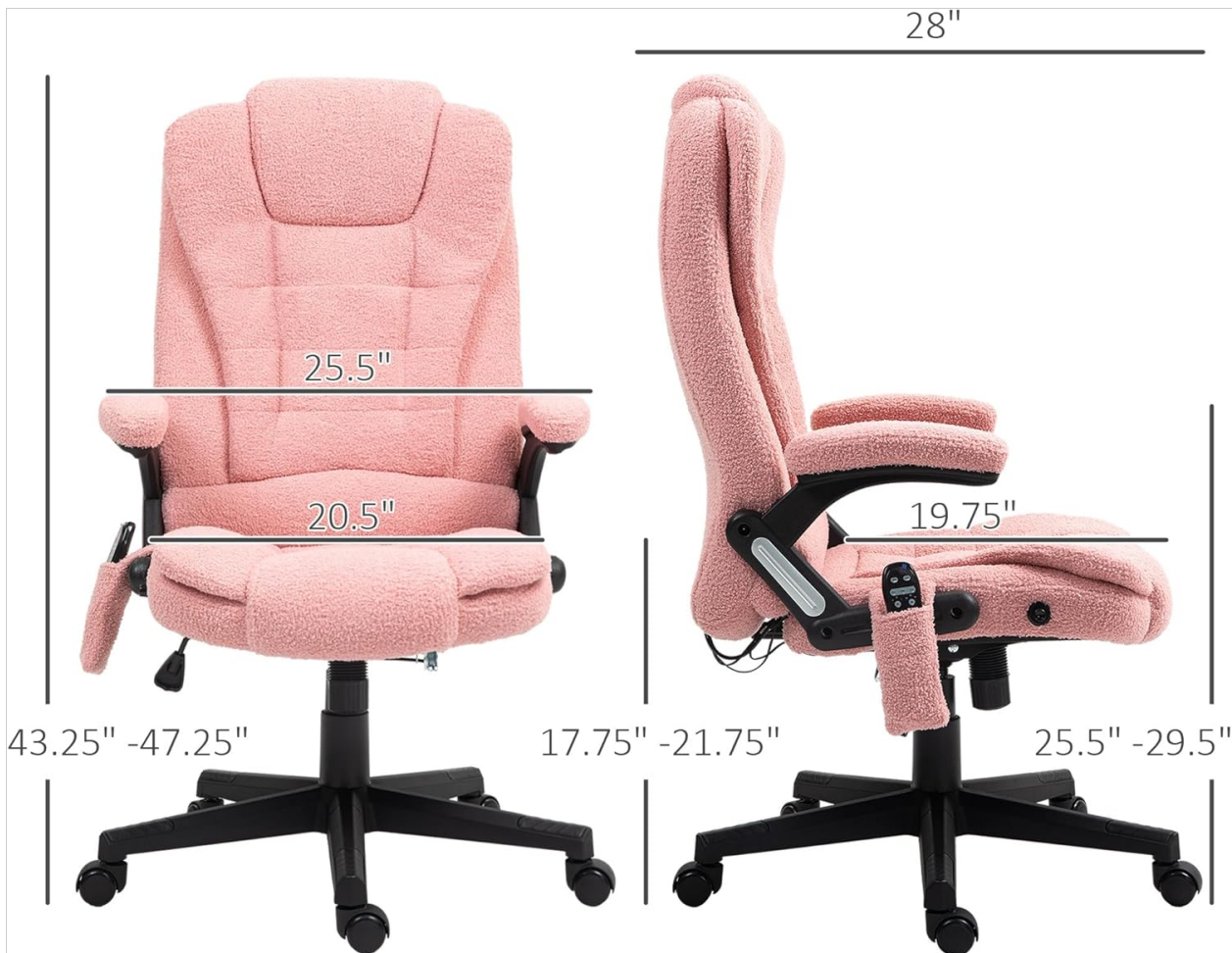
Image: A diagram illustrating the various dimensions of the office chair.

Key specifications for the HOMCOM 6-Point Vibrating Massage Office Chair: