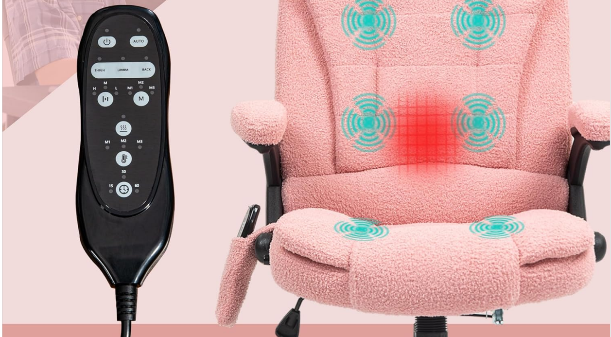
Image: The remote control for the massage and heat functions, with visual indicators of vibration points on the chair.