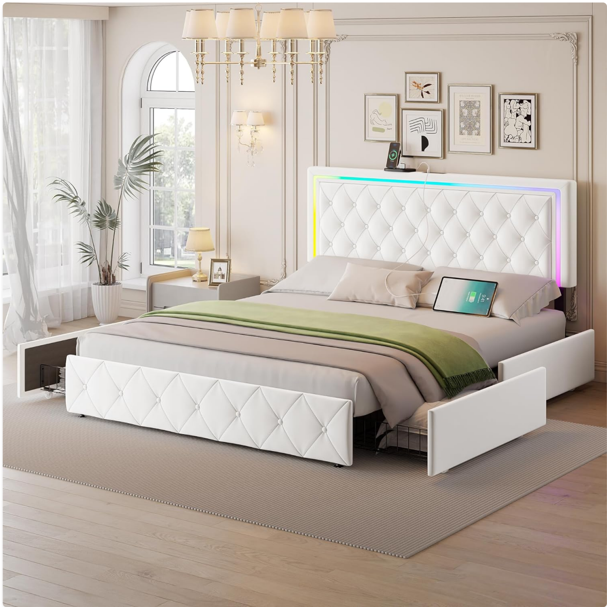
Image: The QFP LED Full Bed Frame in a bedroom setting, showcasing its design and features.