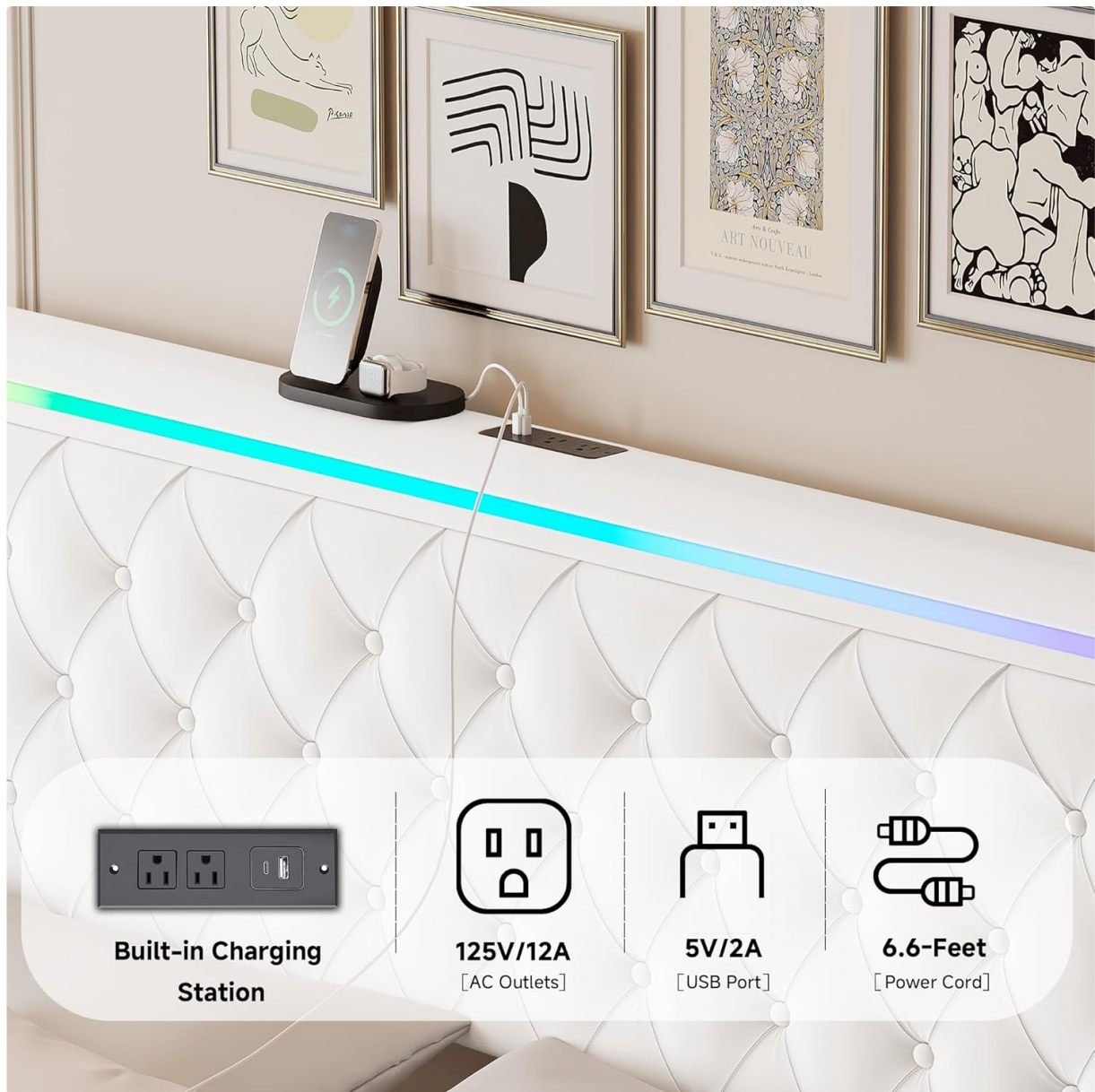
Image: Close-up of the headboard's built-in charging station with USB ports and AC outlets.