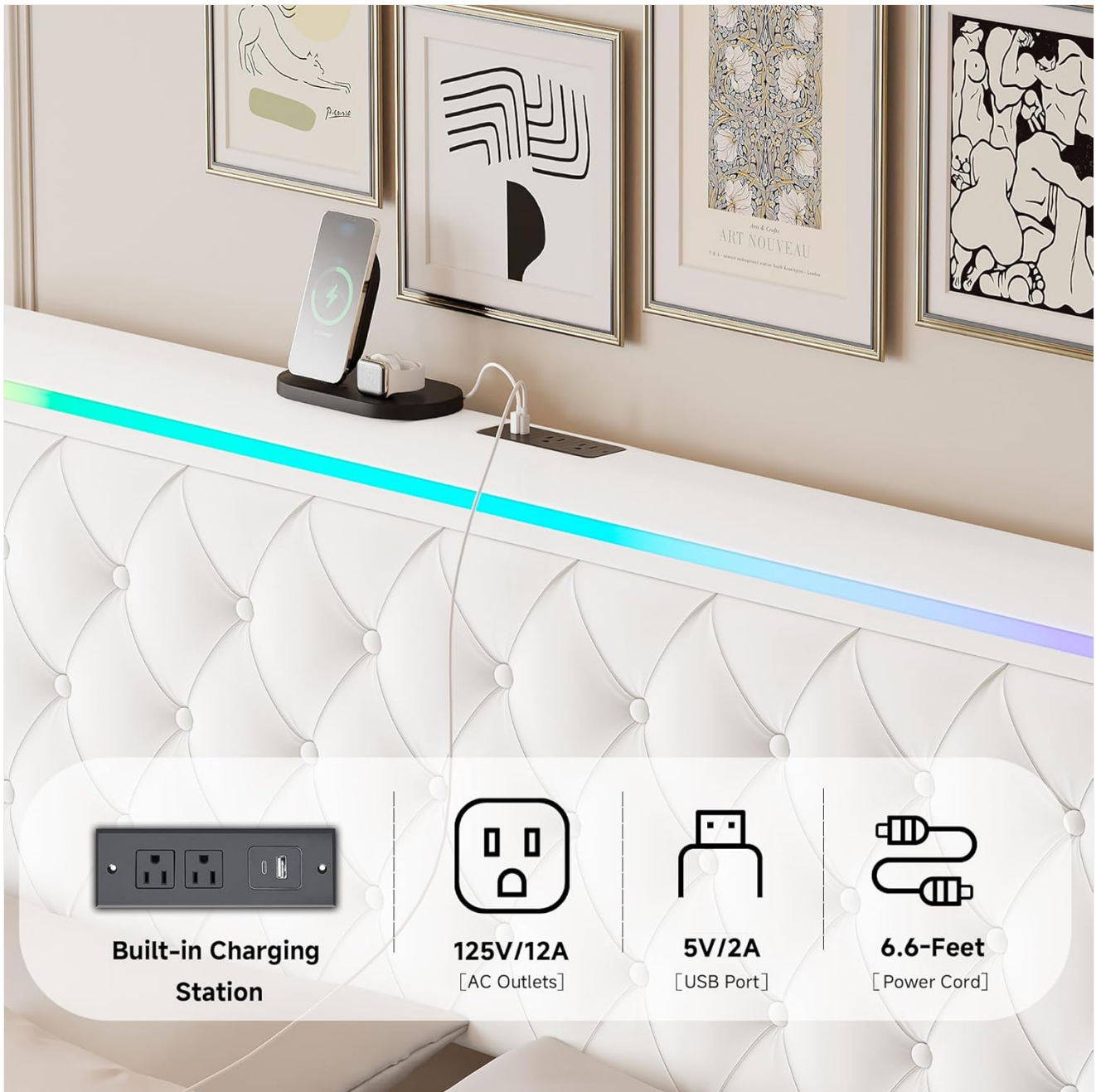
Image: Detailed view of the built-in charging station with USB ports and AC outlets.