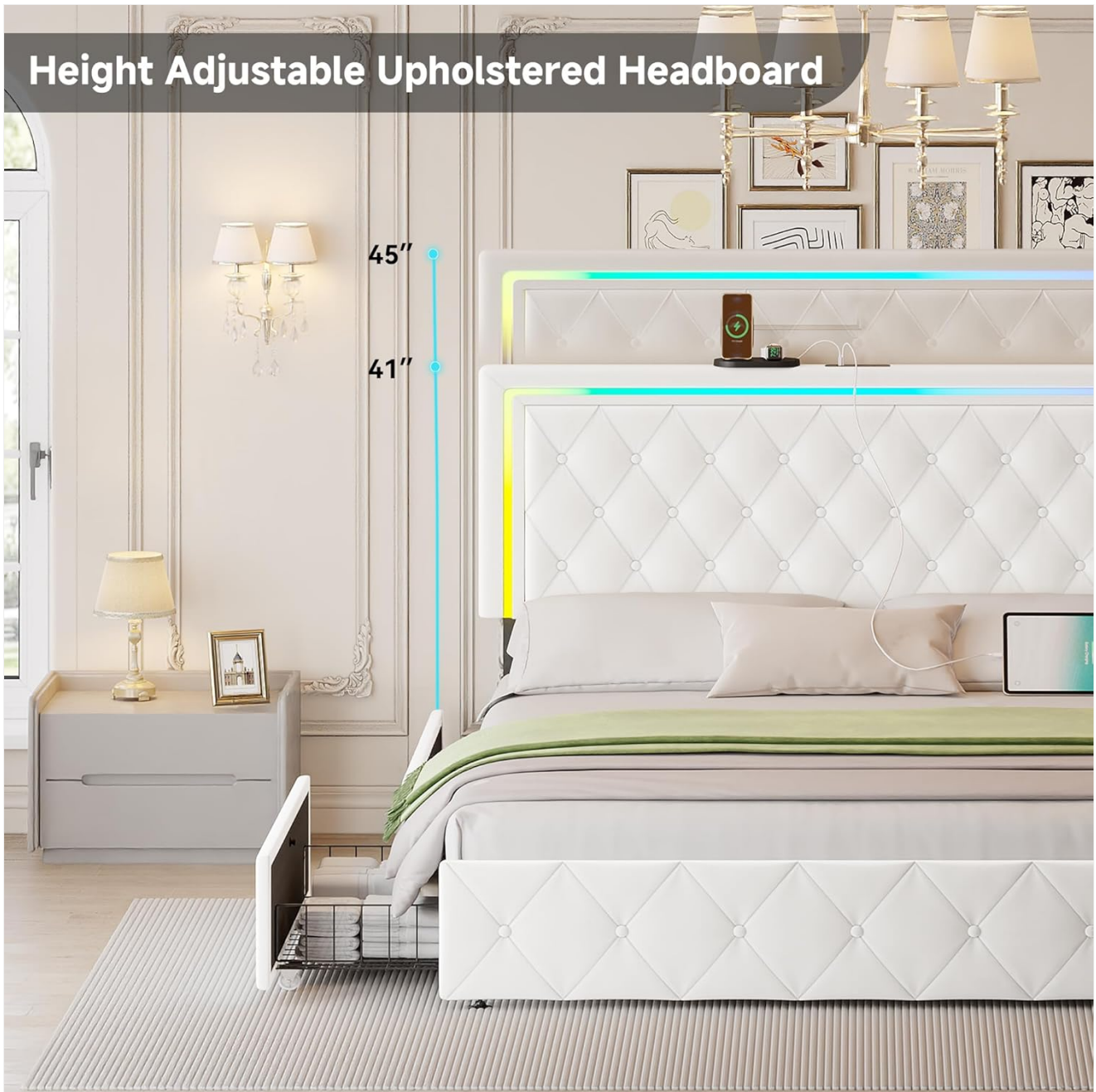
Image: Headboard height adjustment options.