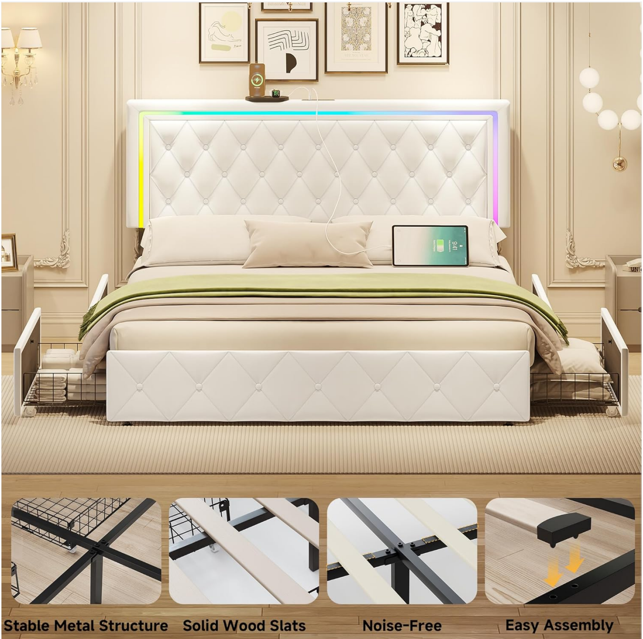
Image: Overview of the bed frame's structural components and assembly features.