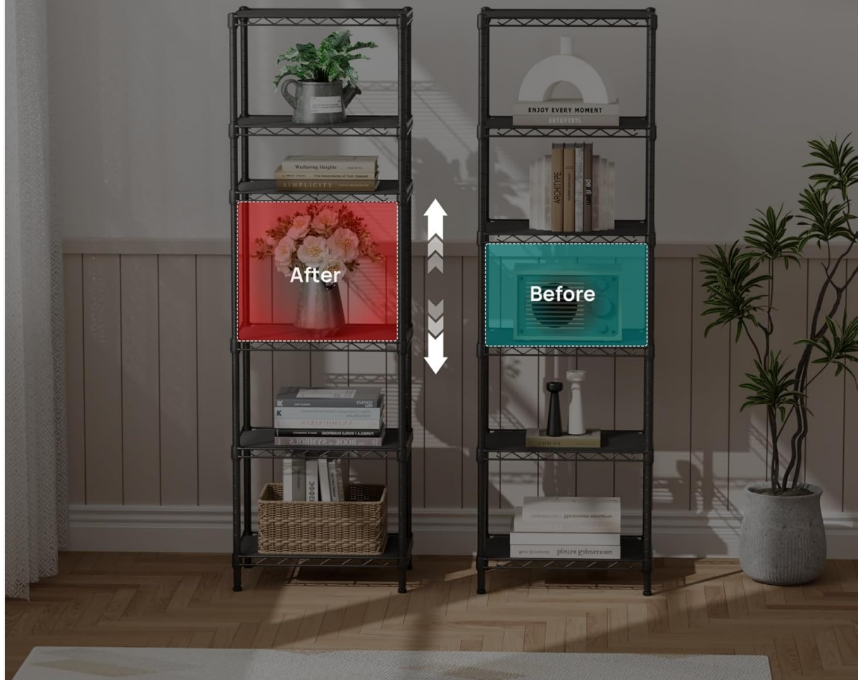
Figure 2: Adjustable height design demonstrating how shelves can be repositioned to fit various items.