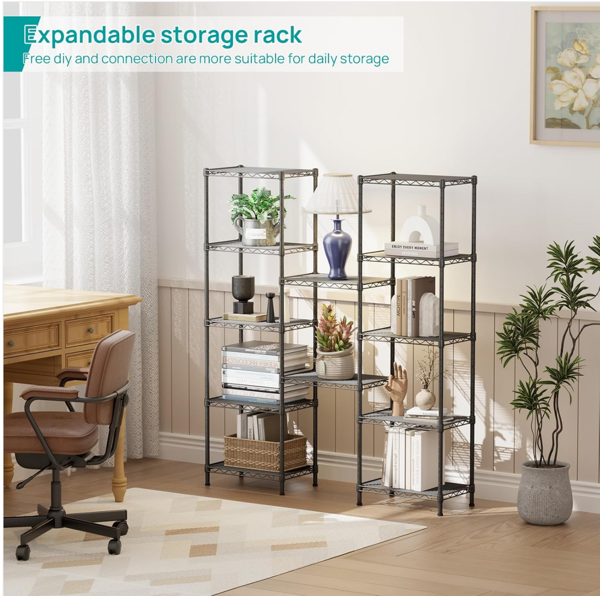
Figure 4: Two units combined, illustrating the expandable storage rack feature.