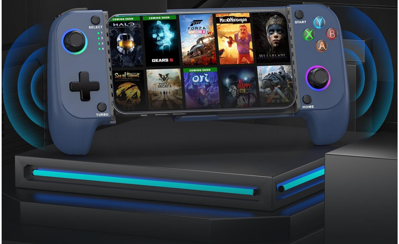
Image: The Mocagen controller with a smartphone securely inserted, demonstrating the adjustable design that provides sufficient space for phone cases and avoids obstructing the camera.