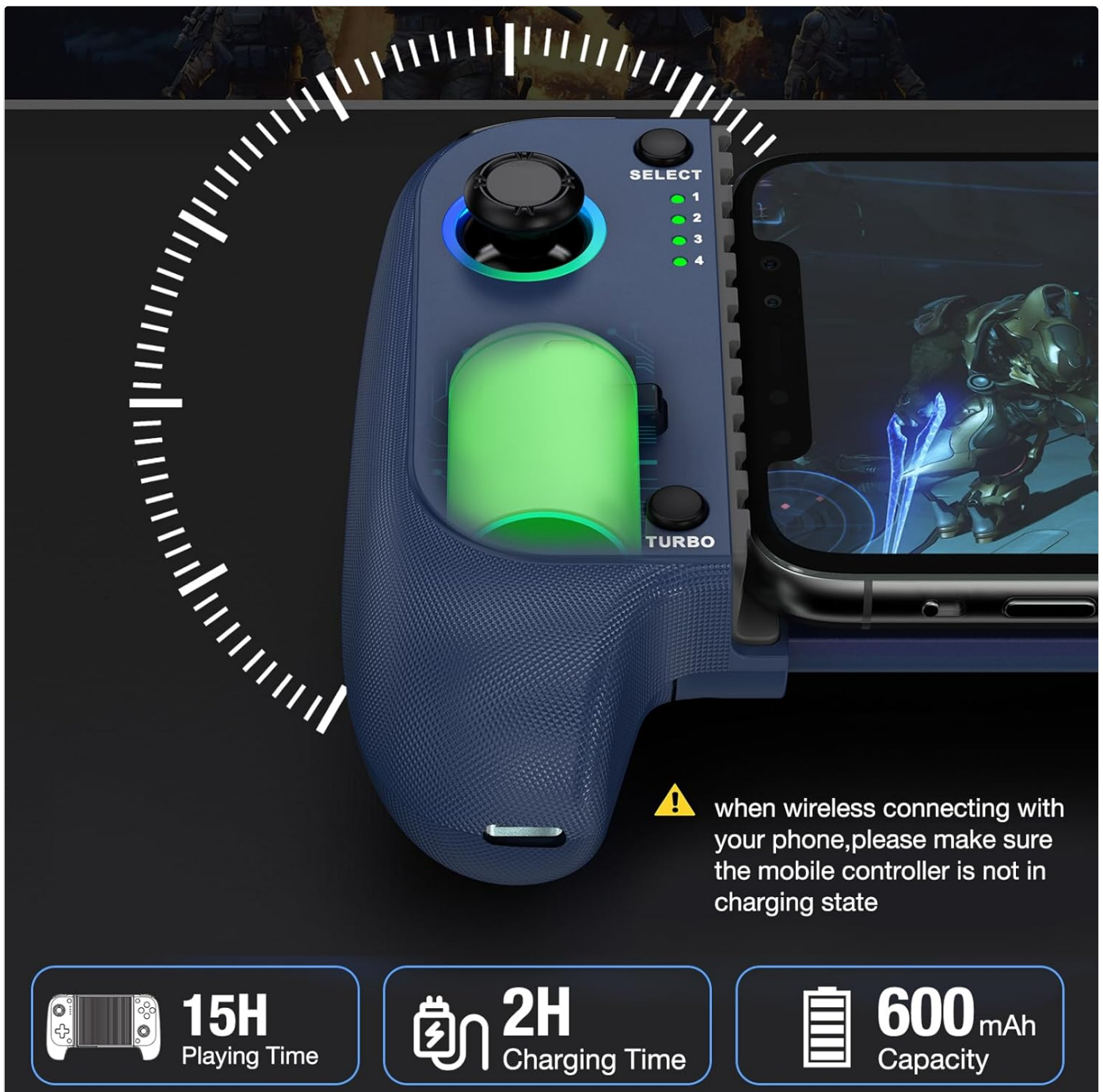
Image: The Mocagen controller displaying its battery indicator lights and the USB-C charging port, with text indicating 15 hours playing time and 2 hours charging time for its 600mAh capacity.