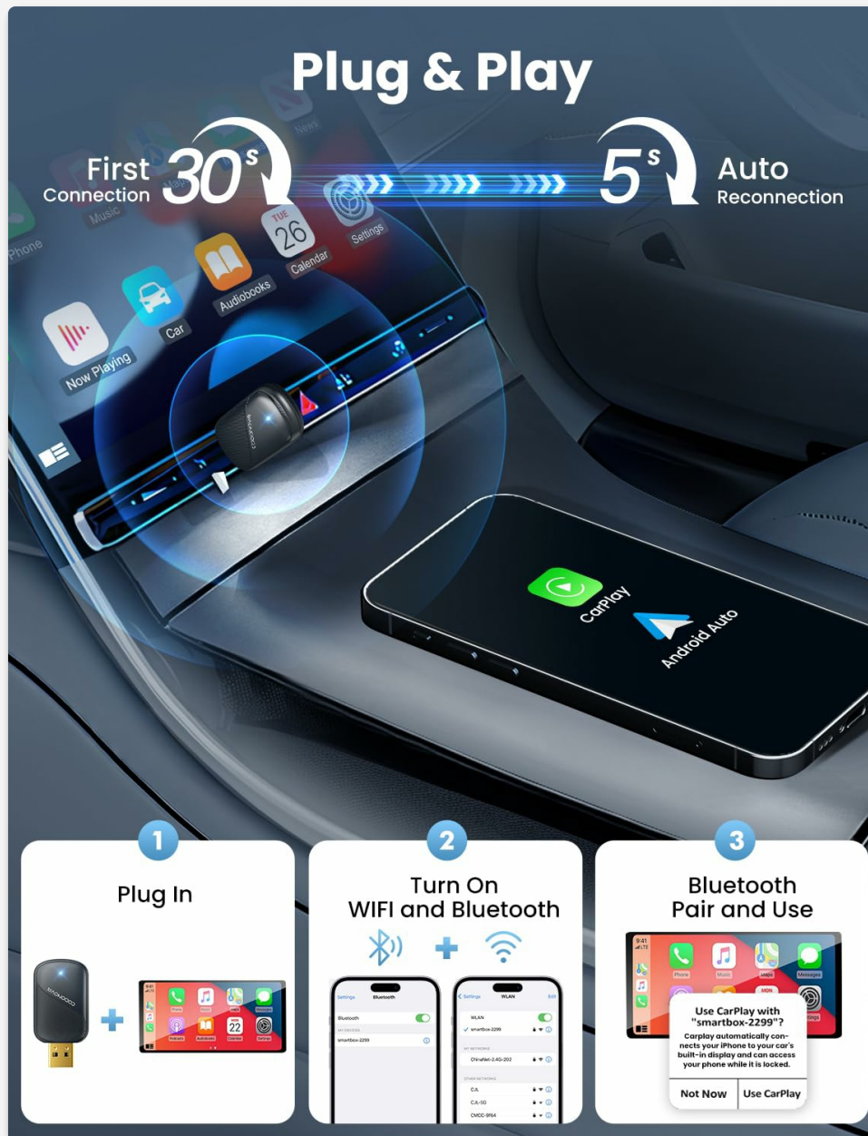
Image 4.1: Visual guide illustrating the three simple steps for plugging in, enabling Wi-Fi and Bluetooth, and pairing the device.

For subsequent uses, the adapter will automatically reconnect to your phone within approximately 5 seconds after plugging it in, provided your phone's Bluetooth and Wi-Fi are active.