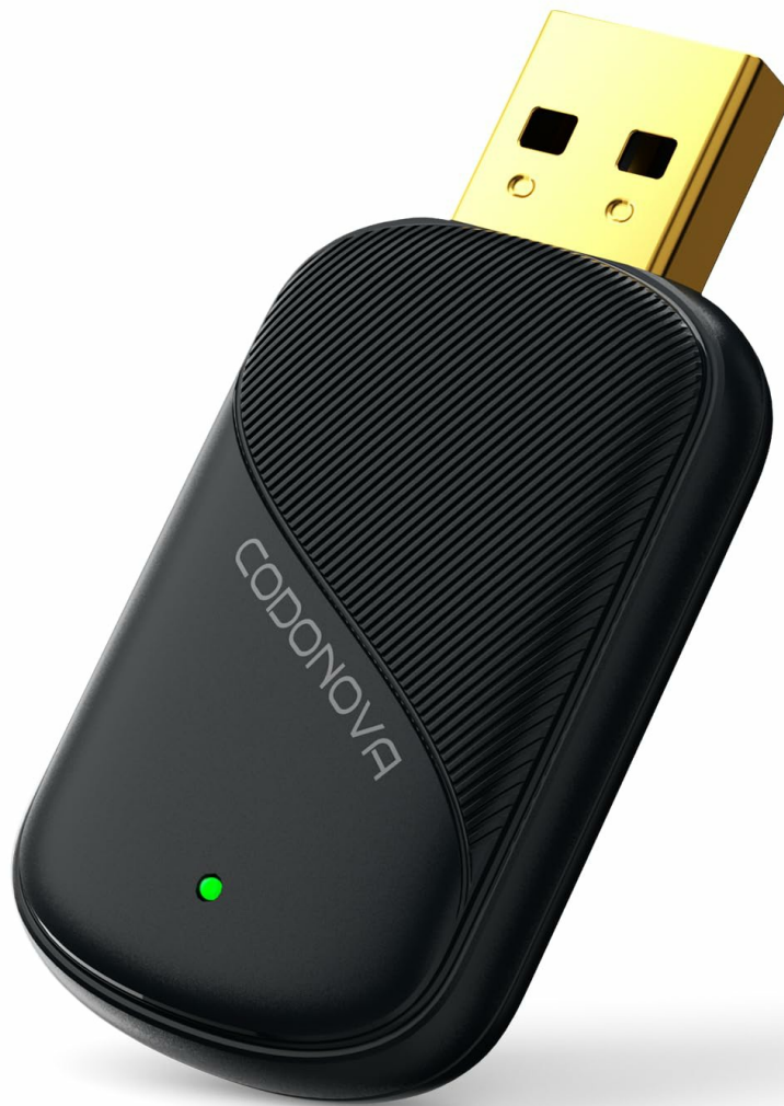
Image 1.1: The CODONOVA Mini Wireless Carplay Adapter, showcasing its compact design and gold-plated USB interface.