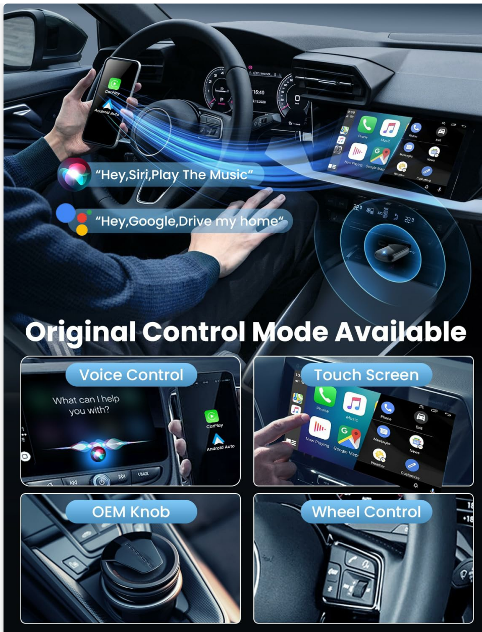
Image 5.1: Demonstration of various control methods supported by the adapter, including voice, touch screen, OEM knob, and steering wheel controls.