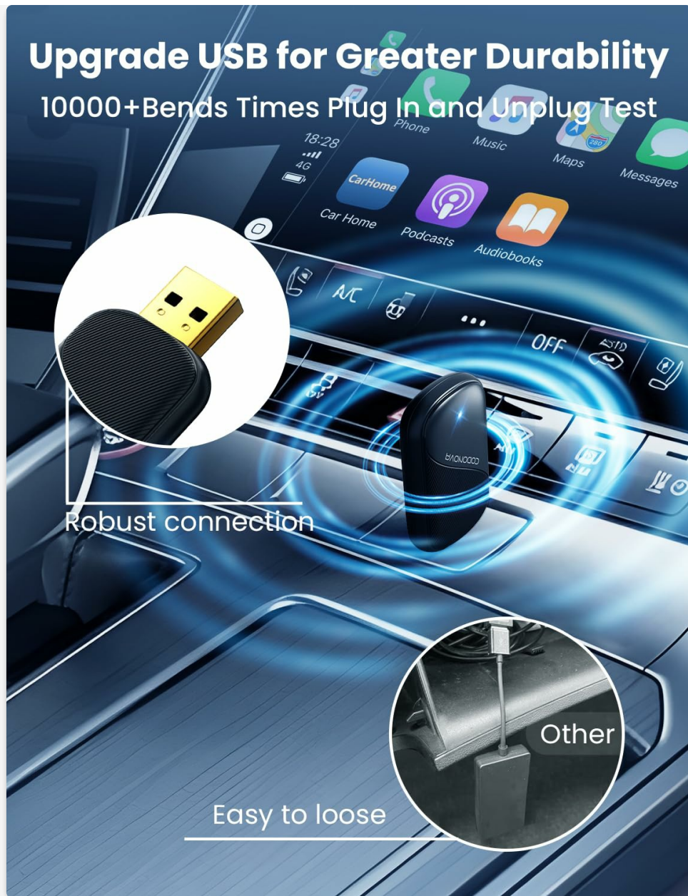
Image 6.1: Illustration highlighting the robust, gold-plated USB design of the adapter, built for durability and reliable connections.