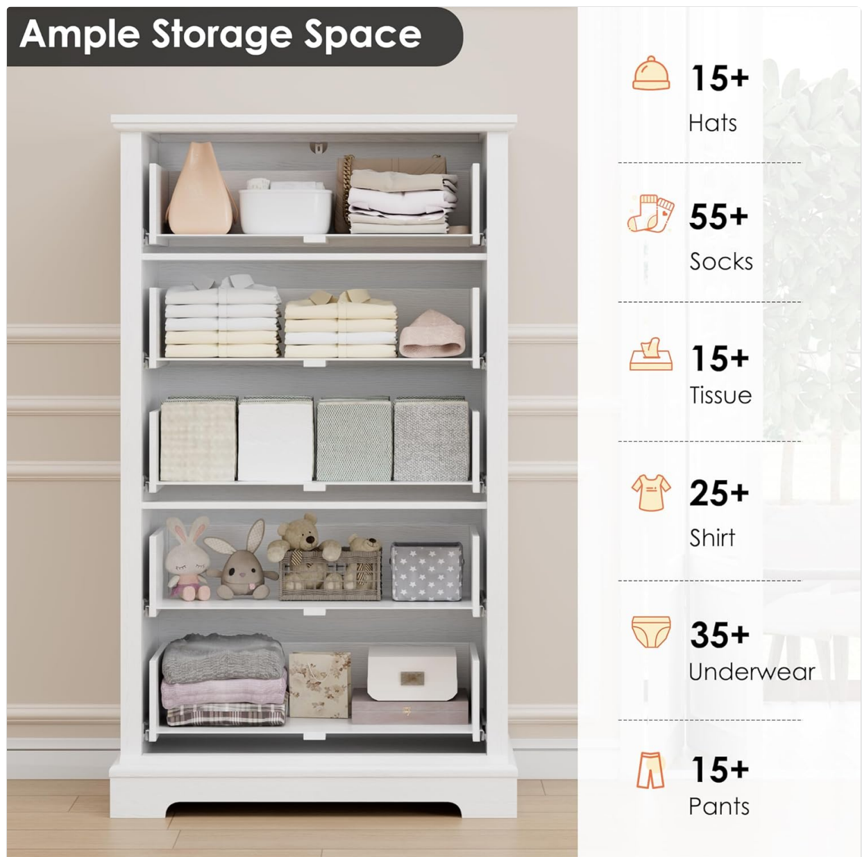
Figure 2: Ample Storage Space. This image demonstrates the generous storage capacity of the dresser's five deep drawers, suitable for organizing a variety of personal items.

The deep drawers provide significant capacity for organizing clothes, accessories, books, or office supplies. The wide tabletop offers additional space for decorative items or frequently used essentials.