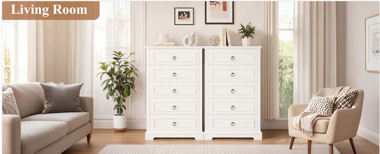
Figure 3: Dresser in a Living Room. The image displays the dresser as a functional and aesthetic addition to a living room environment.

This dresser is suitable for various settings including living rooms, hallways, entryways, and home offices, adapting to your specific storage and decor needs.